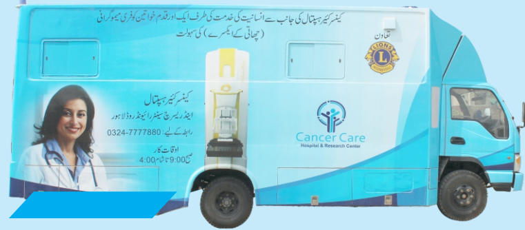
Mobile Mammography Vehicle

Cancer Care Hospital has spent USD 1 Million (PKR 176 Million) approximately on free mass breast cancer screening program for the under privileged. This burden has also been shared by MJF Lions Club Lahore.