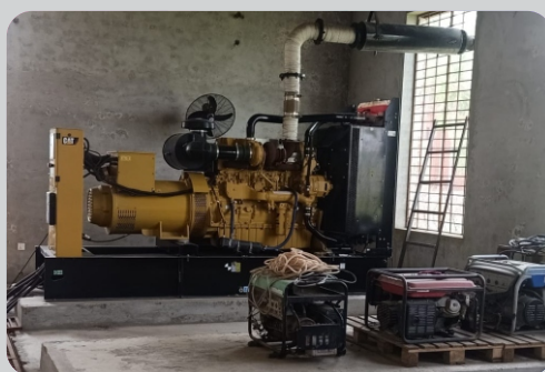
Completion of Power House PKR 17 M