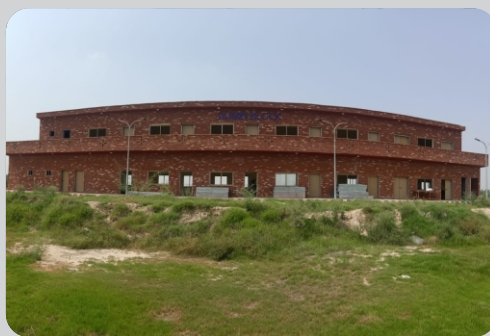
Completion of Admin Block PKR 7.7 M