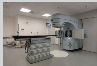
Dual Energy Linear Accelerator