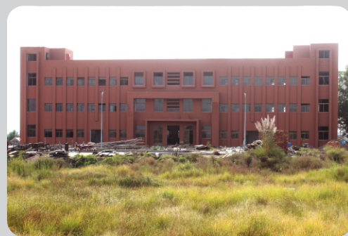
Completion of Sarai PKR 56.1 M