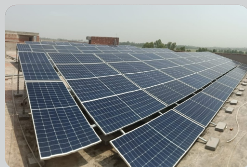
Installation of 144 Kw/h Solar PKR 12 M