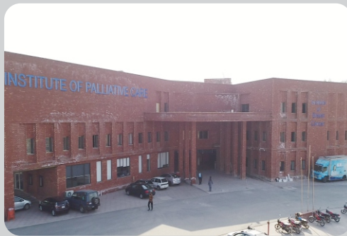
Completion of Institute of Palliative Care & Breast Cancer Centre PKR 900 M