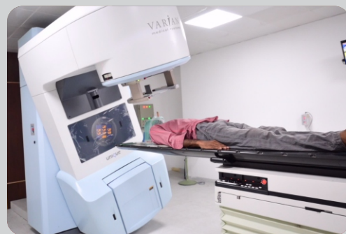
Installation of 2 Linear Accelerators PKR 511 M