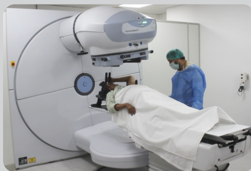
Installation of 2 Cobalt-60 Machines PKR 246 M