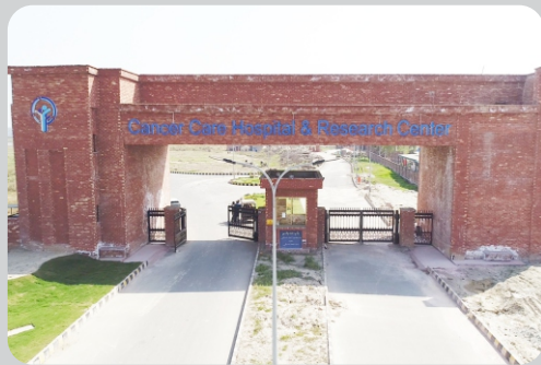
Completion of CCH Main Gate PKR 18.7 M