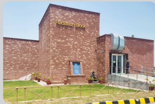
Construction of Radiation Block PKR 256 M