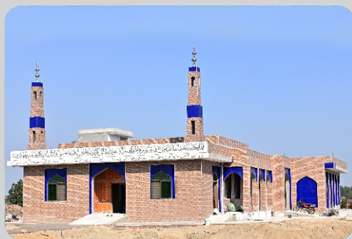
Completion of Mosque PKR 18.7 M