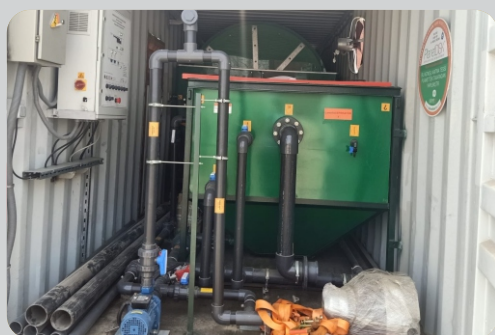
Installation of Water Filtration Plant PKR 18.7 M