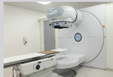
Single Energy Linear Accelerator