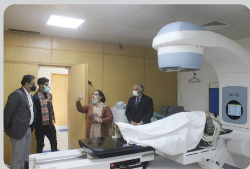
Installation of CT Simulator PKR 103 M