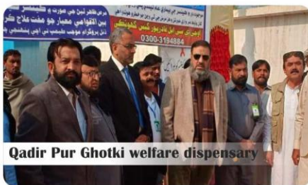
Qadir Pur Ghotki welfare dispensary