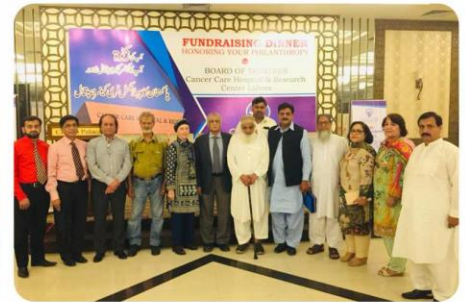
Cancer Care Hospital is thankful to the organizers of "Fundraising Iftar Dinner" held at Chiniot Palace, Faisalabad on 16th May, 2019.