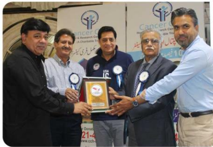
Cancer Care Hospital is thankful to the organizers of "Fundraising Iftar Dinner" held at The Heritage Club Sialkot Cantt on 9th May, 2019.