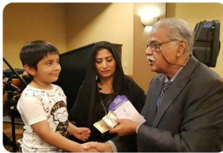
Cancer Care Hospital organized a Fundraising Dinner at Red Lion Hotel & Conference Center Seattle on 12th October, 2019.