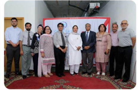
Inauguration of first Radiation Machine in Cancer Care Hospital. Dated 2nd June, 2019