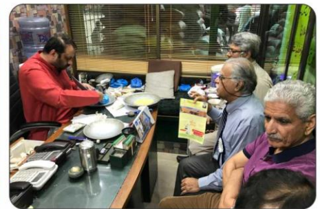
Cancer Care Hospital Fundraising & Awareness Campaign at Ghalla Mandi, Mian Channu, Chichawatni & Multan. Dated 18 April 2019

For those who give in charity, men and women, and loan to Allah a beautiful loan, it shall be increased manifold (to their credit), and they shall have (besides) a liberal reward. (51) 057.018