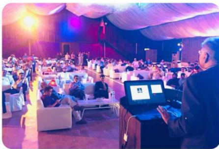
Cancer Care Hospital is thankful to the organizers of "Fundraising Iftar Dinner" held at Mezbaban Marquee Lahore on 11th May, 2019.