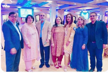
Cancer Care Hospital organized a Fundraising Dinner at White Lotus Banquet Hall, Sacramento on 11th October, 2019.