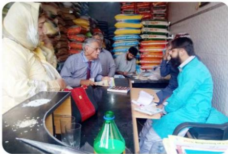
Cancer Care Hospital Fundraising & Awareness Campaign at Ghalla Mandi Karachi & Hyderabad. Dated 8 April & 9 April 2019