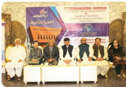
Cancer Care Hospital is thankful to the organizers of "Fundraising Iftar Dinner" held at Defence Orchards, Sargodha on 12th May, 2019.