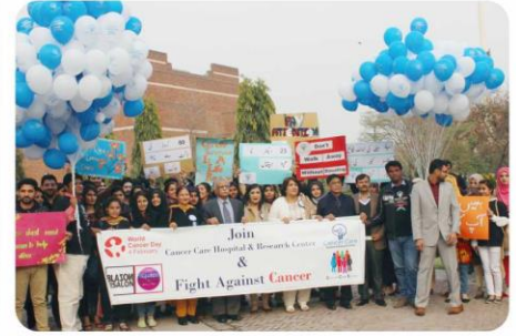
4th Feb World Cancer Day 2019 organized by Cancer Care Hospital & Research Center with its Cancer Care Society along with 300 volunteers from 20 different Universities.