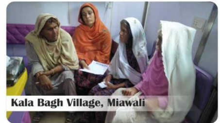
Kala Bagh Village, Miawali