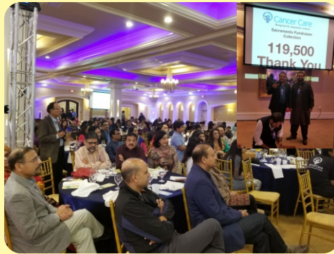
Grand Fundraising Dinner for Cancer Care Hospital in Sacramento California USA.