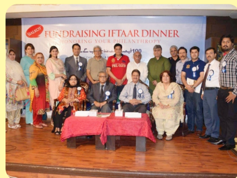
Fundraising Iftar Dinner at The Jeevans Hotel, Sialkot.