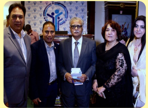
Fundraising & Thanks giving Dinner arranged in New York, USA by PANI organization.