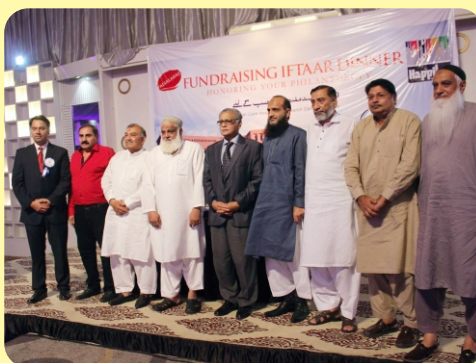
Cancer Care Hospital organized Fundraising Iftar Dinner at Lyallpur Gymkhana, West Canal Road, Faisalabad.