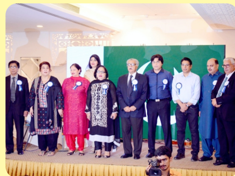
Cancer Care Hospital organized Fundraising Musical Dinner at PC-Hotel, Lahore.