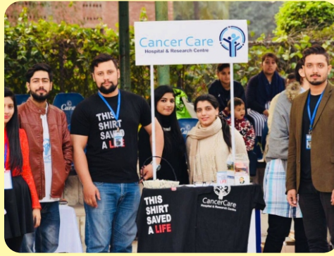
Cancer Care Hospital Fundraising & volunteer registration in Kinnaird College Lahore.