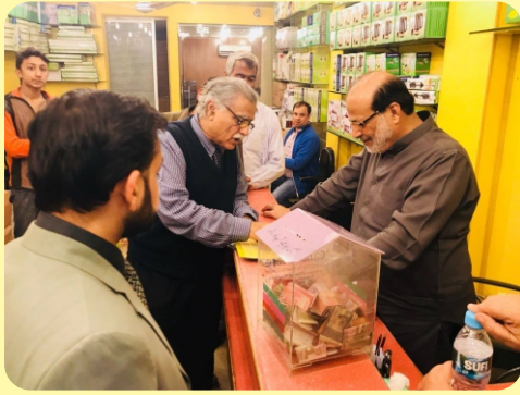
Cancer Care Hospital Fundraising and Awareness Campaign at Shah Alam Market Lahore.