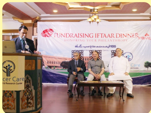
Fundraising Iftar Dinner at Mughal Mahal Hotel, Gujranwala on the forum of Cancer Care Hospital.