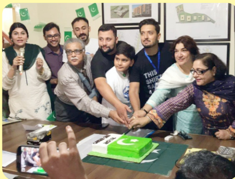
Cancer Care Hospital & Research Center along with Cancer Care Society celebrating 70th Independence Day of Pakistan.