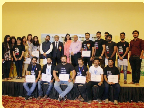
Fundraising & Thanks giving Dinner in Honor of Allah's Faeqr Group arranged at Falettes Hotel Lahore by CCH&RC.