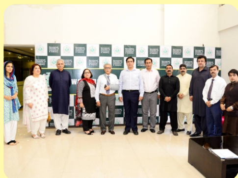
Delegation of Cancer Care Hospital & Research Center visited Rawalpindi Chamber of Commerce & Industry.