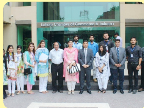
Volunteers of Cancer Care Society visited Lahore Chamber of Commerce & Industry.