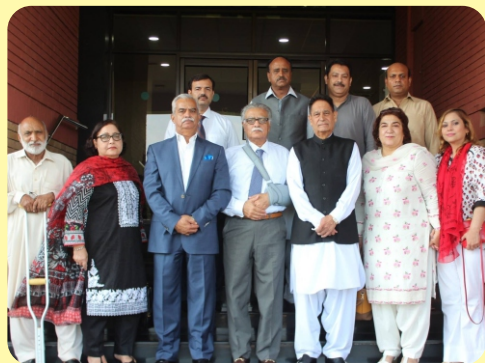
Delegation of Cancer Care Hospital & Research Center visited Islamabad Chamber of Commerce & Industry.