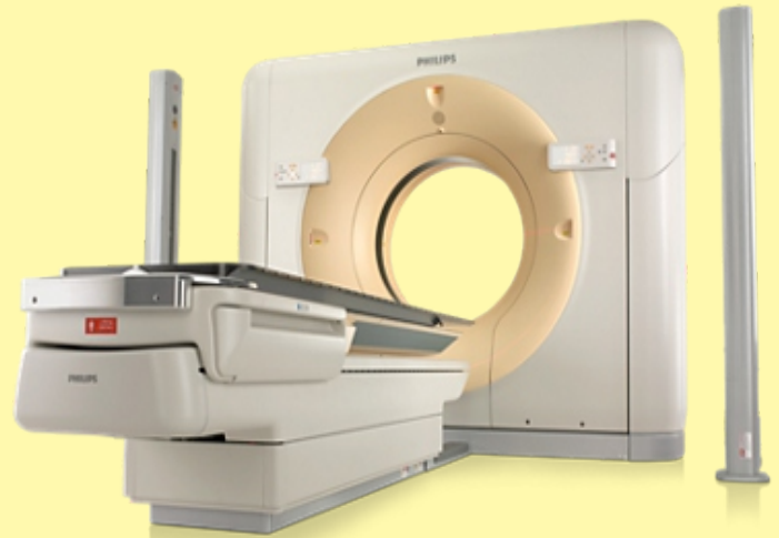
Cancer Treatment Simulator

Majority of cancer patients need some type of radiation therapy during the course of their illness. Presently due to shortage of radiation machines patients have to wait for 5 to 8 months for radiation treatment and during this period many patients die and in others disease progresses. Cancer Care Hospital & Research Center is starting construction of Radiation Block. It will provide Free of cost radiation therapy to all patients.