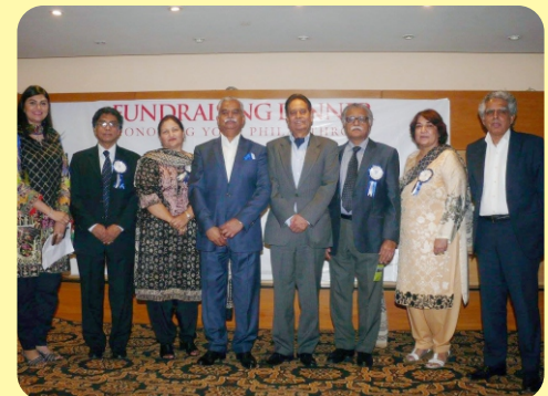
Fundraising Dinner arranged in Islamabad Club by Cancer Care Hospital & Research Center.

For those who give in charity, men and women, and loan to Allah a Beautiful Loan, it shall be increased manifold (to their credit), and they shall have (besides) a liberal reward. (51) 057.018