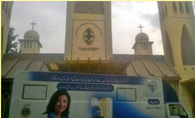
Cancer Care Hospital Team carried out Free Mammography at St Peter Church Waris Road Lahore. They have carried out 59 Free Mammography at this Location without any discrimination.

Cancer Care Hospital & Research Center has spent $. 1 Million on this mega project & provided free services worth = $. 444,121