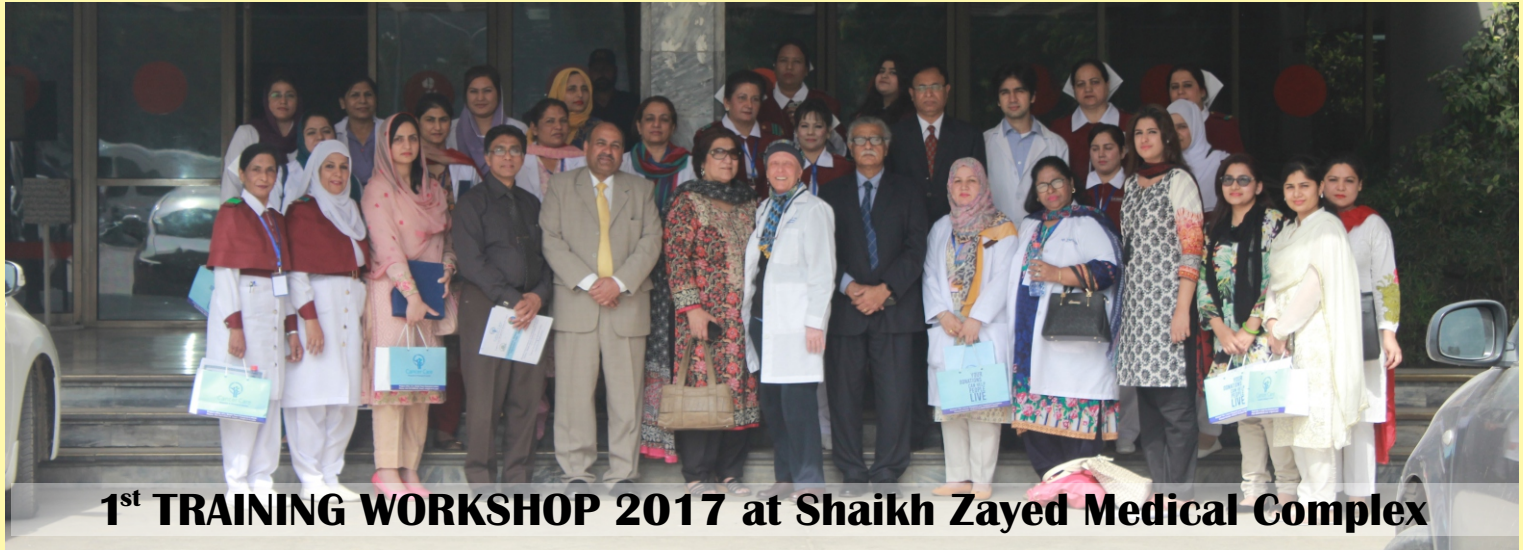
1 st TRAINING WORKSHOP 2017 at Shaikh Zayed Medical Complex