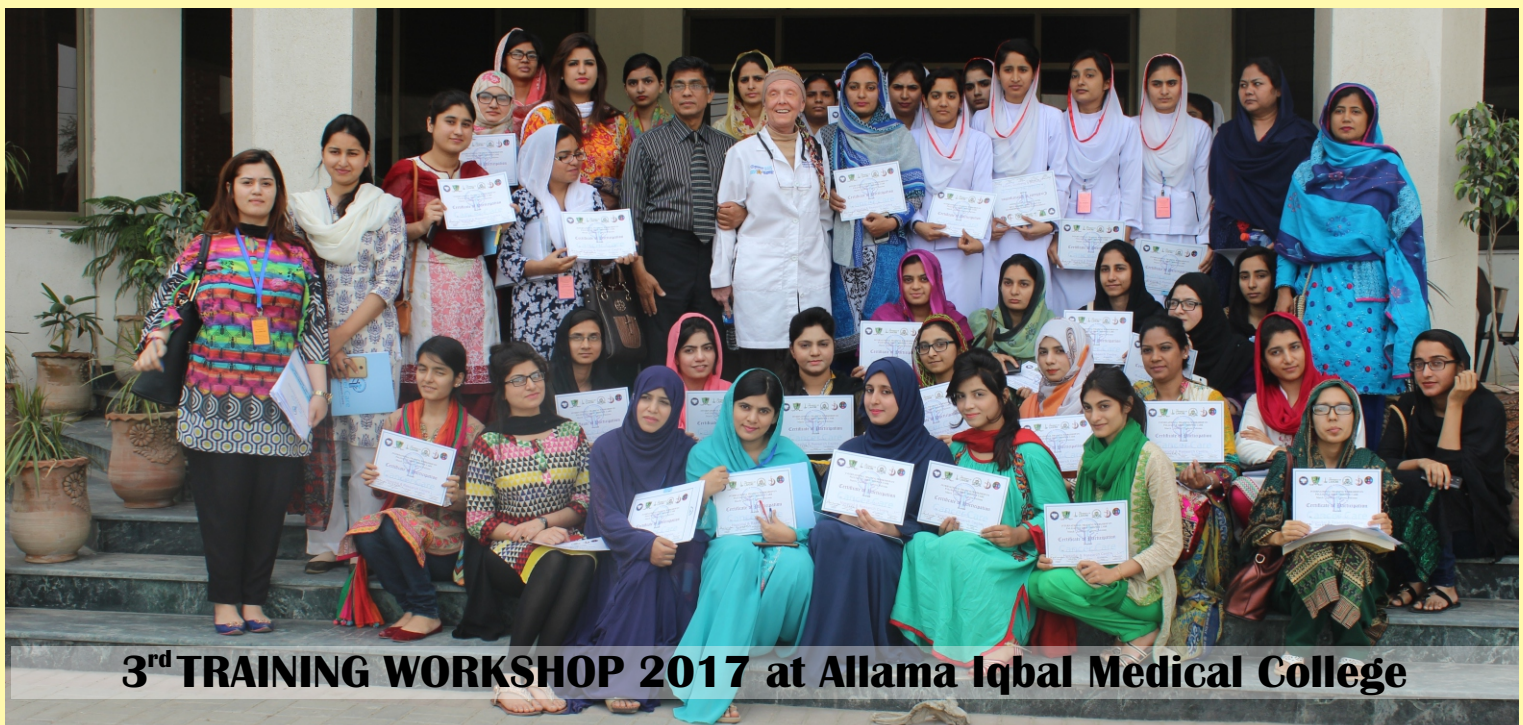
3 rd TRAINING WORKSHOP 2017 at Allama Iqbal Medical College

Everyone has been made for some particular work, and the desire for that work has been put in every heart.” – Rumi