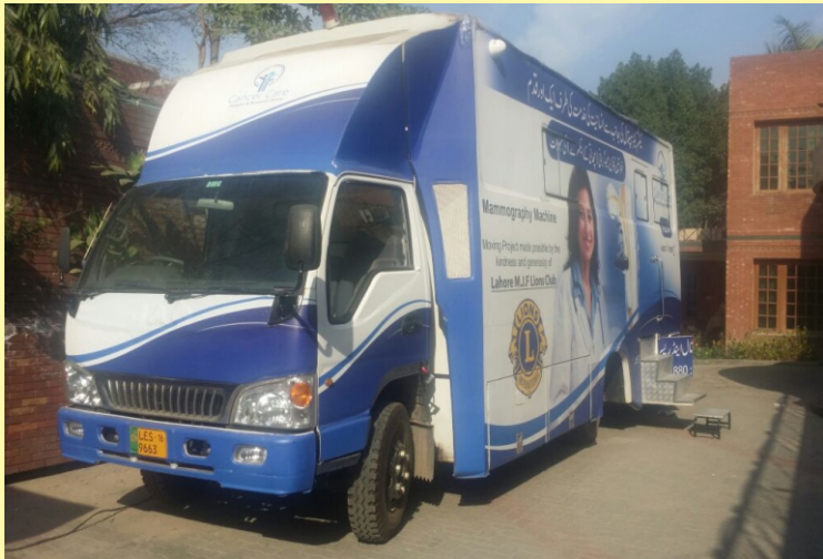
Cancer Care Hospital Team carried out Free Mammography at Aga Khan Health Center, Davis Road Lahore. They have carried out 70 Free Mammography at this location without any discrimination.