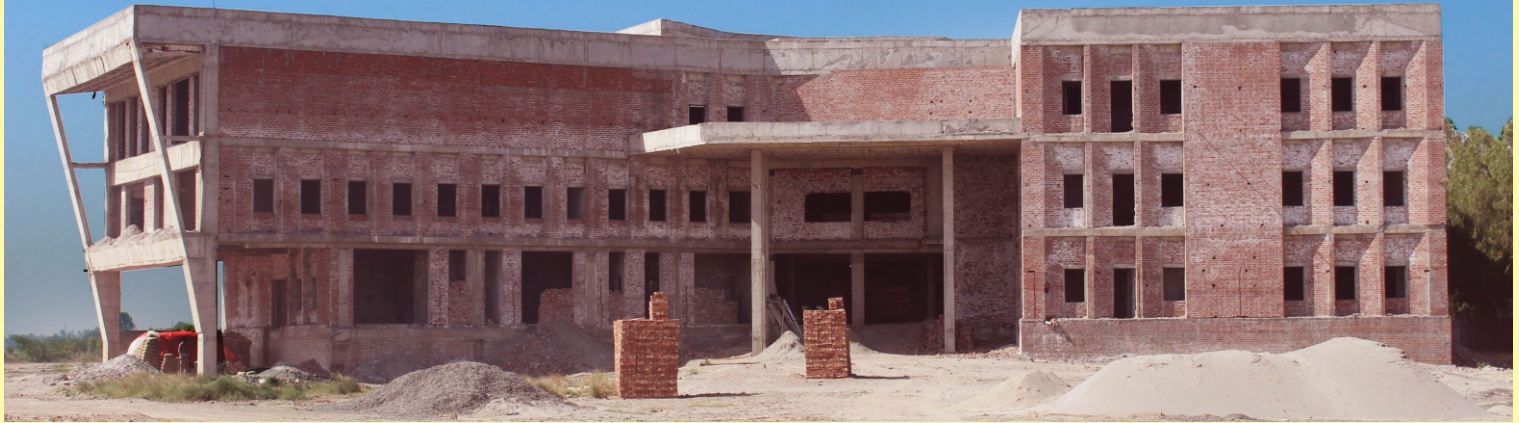
Wings of U-Shaped Institute of Palliative Care (IPC)