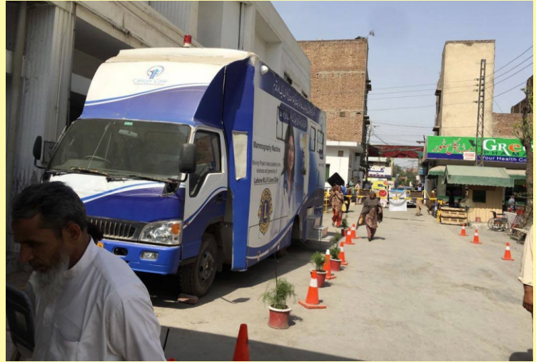
FREE mass mammography by Cancer Care Hospital at Aziz Fatima Hospital Faisalabad.