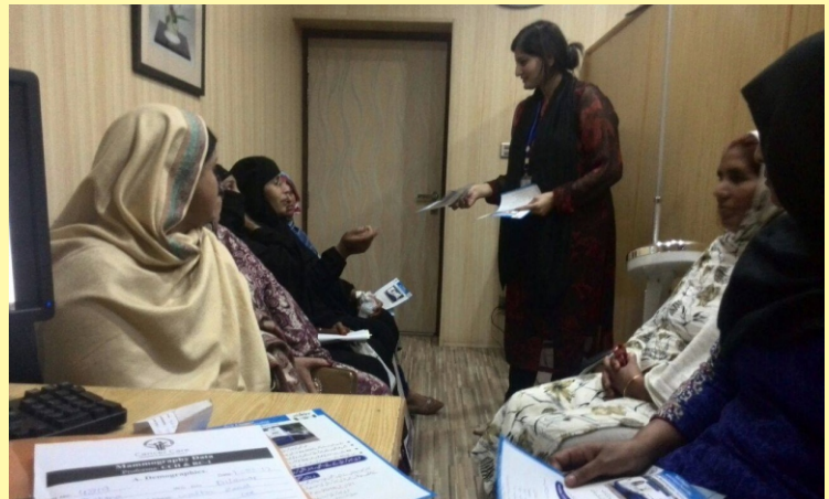
Cancer Care Team carrying out FREE mammography at Hijaz Hospital Lahore. They have carried out approximately more then 5000 FREE mammography at this location

Cancer Care Hospital has spent $. 1 Million on free mass breast cancer screening program for the under privileged. This burden has also been shared by MJF Lions Club Lahore.