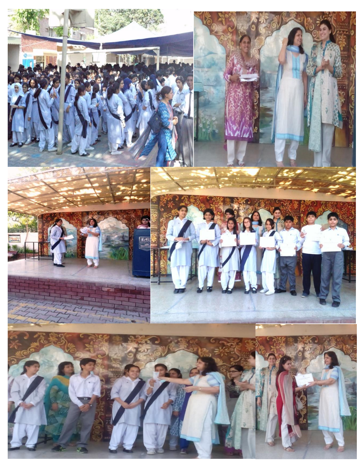
Prevention and Control of Cancer awareness lecture LGS RA Bazar Lahore.