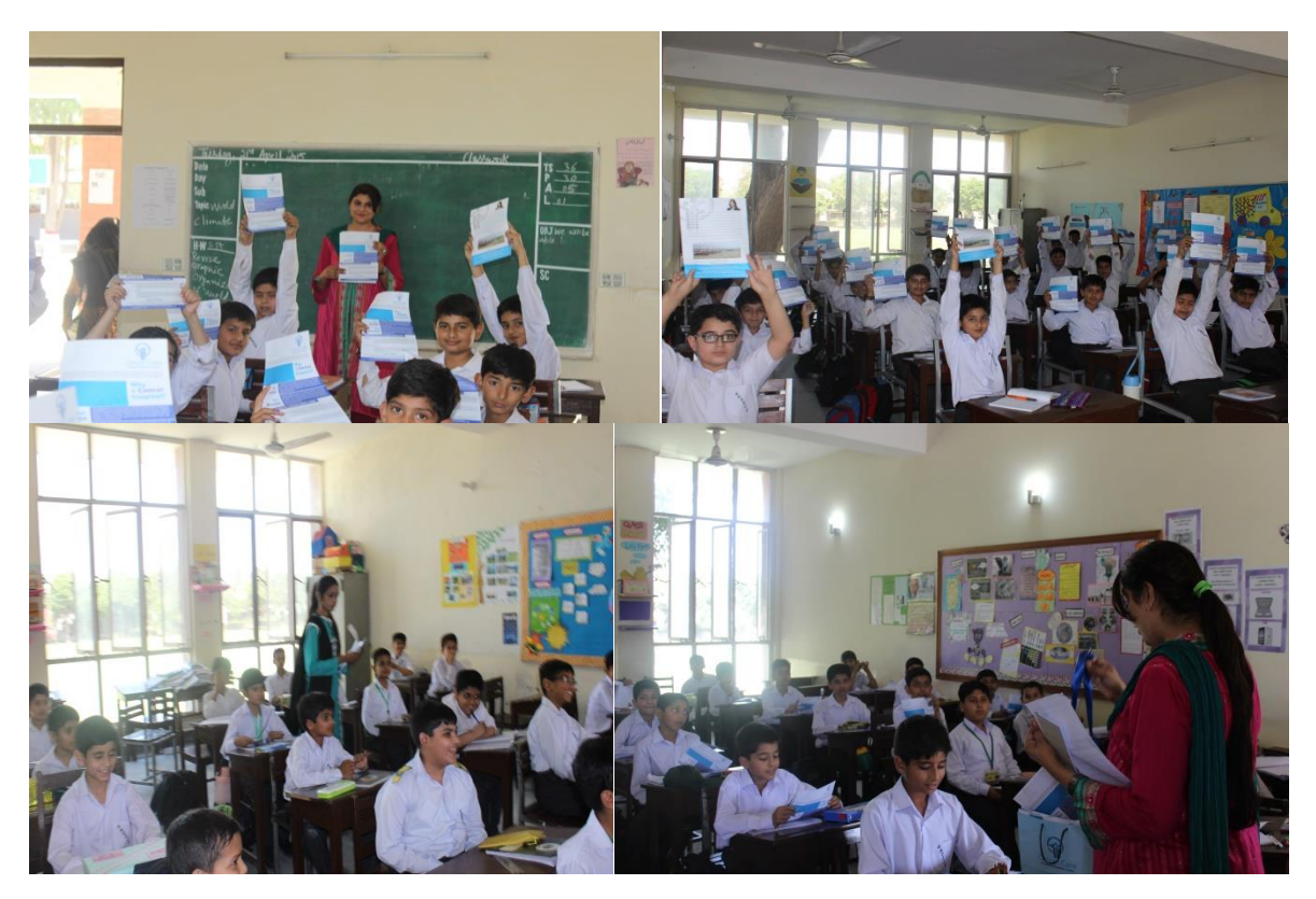
Prevention and Control of Cancer Campaign at Army Public School, Lahore.