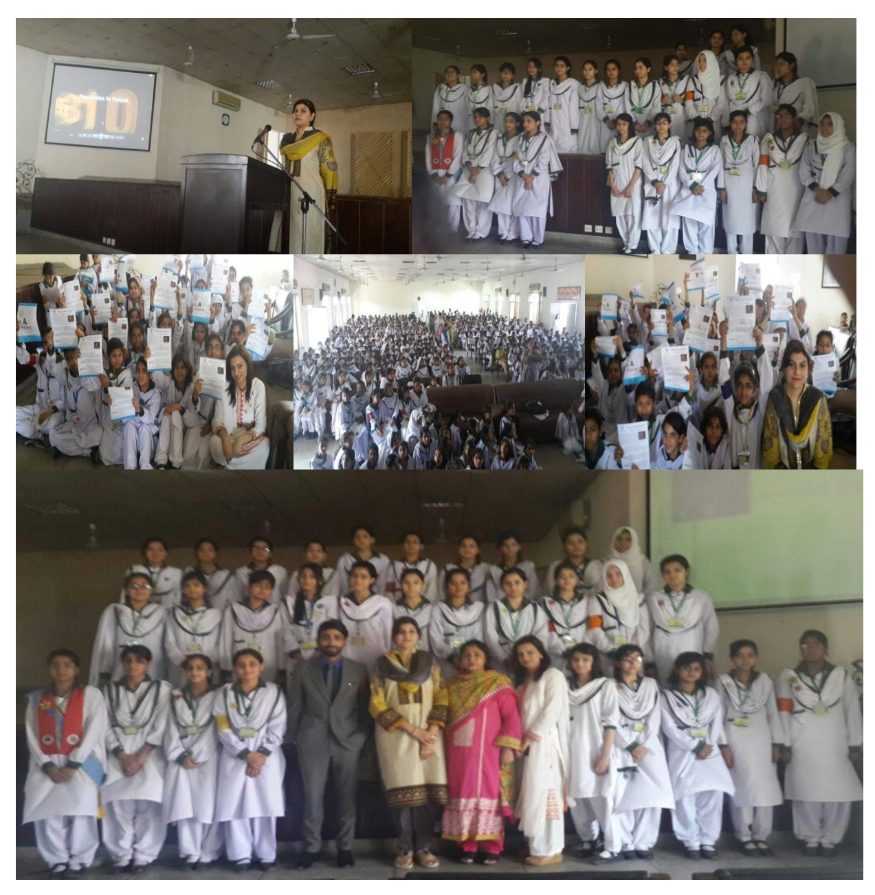
Prevention and Control of Cancer Awareness Campaign at Azam Garrison College.