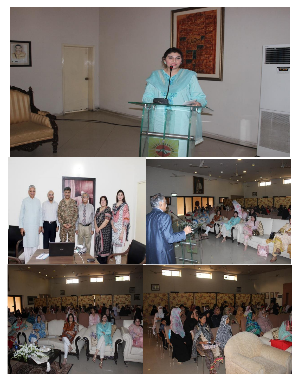
Organized a Cancer awareness meeting with Brigadier Sabir of Pakistan Army.