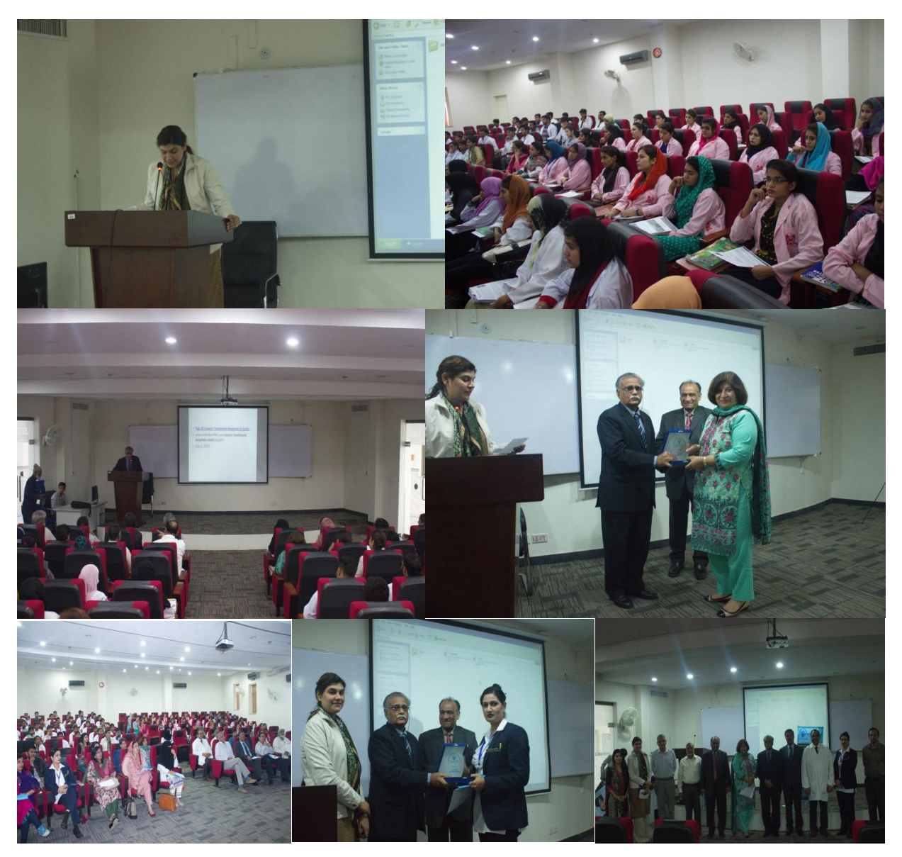
Prevention and Control of Cancer Awareness Campaign at Sharif Medical City.