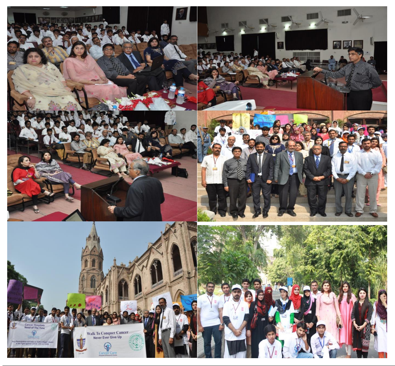
International Cancer Prevention and Treatment Conference GCU, Lahore.