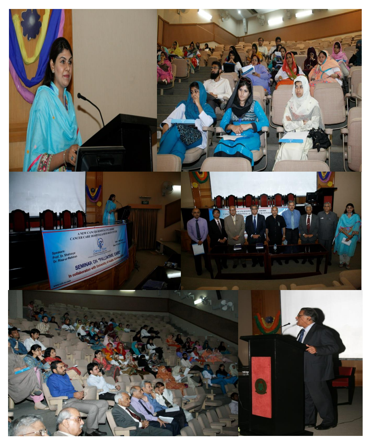
Prevention and Control of Cancer Campaign at University of Health Sciences, Lahore.