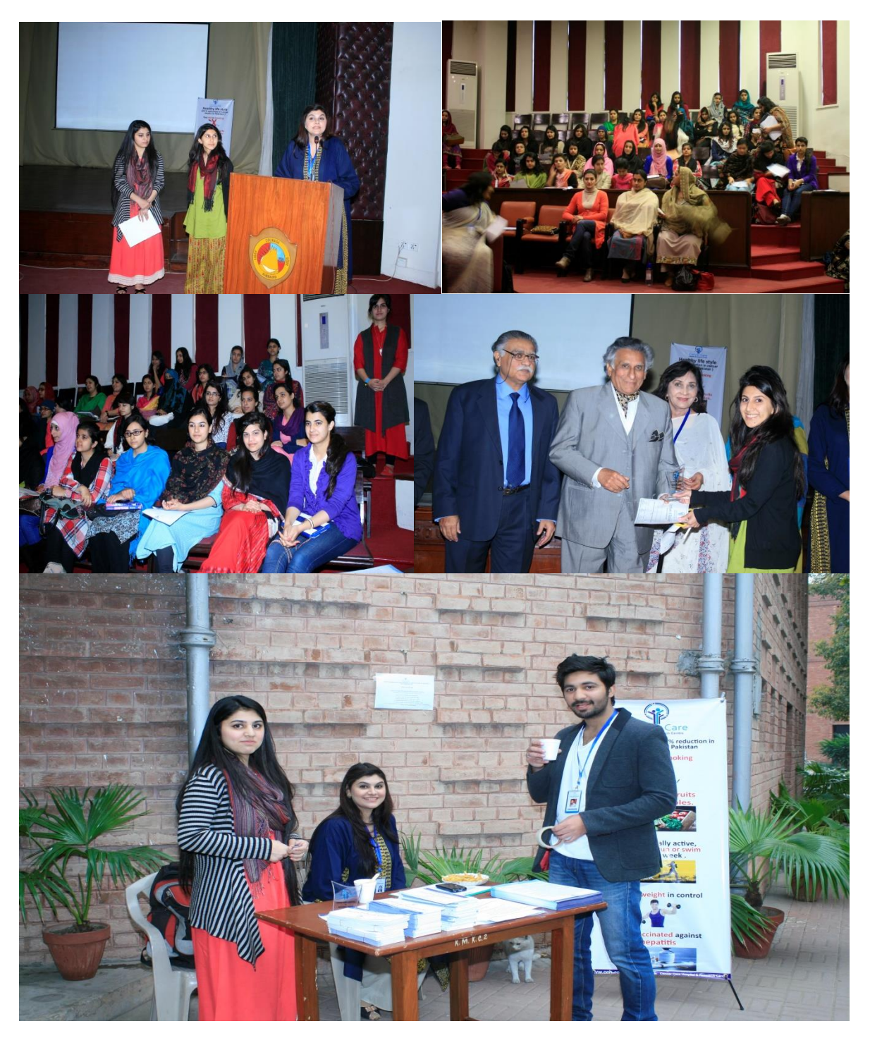
Breast Cancer & Cancer Prevention and Control Lecture at Kinnaird College Lahore.