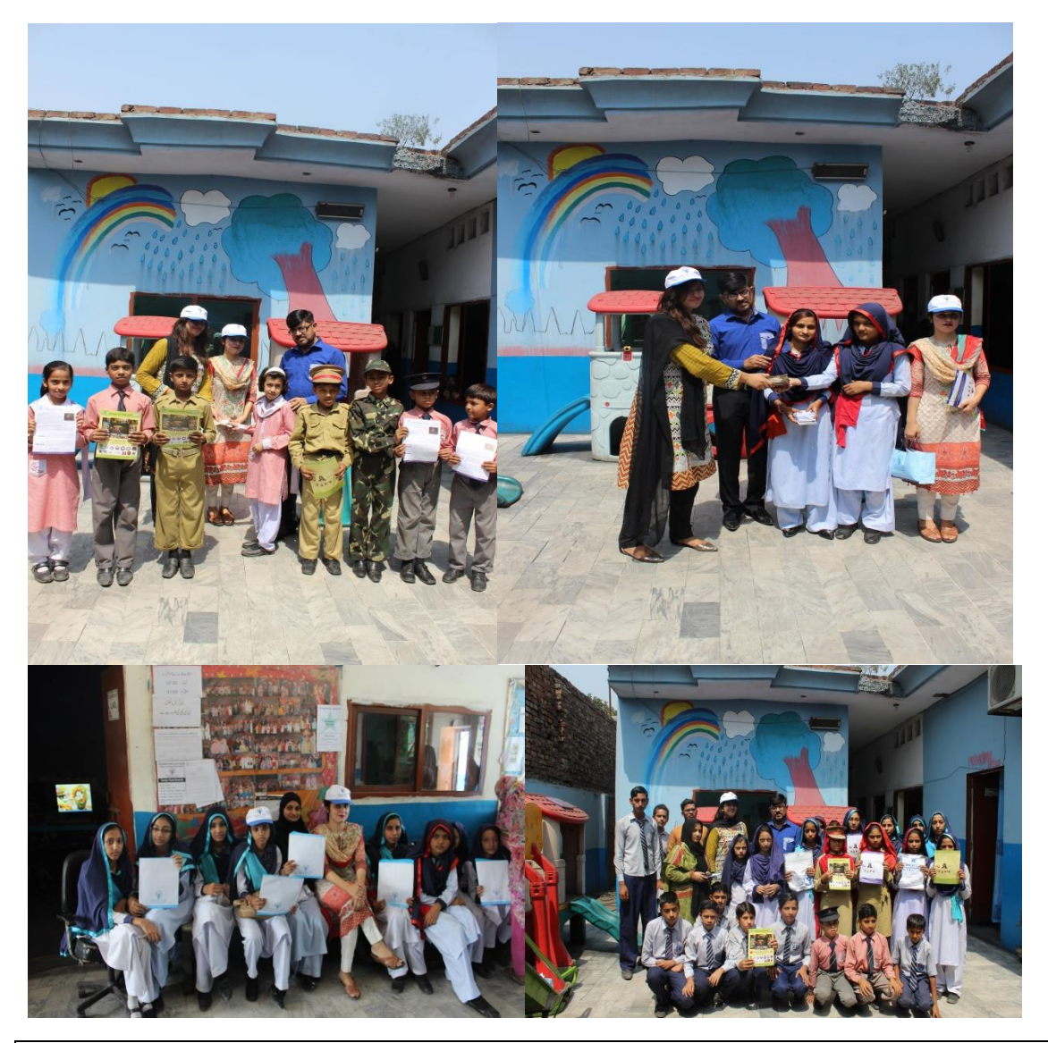
Prevention and Control of Cancer Awareness Campaign at English Grammar School, Lahore.