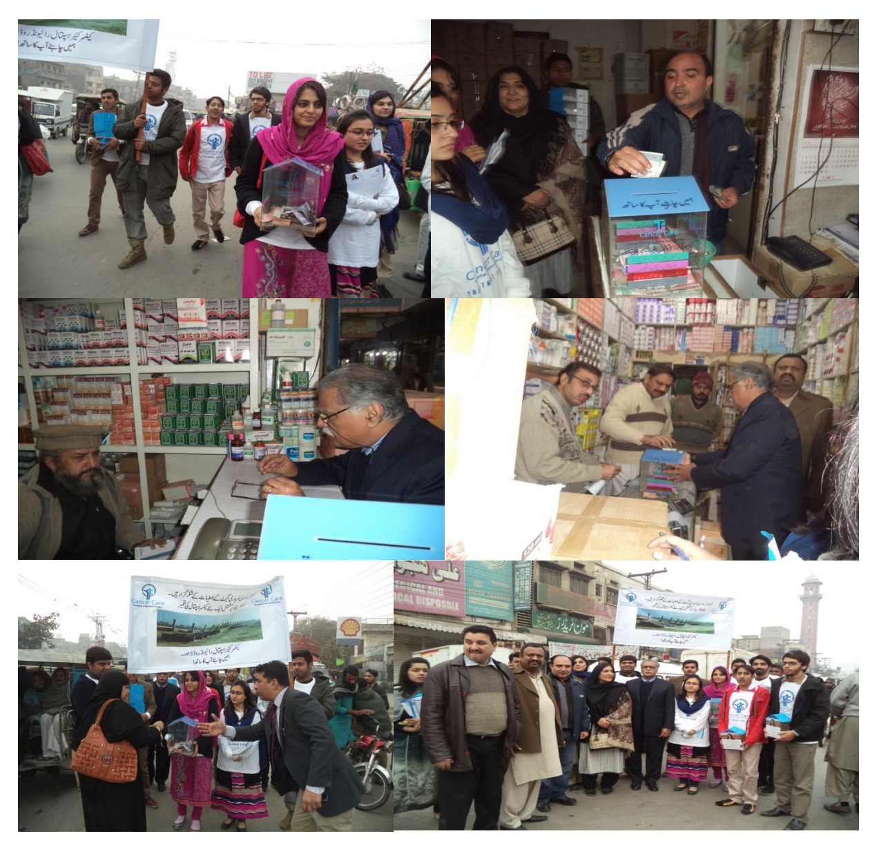
Lohari market Prevention and Control of Cancer Campaign.