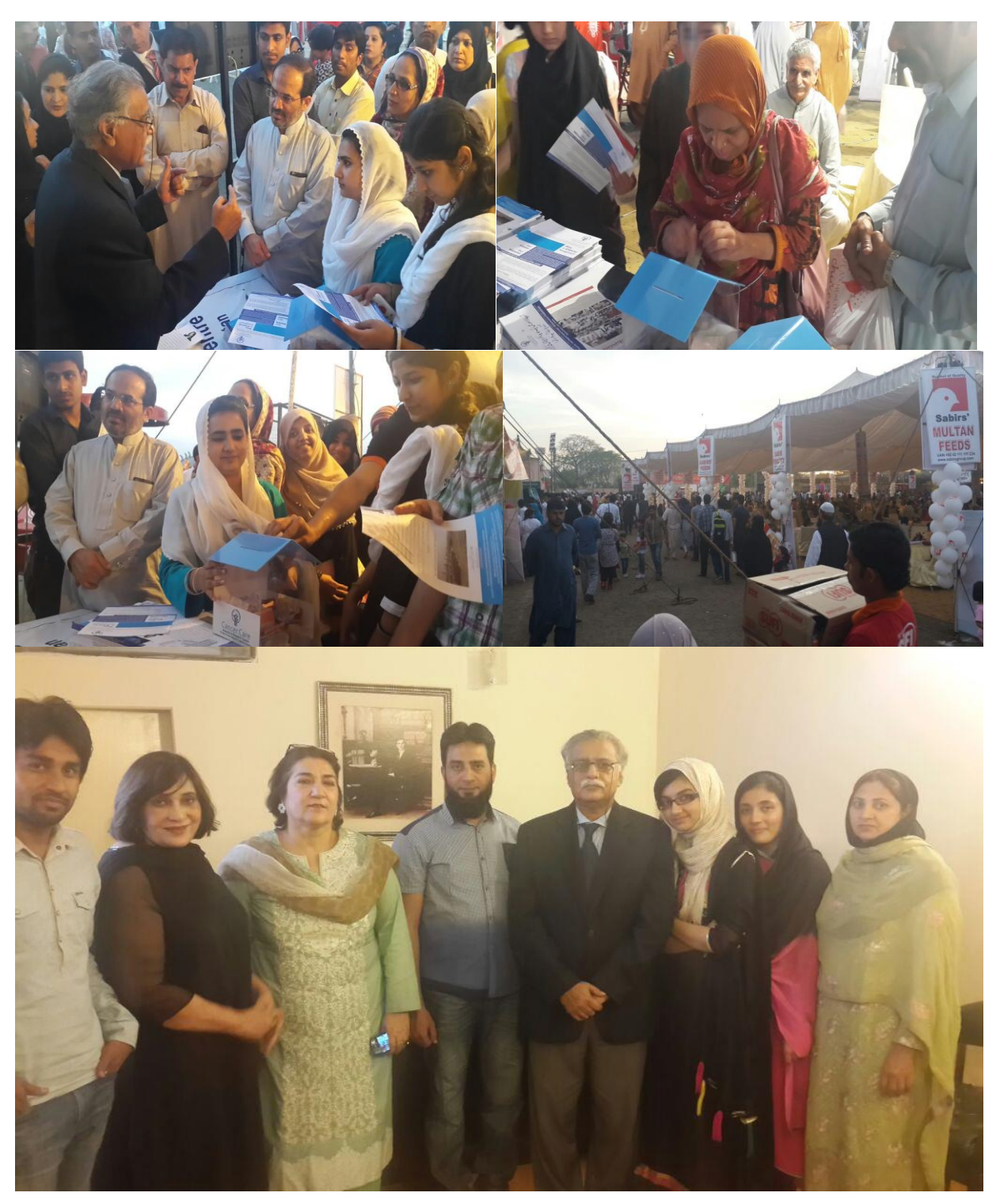
Prevention and Control of Cancer Awareness Stall at Race Course Park, Lahore.