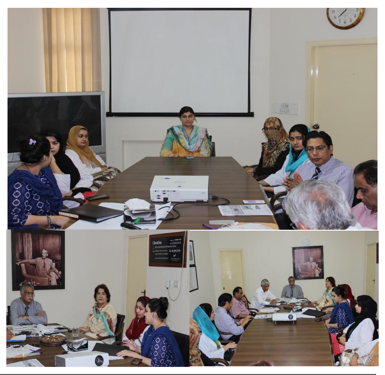
Organized a meeting with volunteers of Cancer Care Hospital & Research Centre.