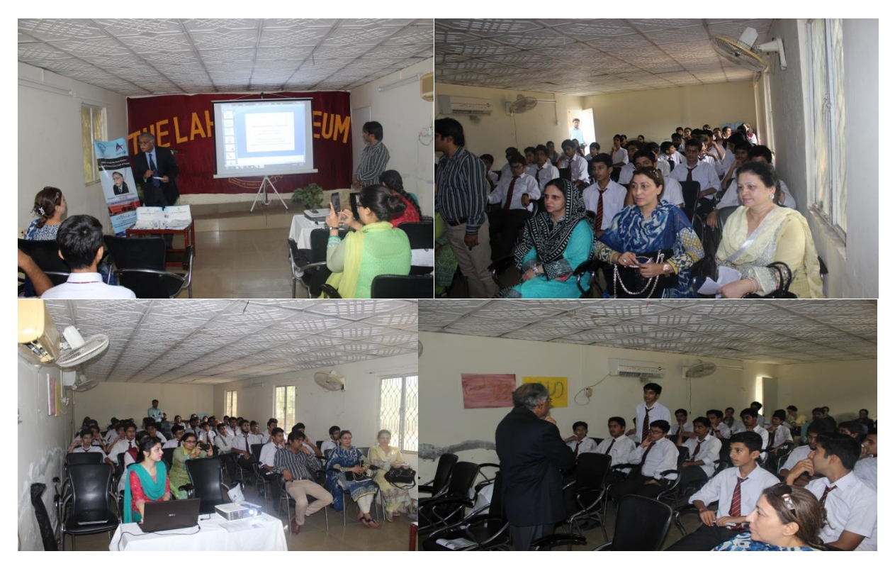
Prevention and Control of Cancer Awareness Campaign at Lahore Lyceum.