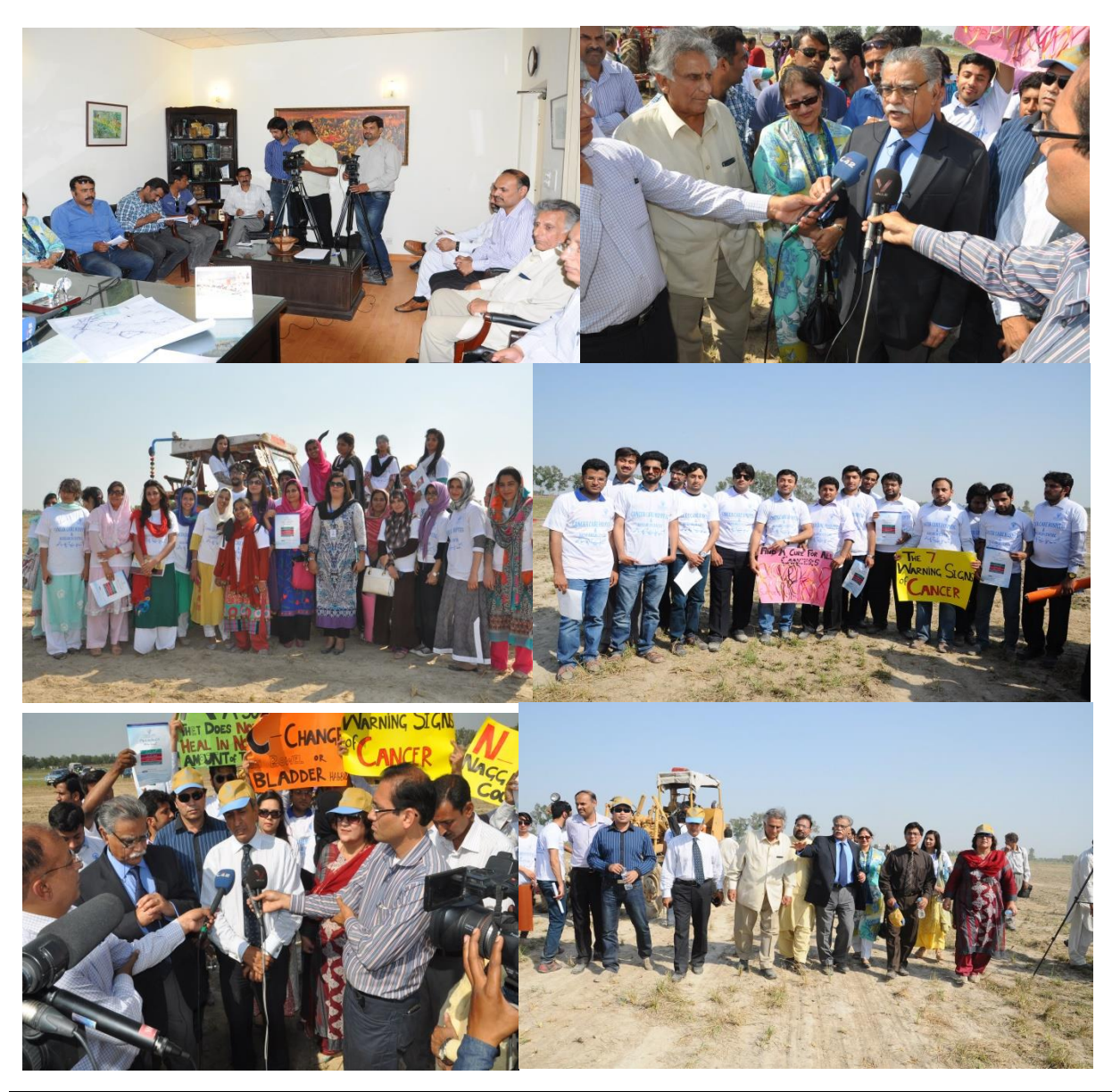
Site Visit and Media Campaign at Cancer Care Hospital & Research Centre Foundation.