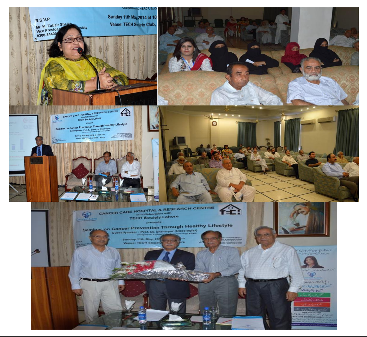
Prevention and Control of Cancer Campaign at Tech Society, Lahore.