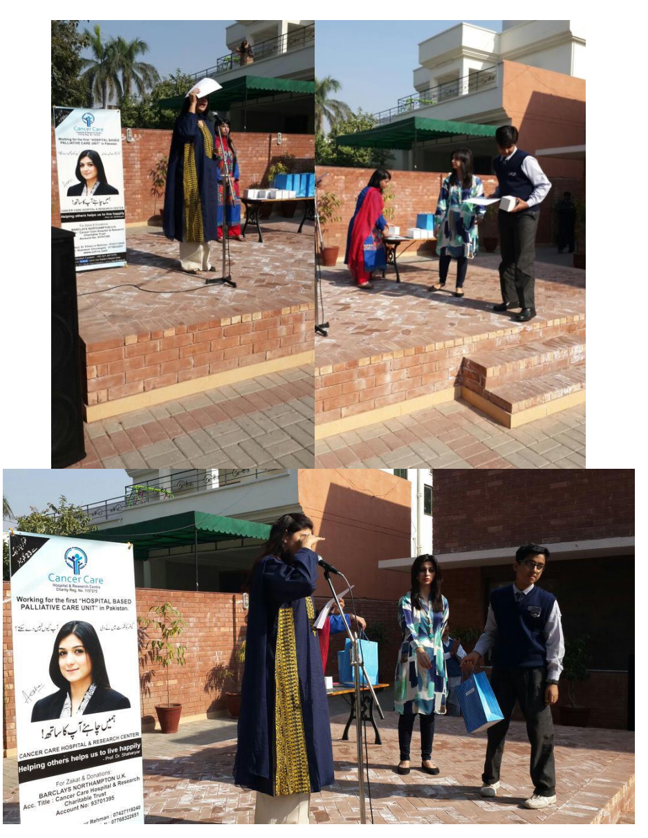
Prevention and Control of Cancer Awareness Lecture at LGS Gulberg Lahore.