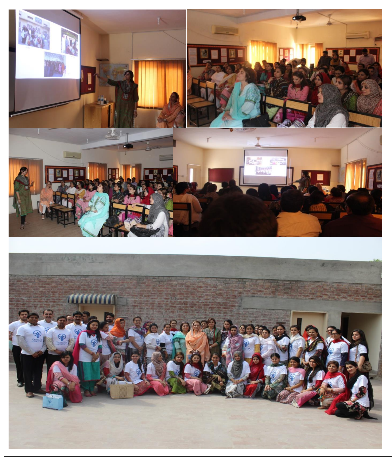
Breast Cancer Awareness Lecture at Bloomfield Hall School Faculty, Lahore.