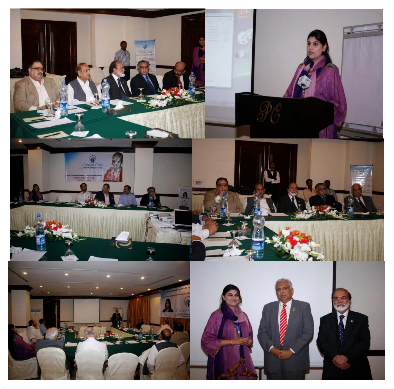
Meeting with Lions Club International at Pearl Continental Hotel, Lahore.