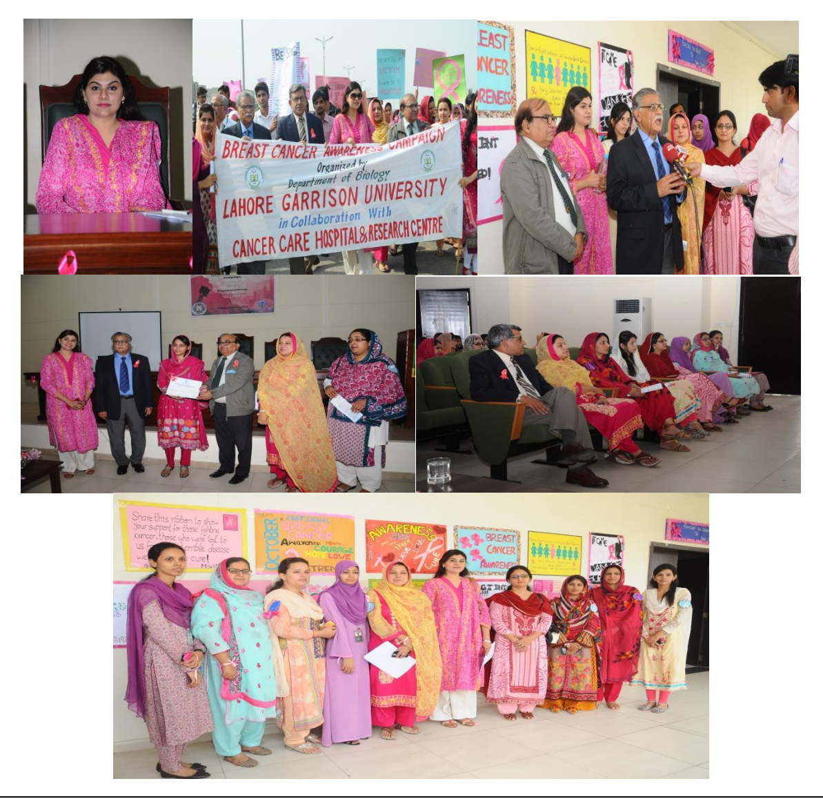
Breast Cancer Awareness Campaign and Poster Competition at Garrison University Lahore.