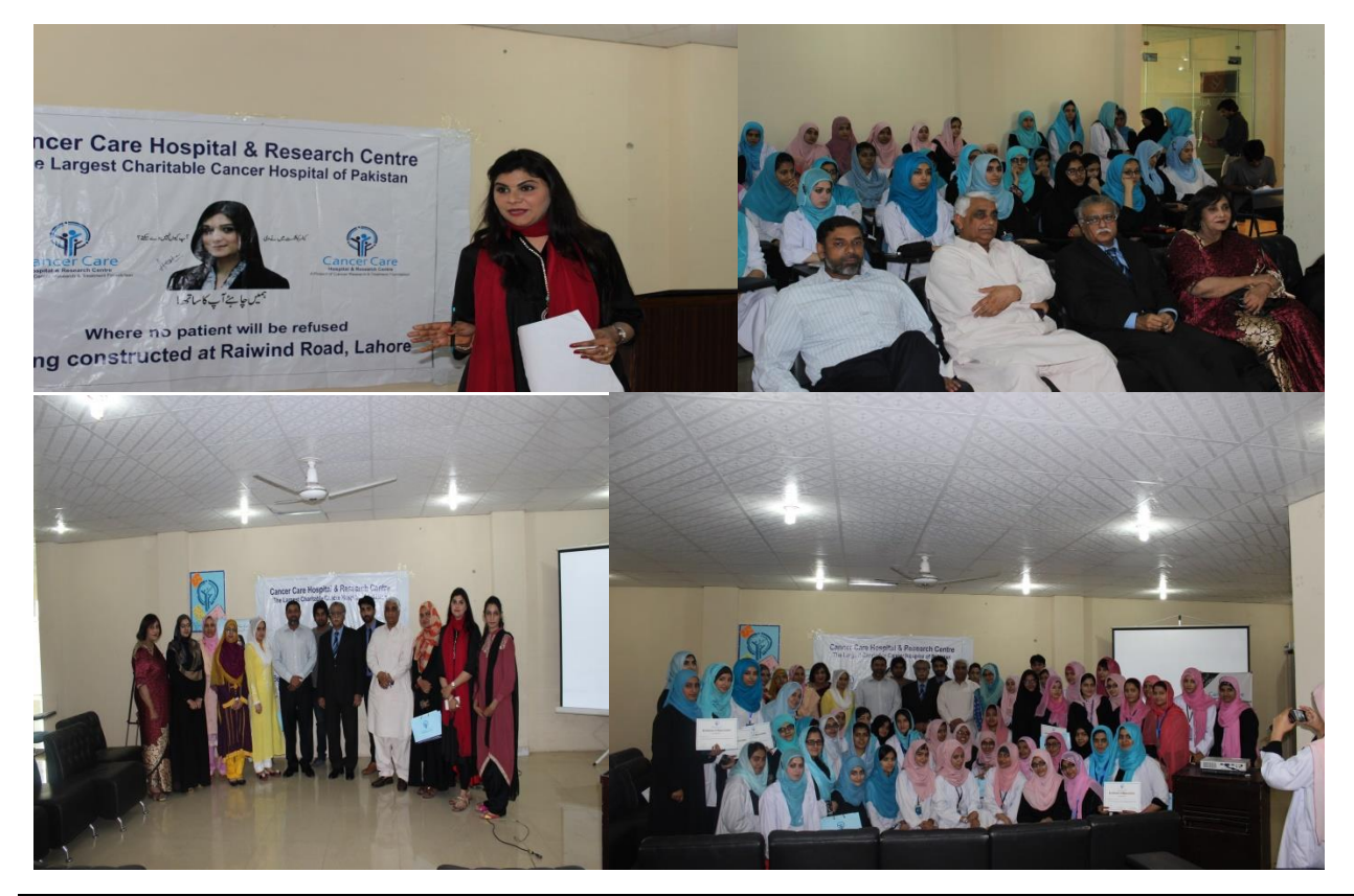
Breast Cancer awareness Campaign at Ripha International University, Lahore.