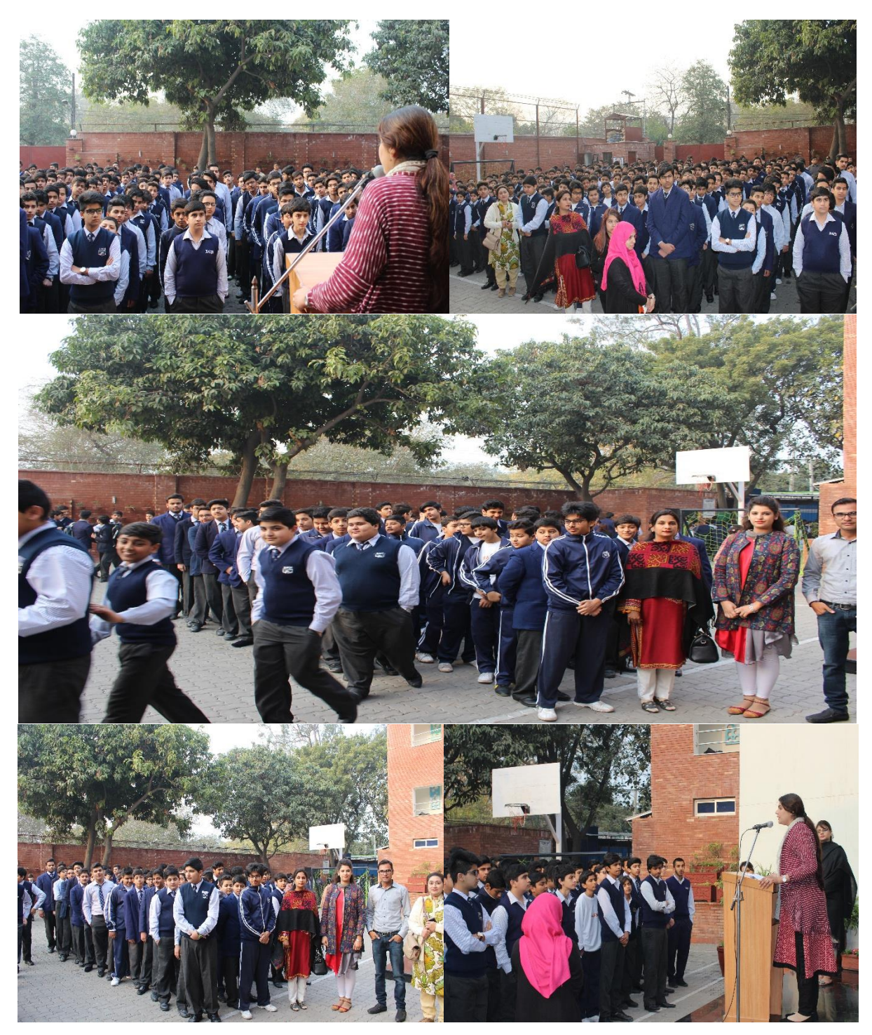
Prevention and Control of Cancer Awareness Campaign at LGS.