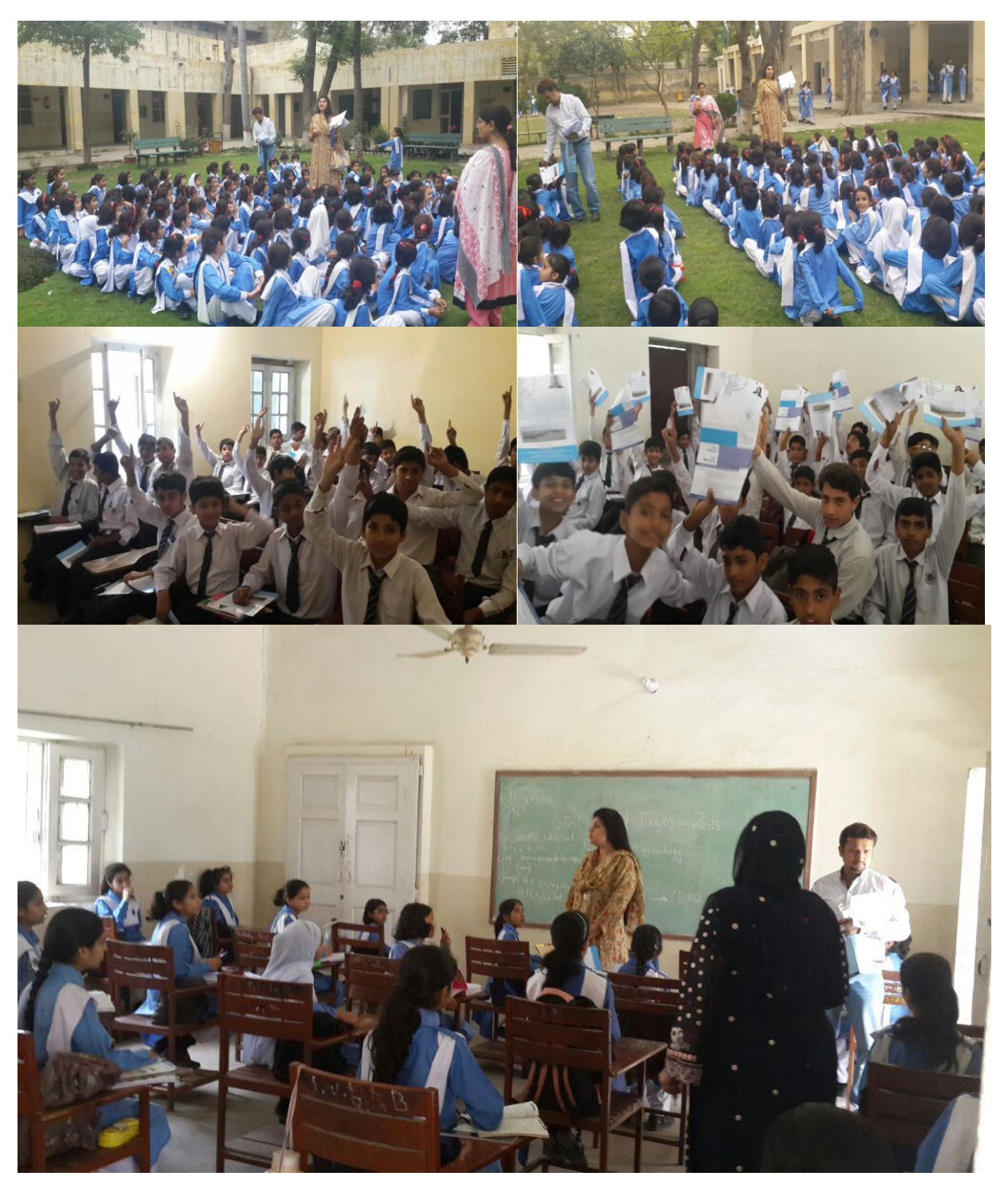
Prevention and Control of Cancer Awareness Campaign at Federal Government School, Lahore.