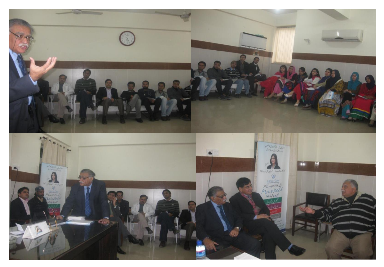
Lecture on Palliative care in Services institute of medical Sciences, Lahore.