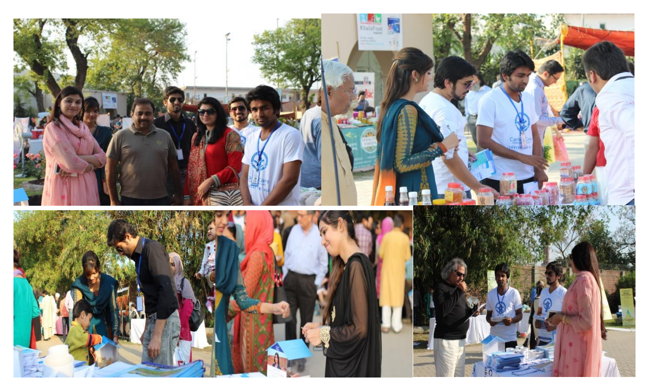
Prevention and Control of Cancer Awareness Stall at Royal Palm Club Lahore.