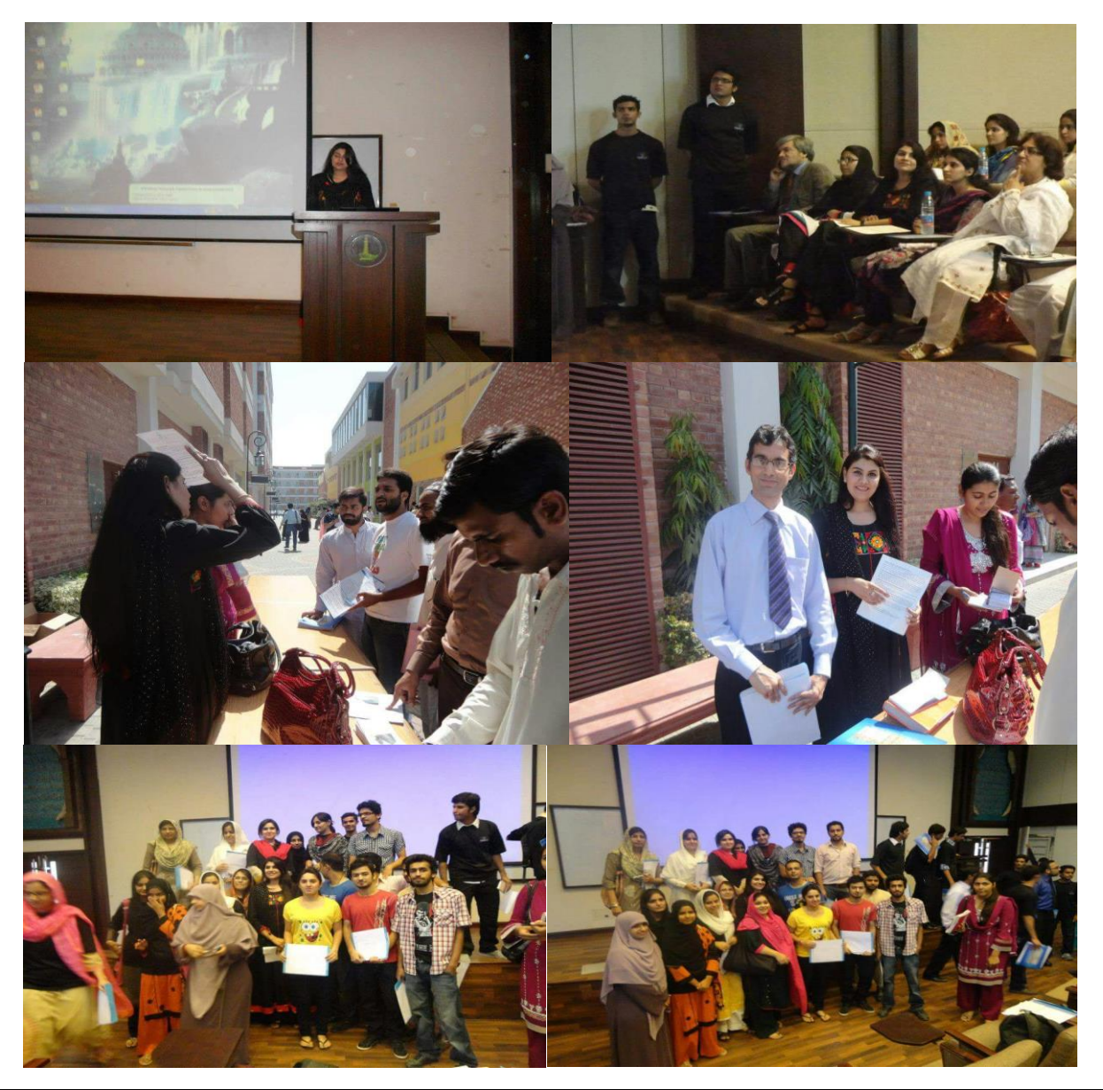
Prevention and Control of Cancer Campaign at University of Lahore.