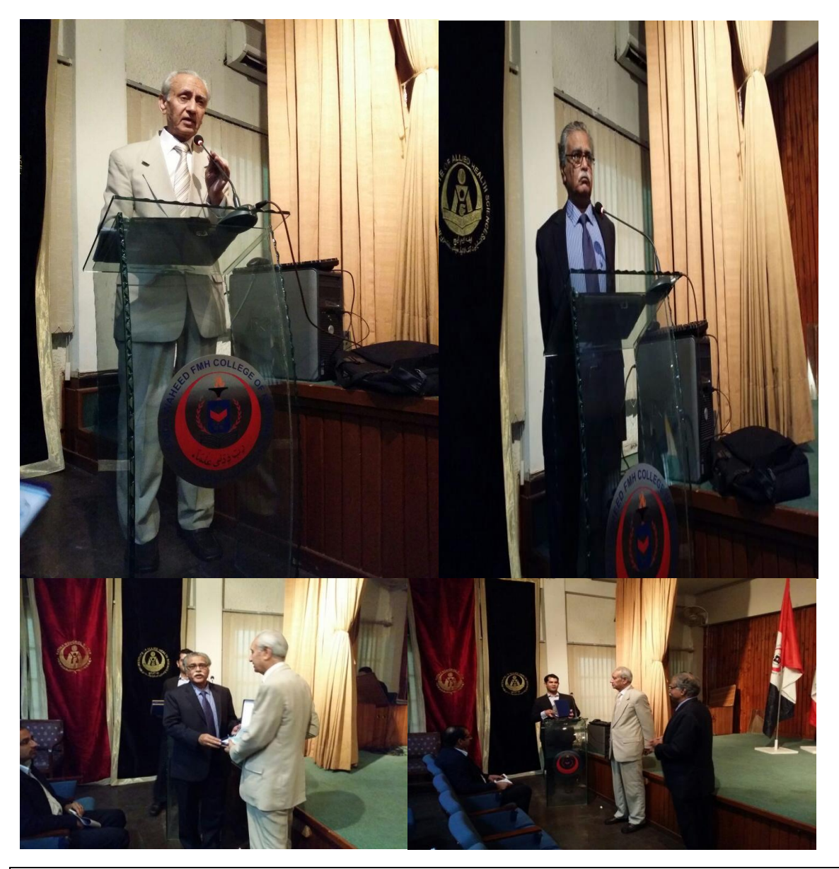
Prevention and Control of Cancer Campaign at Fatima Memorial Hospital Lahore.