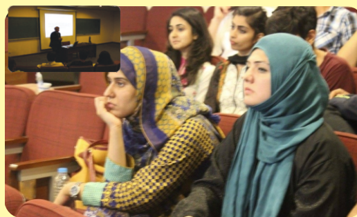
Seminar at LUMS