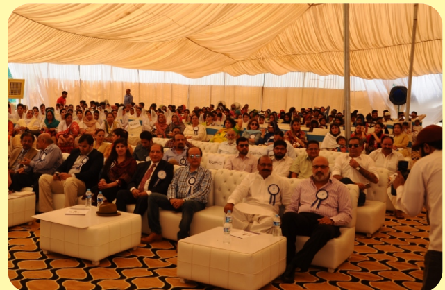
Guests in Inaugural Ceremony