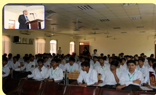
Garrison Academy For Boys, Cambridge Studies