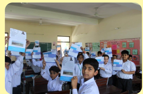
Army Public Junior Schools