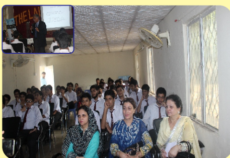
The Lahore Lyceum School