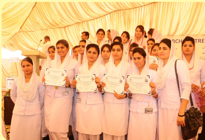
Completion of certified training course of Palliative Care