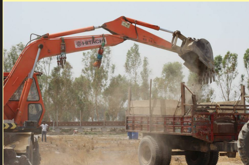
Moment of Ground Breaking