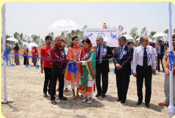
Ribbon cutting ceremony by cancer survivors