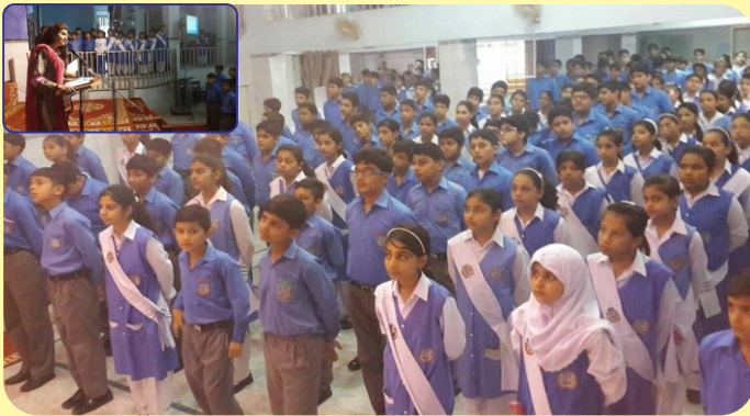
St. Anthonys High School

Cancer awareness lectures, seminars & fund raising campaigns at schools colleges and universities.