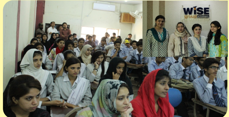
Wise Group of Colleges