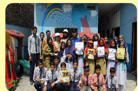
English Grammar School