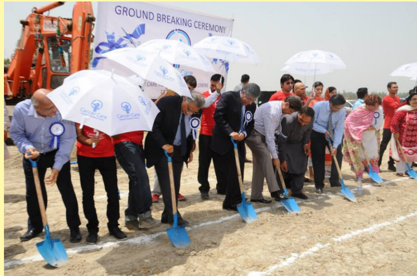
Moment of Ground Breaking