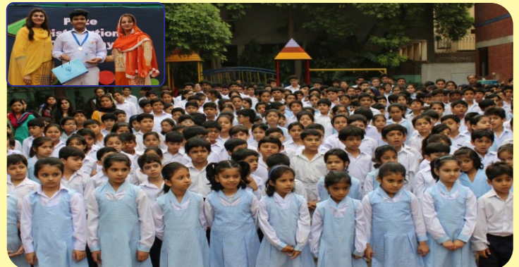
Bloomfield Hall School