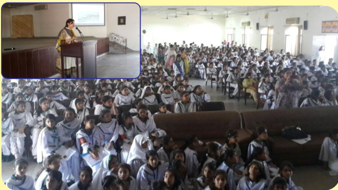
Army Public School (Azam Garrison)