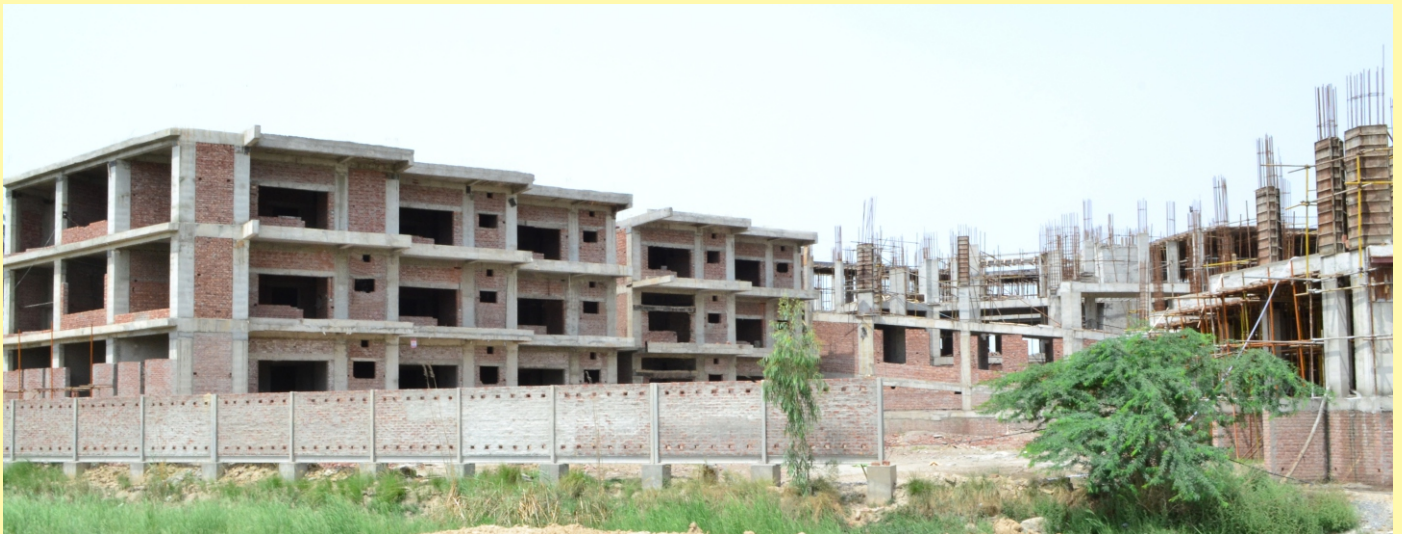
One wing of U-Shaped Institute of Palliative Care (IPC), each room has 26' feet long floral balcony: July 2016