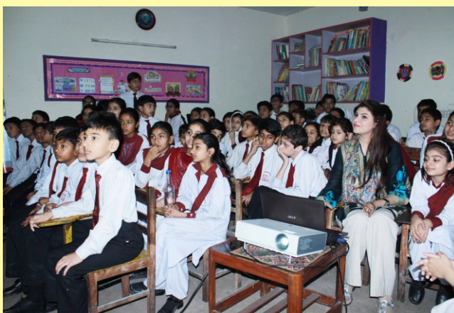
Cancer awareness lecture to The Leeds Grammer School students