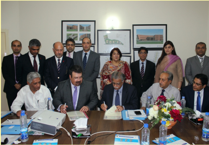
MOU signing ceremony between Cancer Care Hospital & Bank Alfalah.