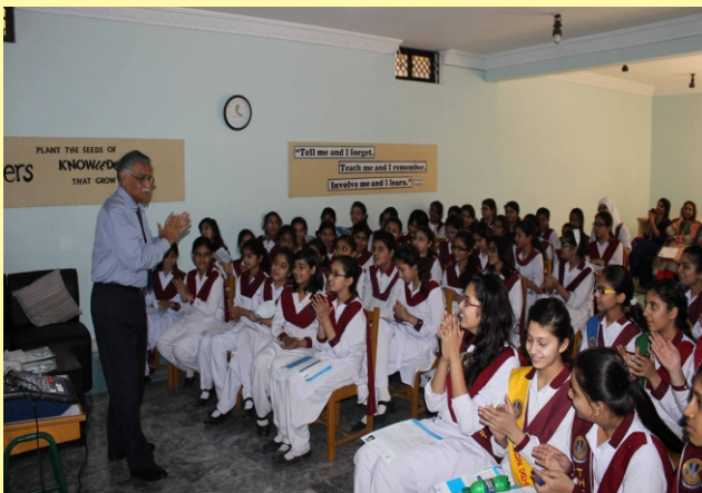
“Healthy Life Style” Talk to The City School students, Lahore