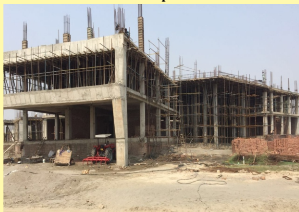
Construction of Pediatric Palliative Unit