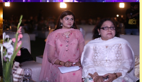
Live Performance of Rahat Fateh Ali Khan at Royal Palm Lahore, A Mega Fund Raising Musical Event Dinner in collaboration with ChenOne.

"It's not how much we give but how much love we put into giving." (Mother Teresa)