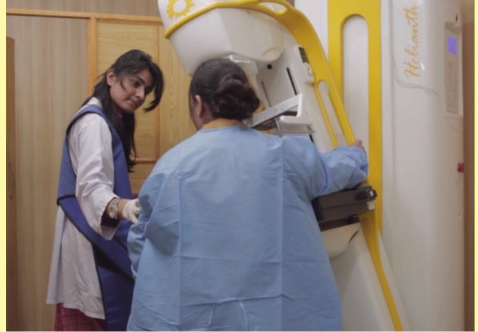
Qualified MIT Technologist