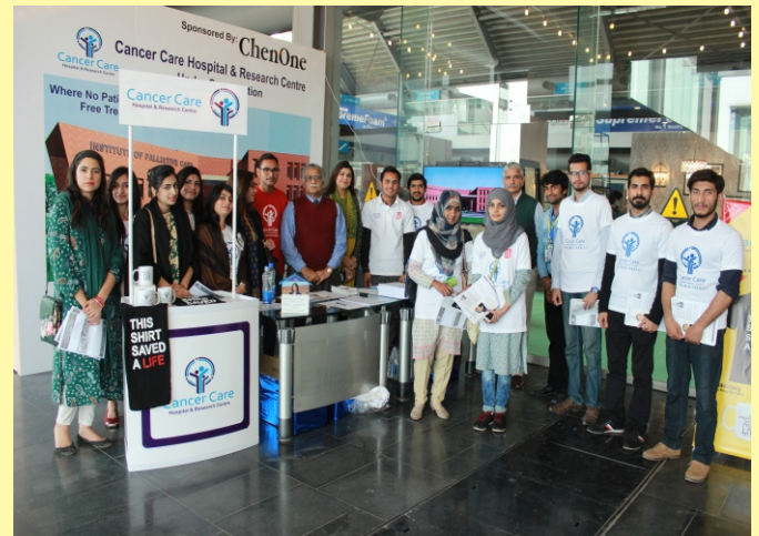
Cancer awareness & Fund raising kiosk at Lahore Expo Centre 2016 PFC sponsored by ChenOne