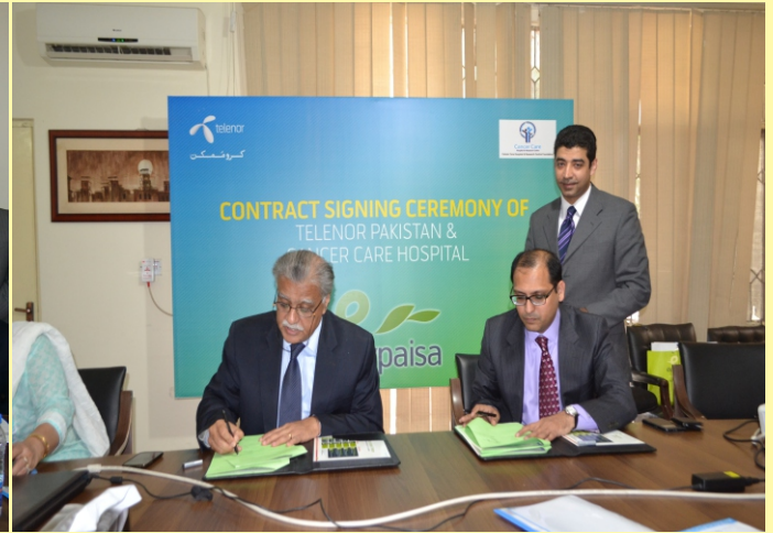
MOU signing ceremony between Cancer Care Hospital & Telenor Pakistan