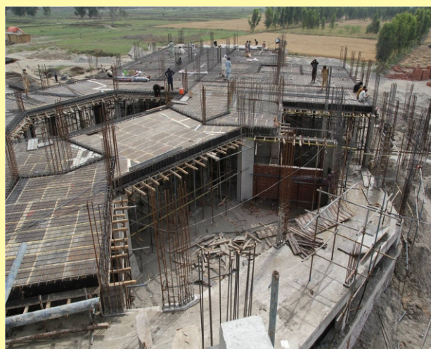
Construction of Reception Area of IPC

Every ‘Cent’ is vital for our project and is welcome. Your money will make all the difference. Please come forward and donate online at www.cch-rc.com and help us in alleviating this human suffering. Remember 280,000 patients remain without adequate treatment of cancer in Pakistan every year.