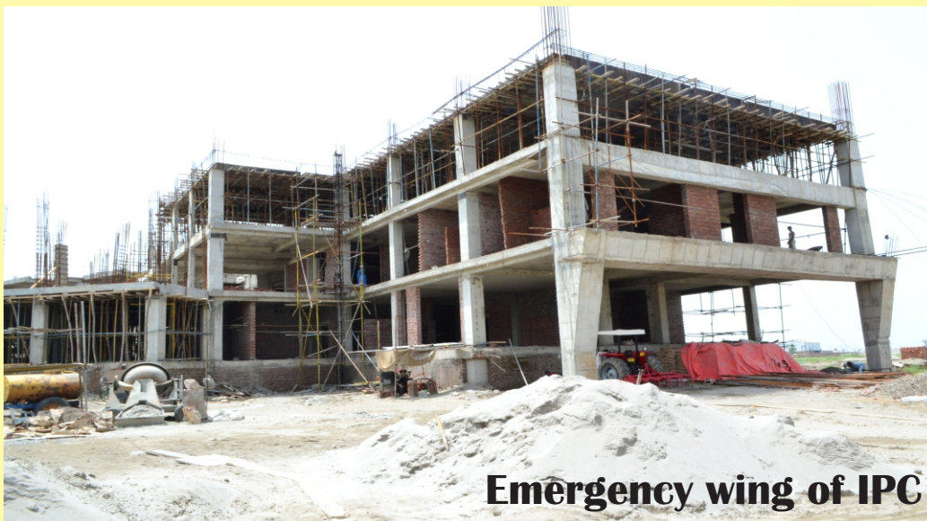
Emergency wing of IPC