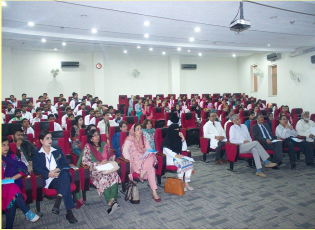
Symposium at Sharif Medical Dental & Nursing Hospital