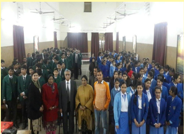
Cancer awareness lecture in The Cathedral School Campus.