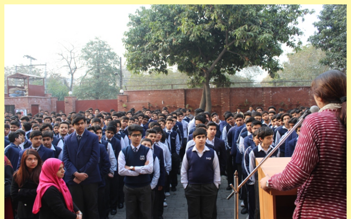
Cancer awareness lecture to The LGS Johar Town School students

“You are not just a drop in the ocean. You are the mighty ocean in the drop.” (Rumi)