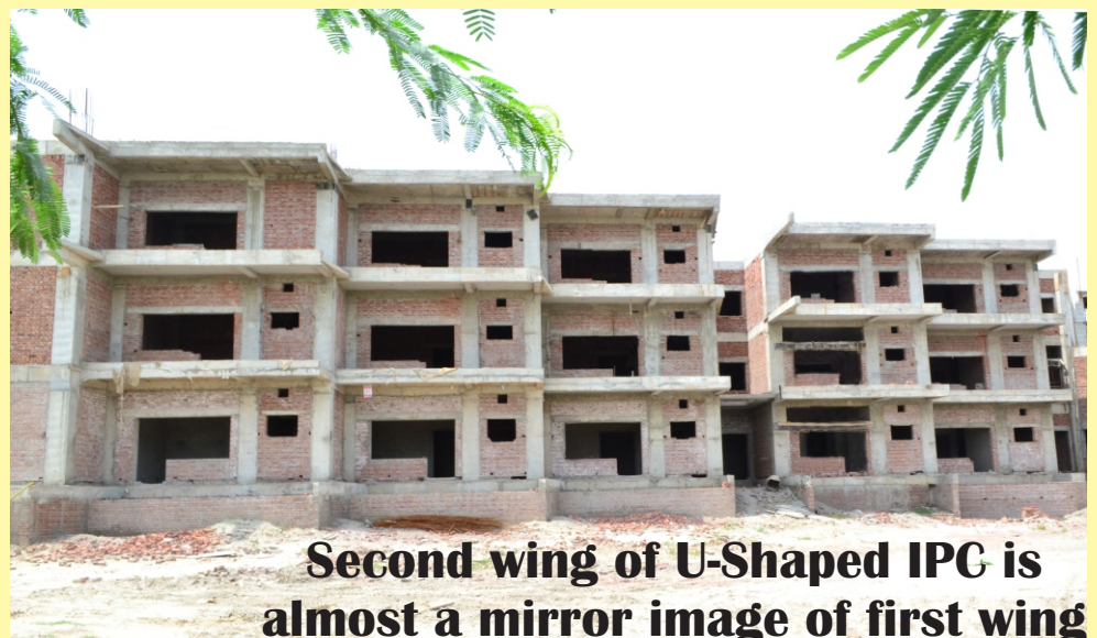
Second wing of U-Shaped IPC is almost a mirror image of first wing