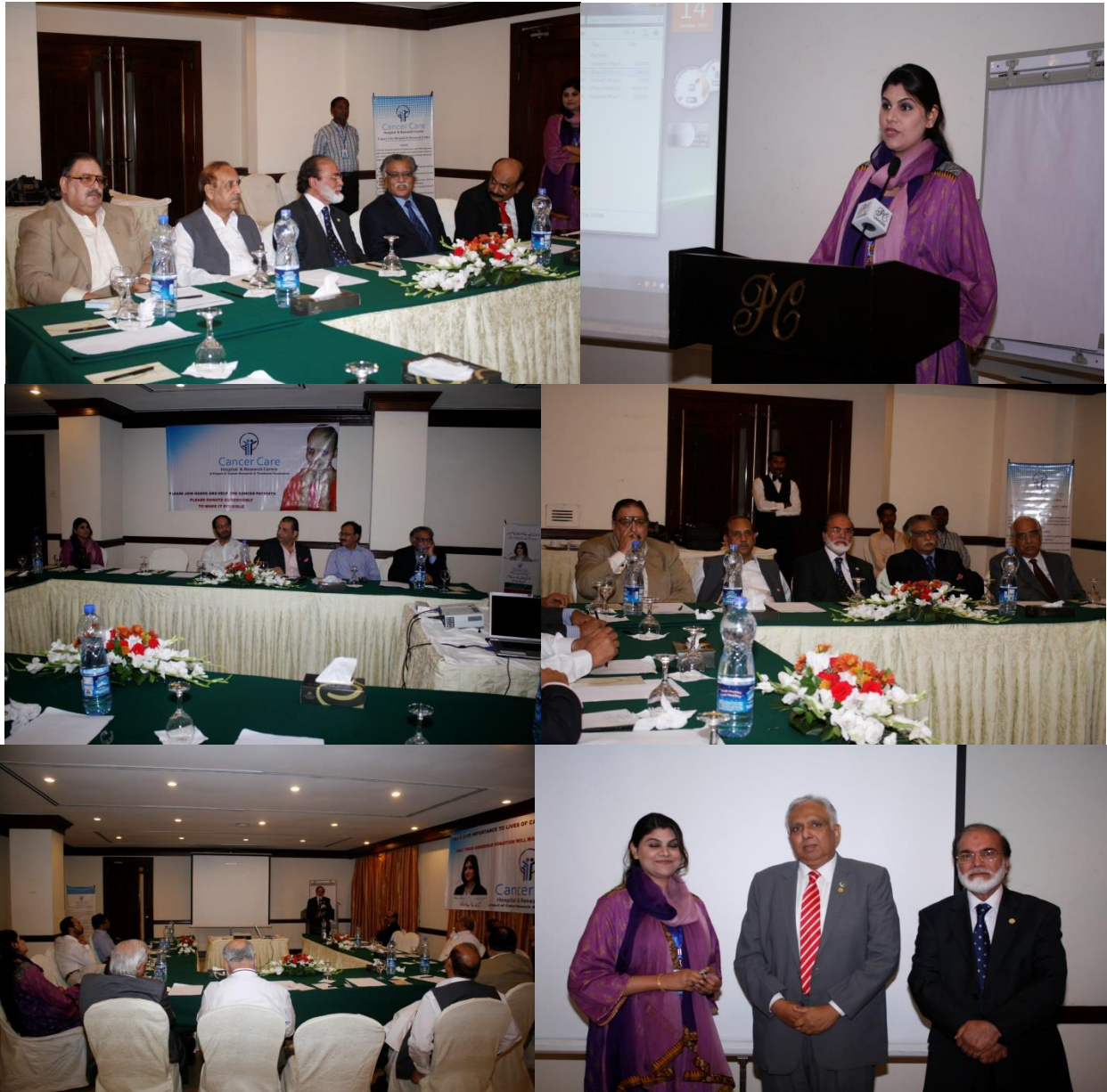
Meeting with Lions Club International at Pearl Continental Hotel, Lahore.