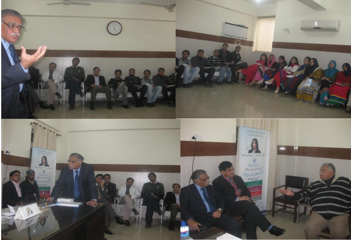
Lecture on Palliative care in Services institute of medical Sciences, Lahore.