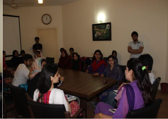
Meeting with Volunteers of Cancer Care Society.