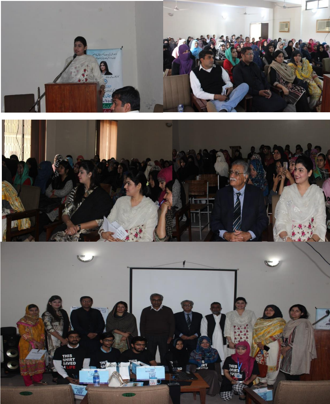
Prevention and Control of Cancer Awareness Campaign at Government Muhammad Ali Oriental College.