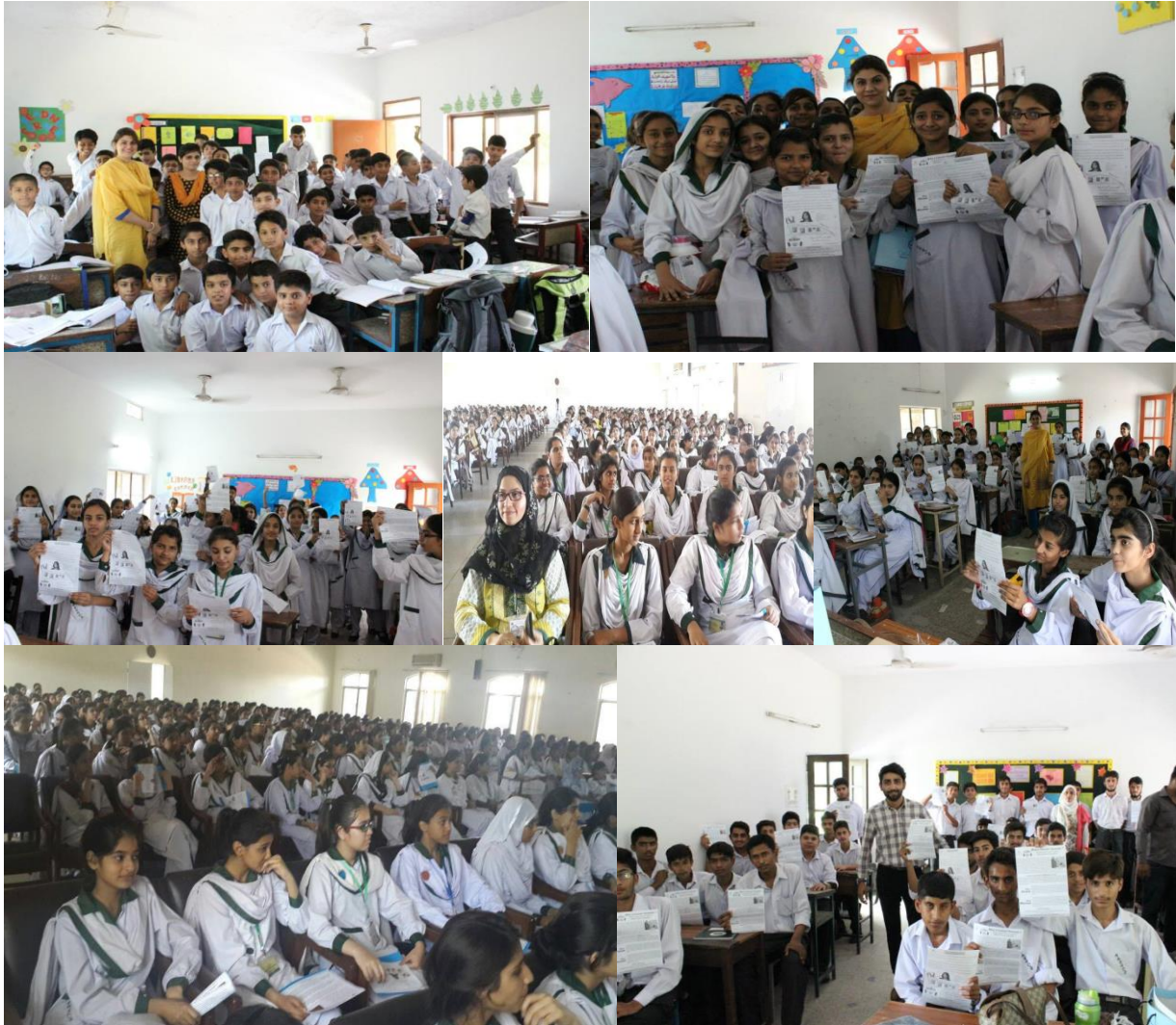
Prevention and Control of Cancer Awareness Campaign at Army Public School, Lahore.