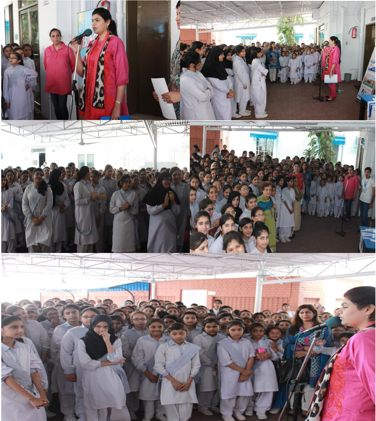
LGS shah Jamal Branch Prevention and Control of Cancer Awareness Campaign of Cancer Care Hospital & Research Center regarding Radiation Block and Mammography Awareness.