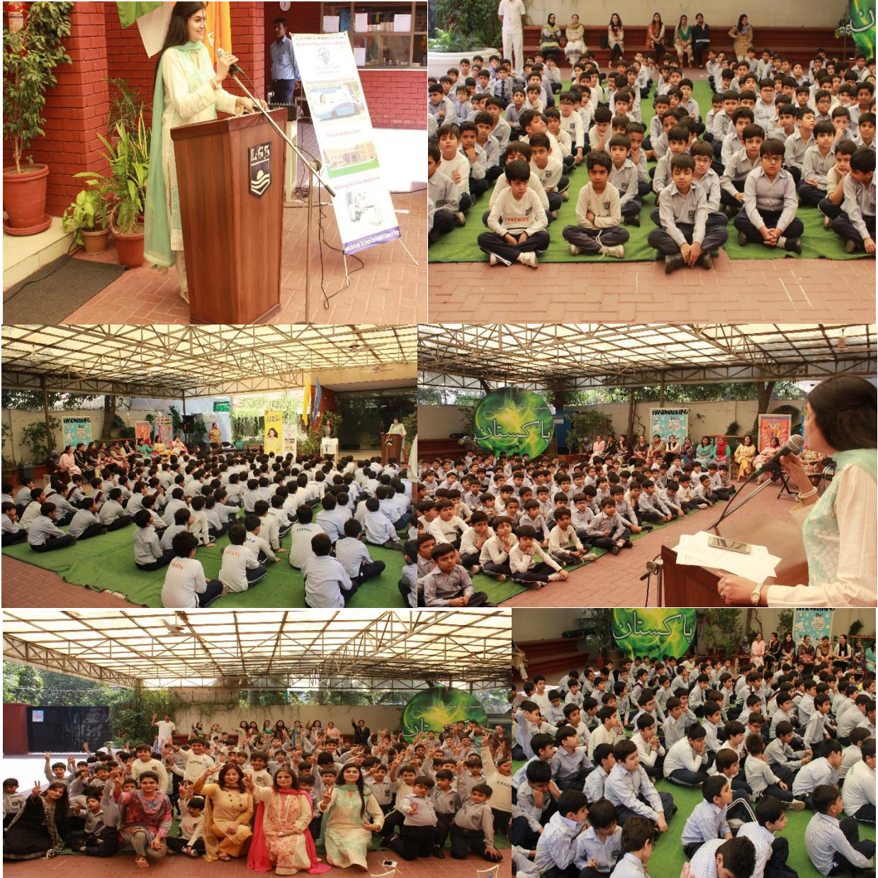
LGS 18-K Model Town Branch Prevention and Control of Cancer Awareness Campaign of Cancer Care Hospital & Research Center regarding Radiation Block and Mammography Awareness.