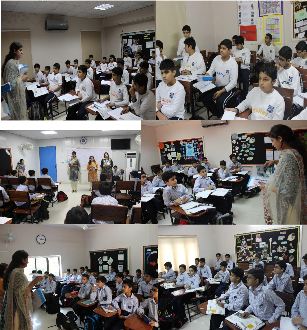
Prevention and Control of Cancer Awareness Campaign of Cancer Care Hospital & Research Centre regarding Radiation Block and Mammography Awareness.