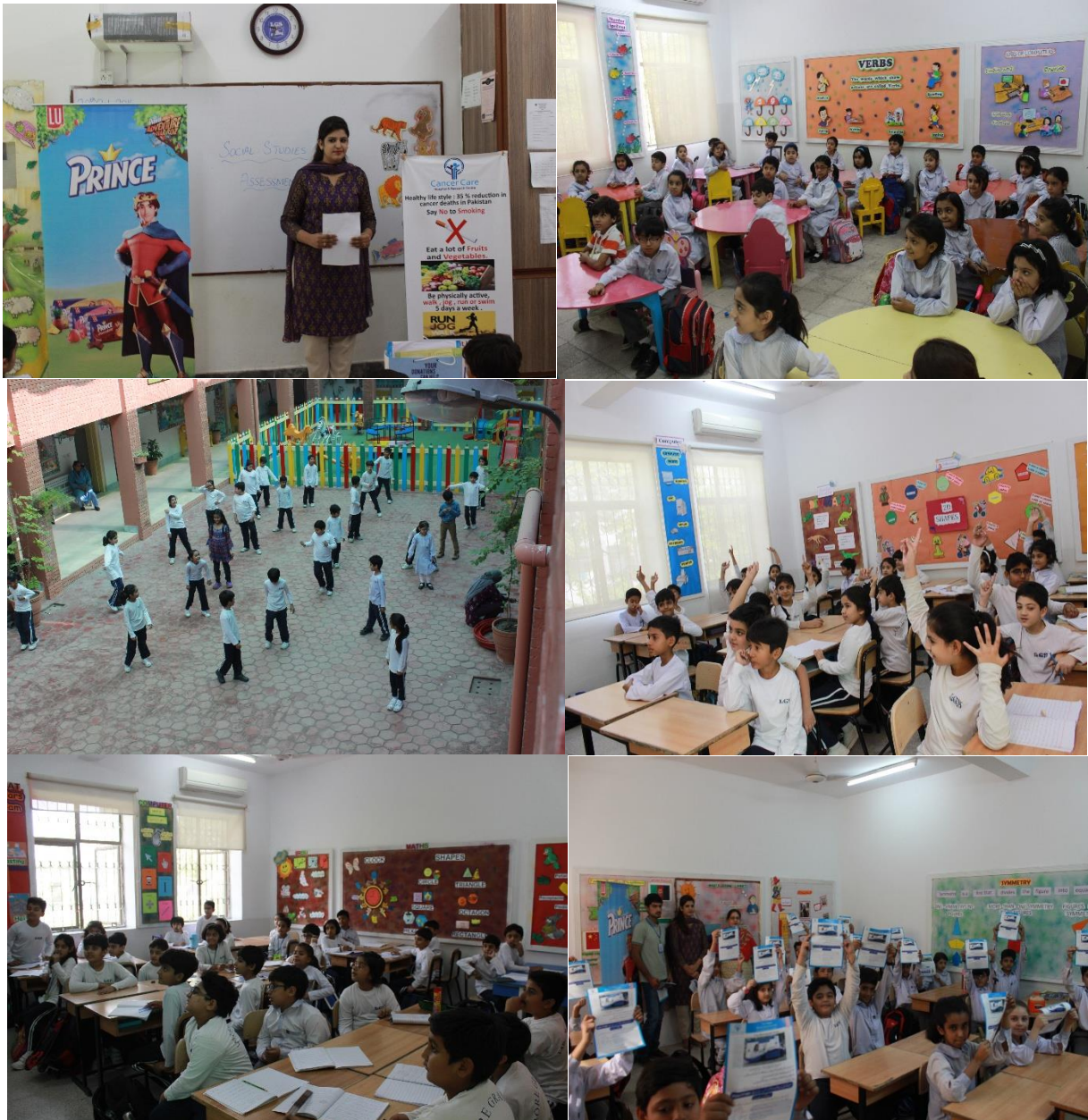
LGS Landmark Faisal Town Branch Class Room Prevention and Control of Cancer Awareness Campaign of Cancer Care Hospital & Research Center regarding Radiation Block and Mammography Awareness.