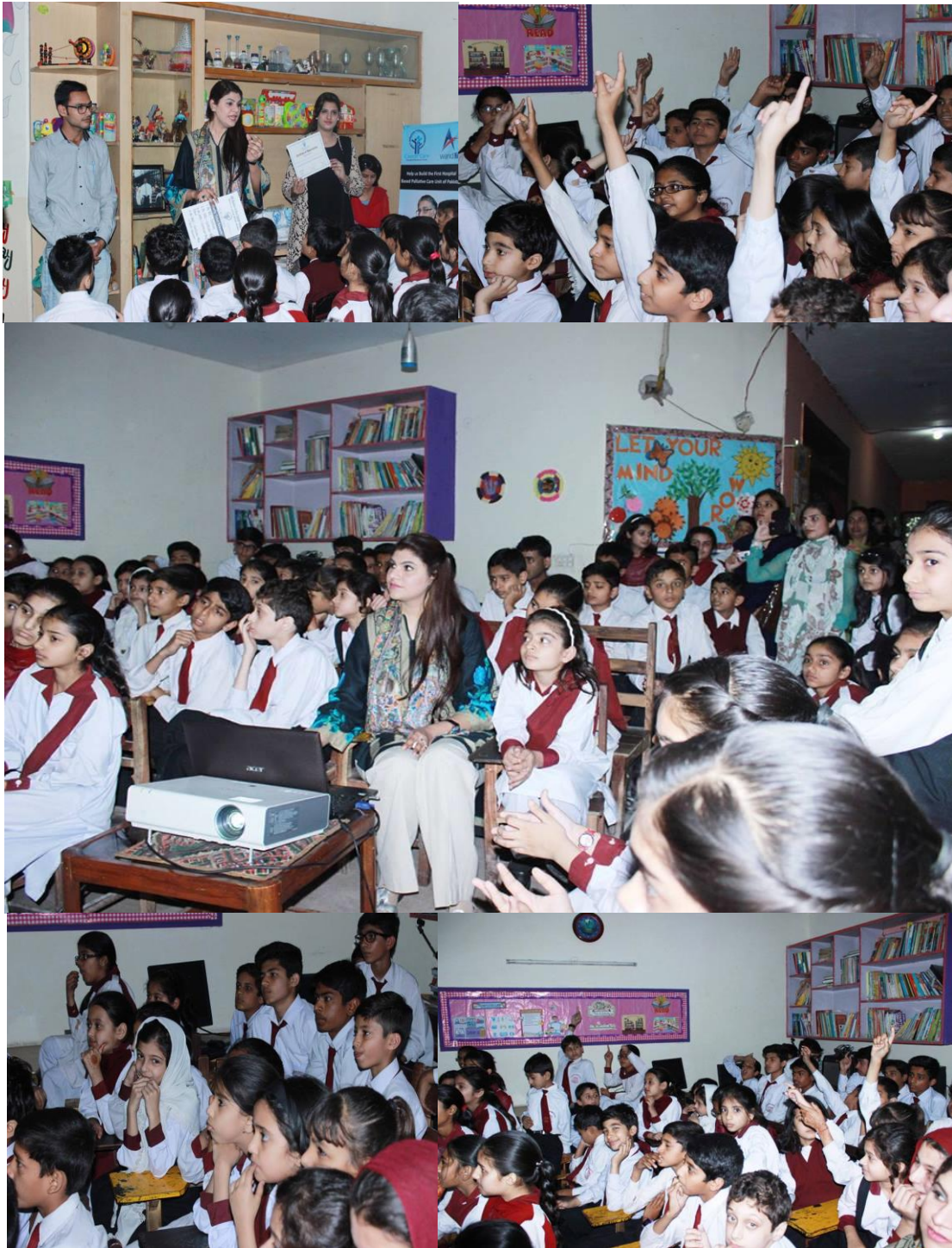
Prevention and Control of Cancer Awareness Campaign at Leader's Grammar School Johar Town, Lahore.