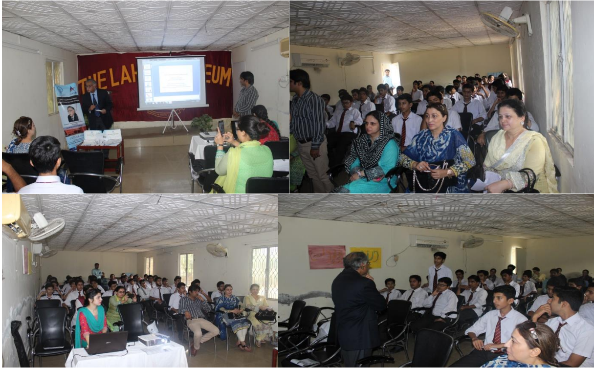
Prevention and Control of Cancer Awareness Campaign at Lahore Lyceum.