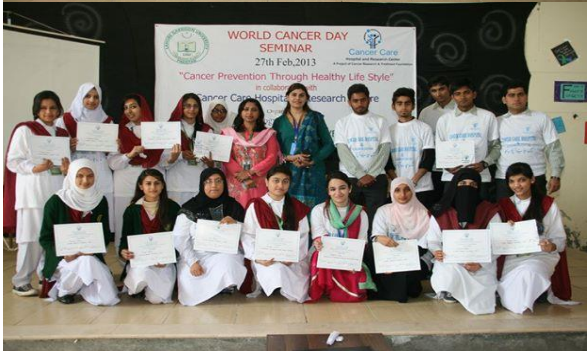
World Cancer Day - Cancer prevention through healthy life style at Garrison University, Lahore.