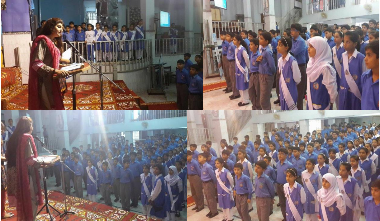
Prevention and Control of Cancer Awareness Campaign at Cathedral School, Lahore.