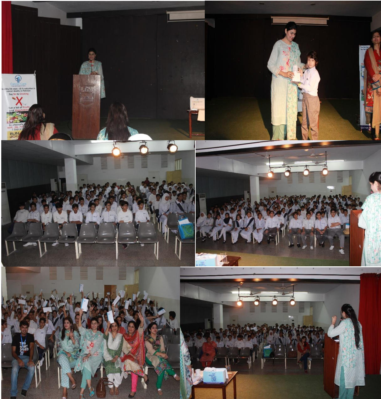
LGS DHA EME Branch Prevention and Control of Cancer Awareness Campaign of Cancer Care Hospital & Research Center regarding Radiation Block and Mammography Awareness.