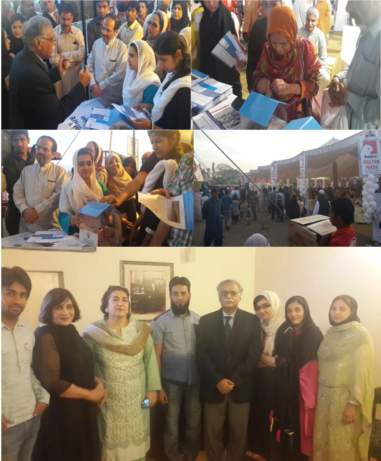
Prevention and Control of Cancer Awareness Stall at Race Course Park, Lahore.