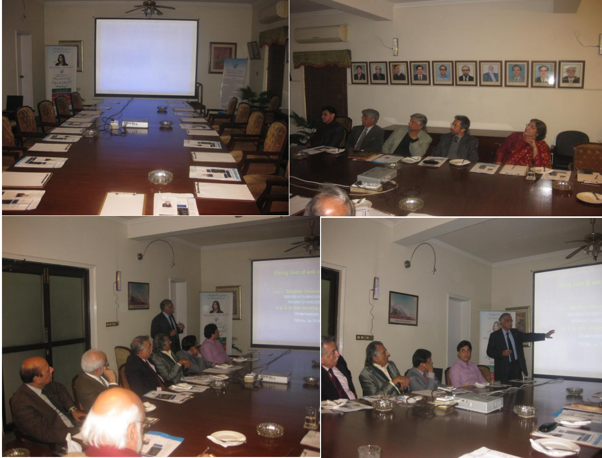
Prevention and Control of Cancer & Healthy Life Style Lecture at Gymkhana Club, Lahore.