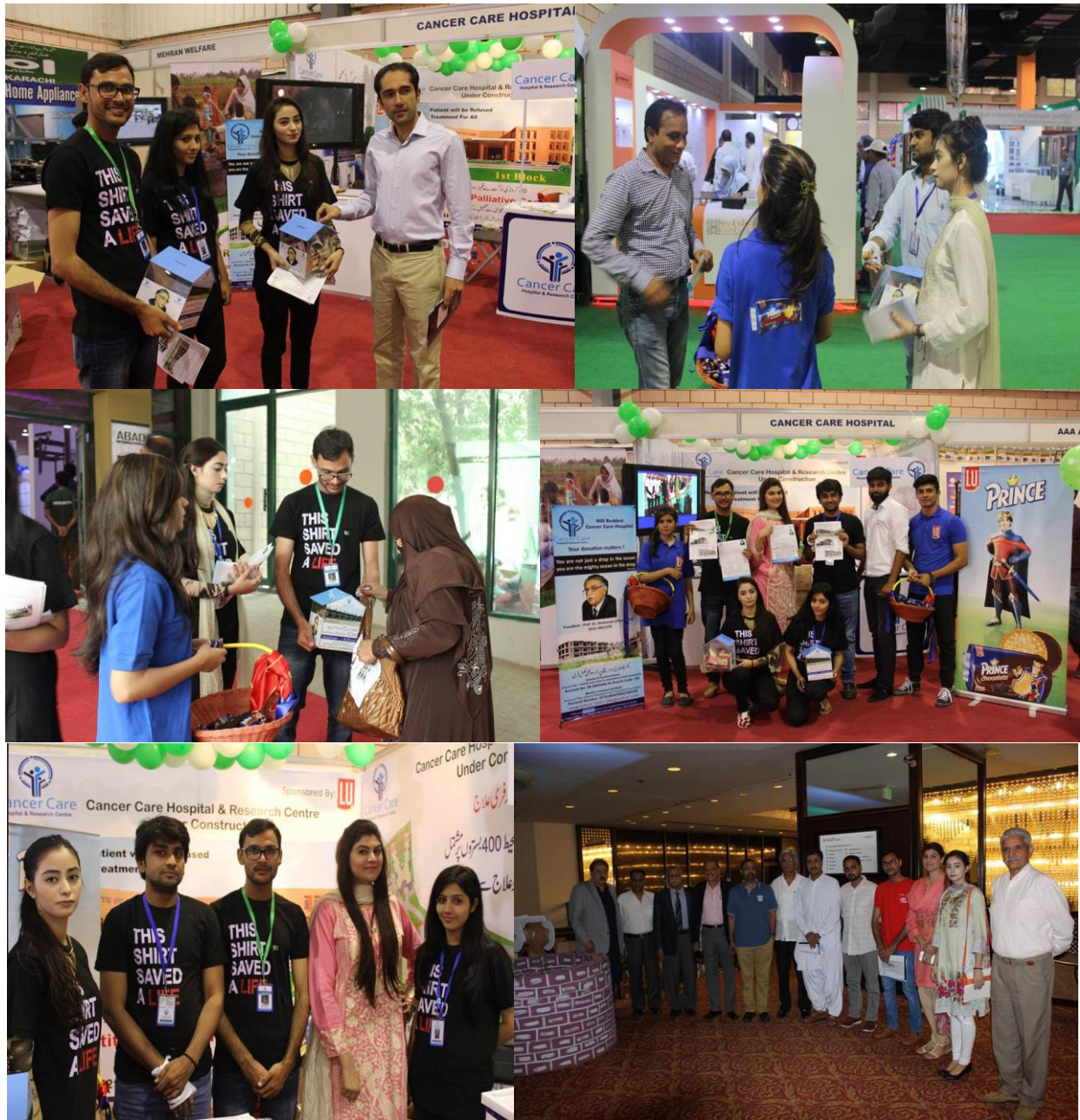
Cancer Care Hospital Team organized a seminar of Prevention and Control of Cancer Awareness Campaign at ABAD Expo International Karachi.