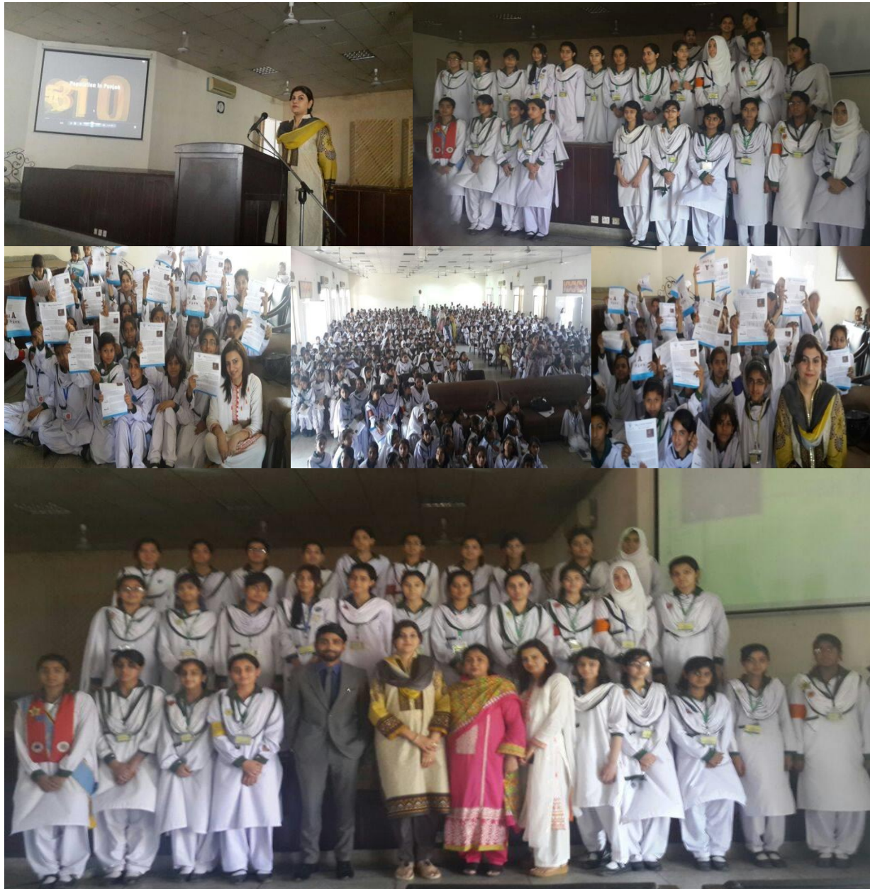
Prevention and Control of Cancer Awareness Campaign at Azam Garrison College.