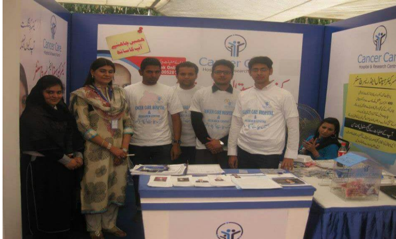
Prevention and Control of Cancer Campaign at Superior University Lahore.