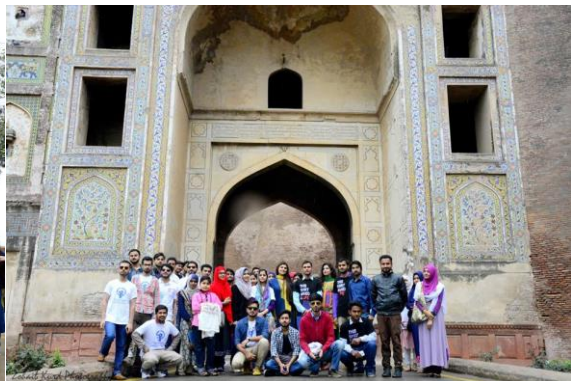
Cancer Care Hospital & Research Centre team visit to Sightseeing Double Decker Lahore.