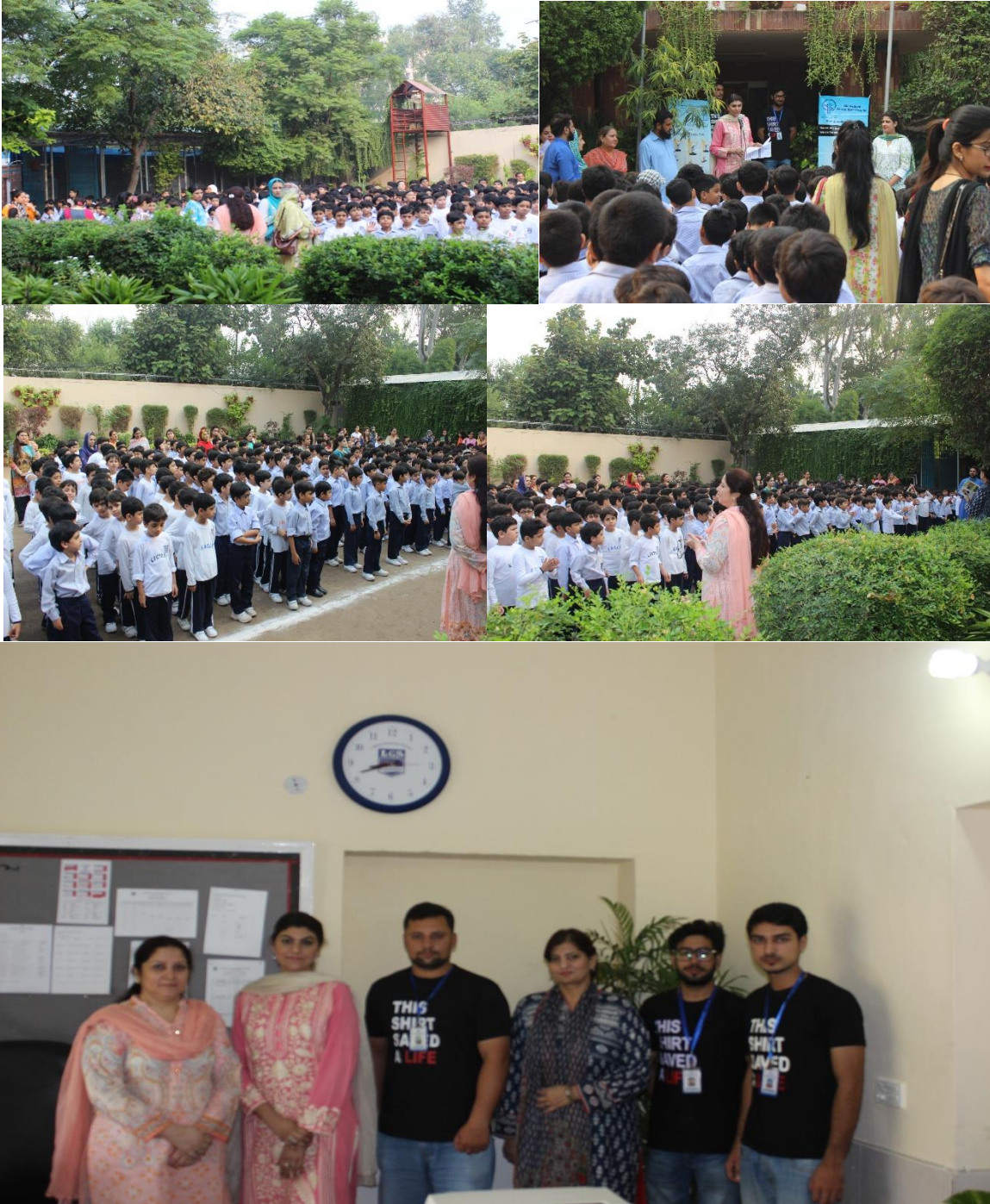
LGS 39 Main Gulberg Branch Prevention and Control of Cancer Awareness Campaign of Cancer Care Hospital & Research Center regarding Radiation Block and Mammography Awareness.