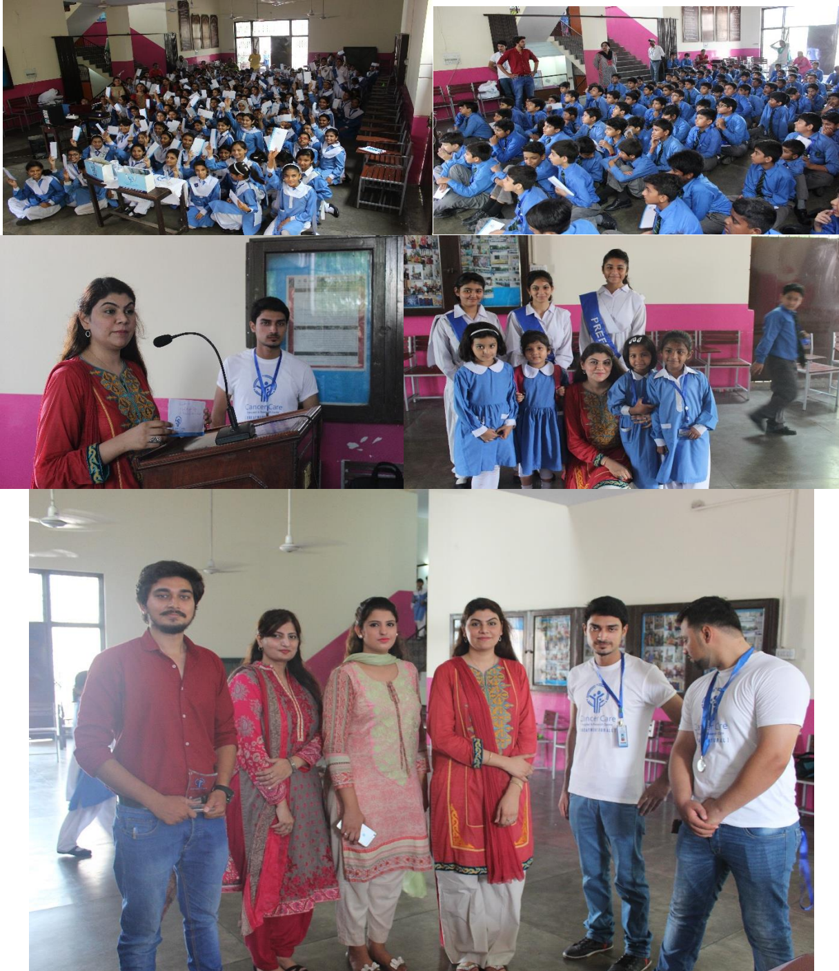
Cathedral School Model town Branch (Boys & Girls) Prevention and Control of Cancer Awareness Campaign of Cancer Care Hospital & Research Centre regarding Radiation Block and Mammography Awareness.