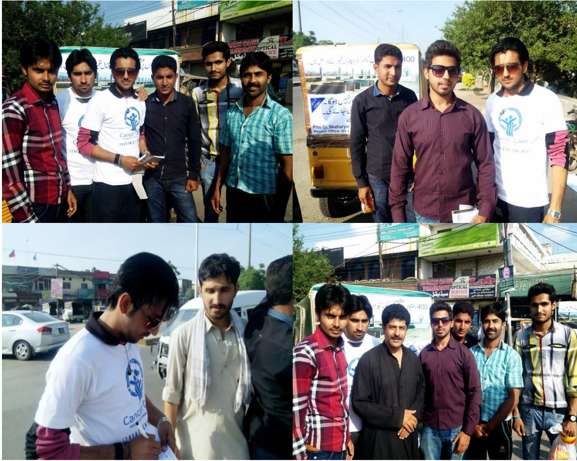
Prevention and Control of Cancer Awareness Rickshaw Campaign by Volunteers of Cancer Care Society.