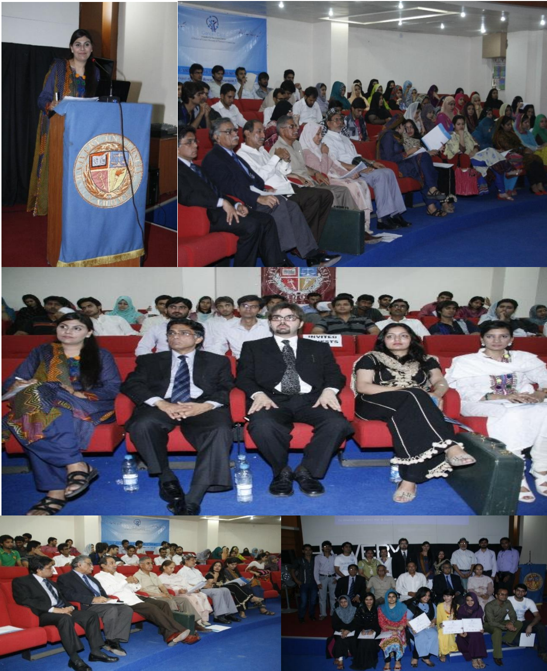
Prevention and Control of Cancer Campaign at Hajvery University, Lahore.