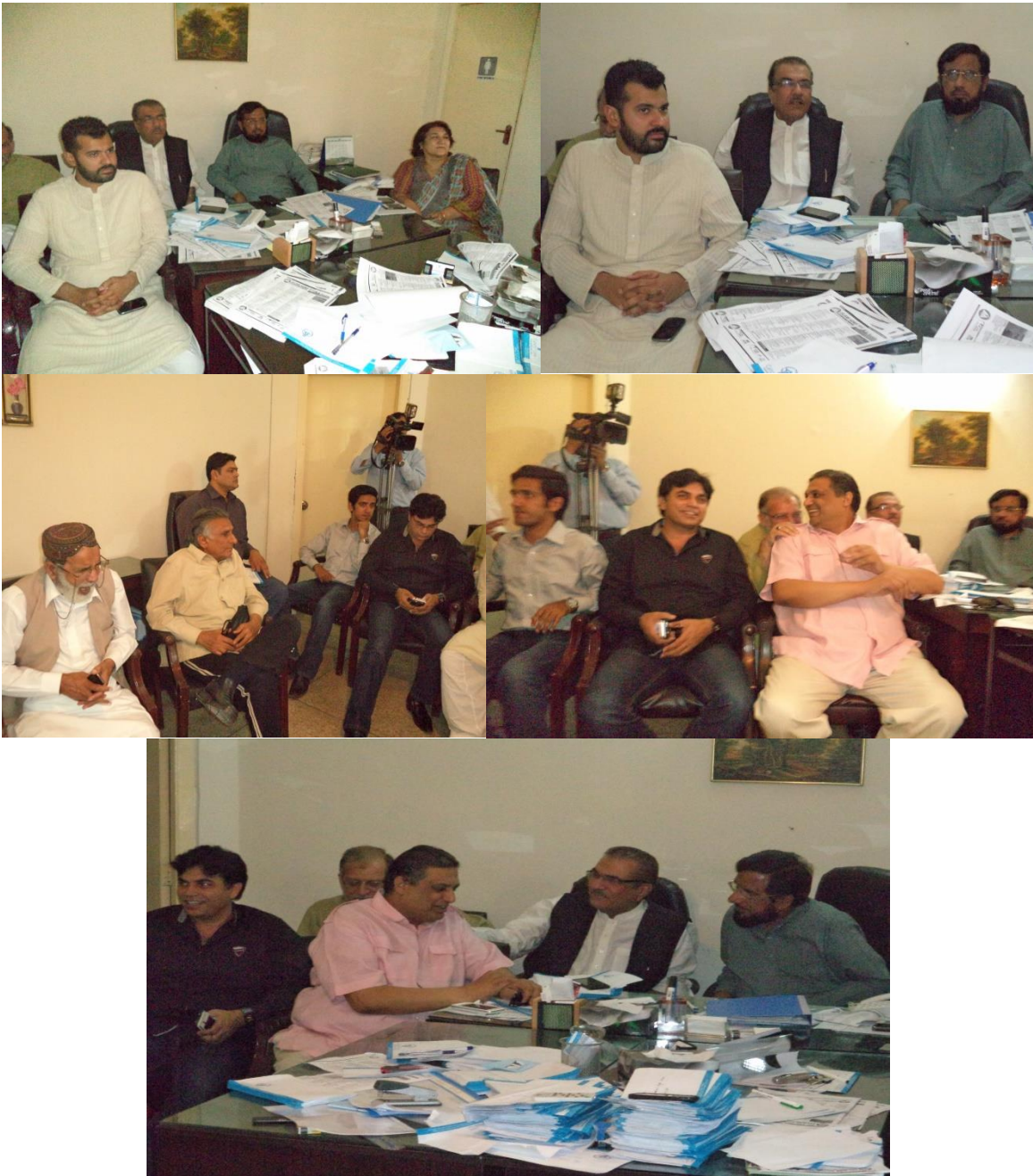
Prevention and Control of Cancer meeting with Journalist.