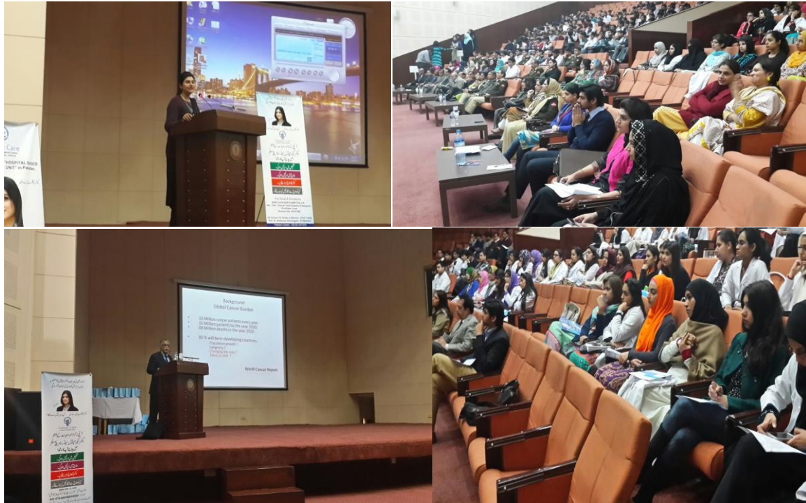
Prevention and Control of Cancer Campaign at Combined Military Hospital & Dental College, Lahore.