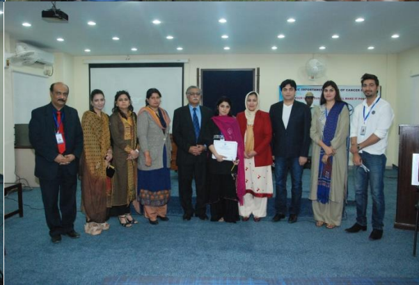
Prevention and Control of Cancer Campaign at Lahore College and Women University, Lahore.