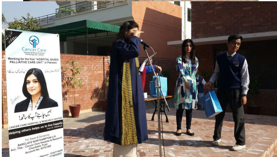
Prevention and Control of Cancer Awareness Lecture at LGS Gulberg Lahore.