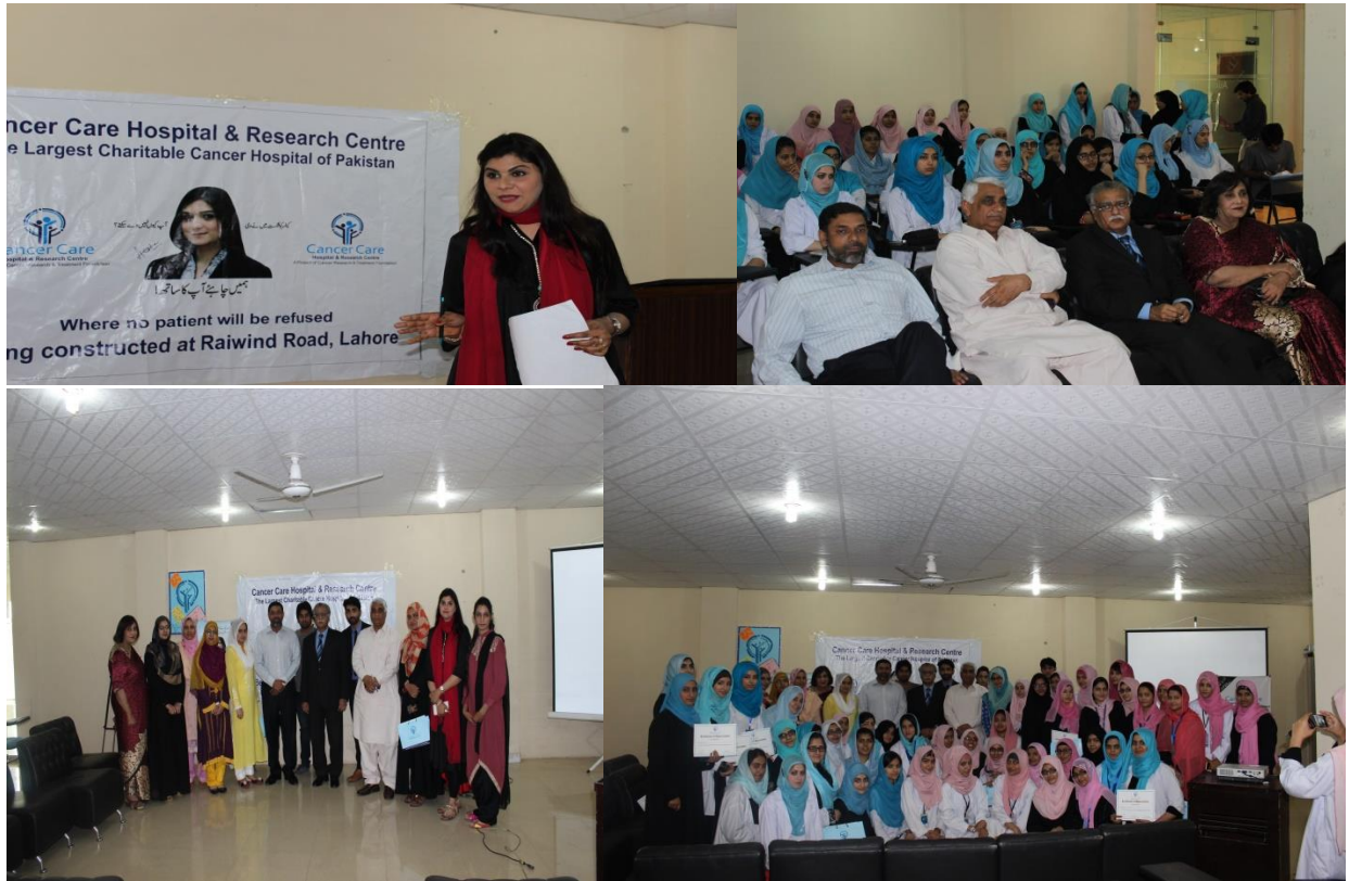
Breast Cancer awareness Campaign at Ripha International University, Lahore.