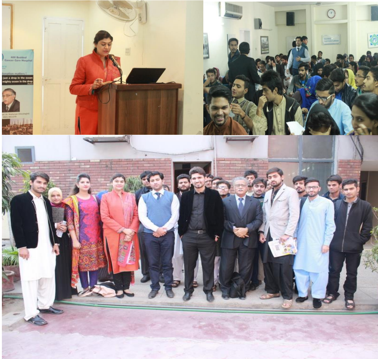
Prevention and Control of Cancer Awareness Campaign at Global Institute Lahore.