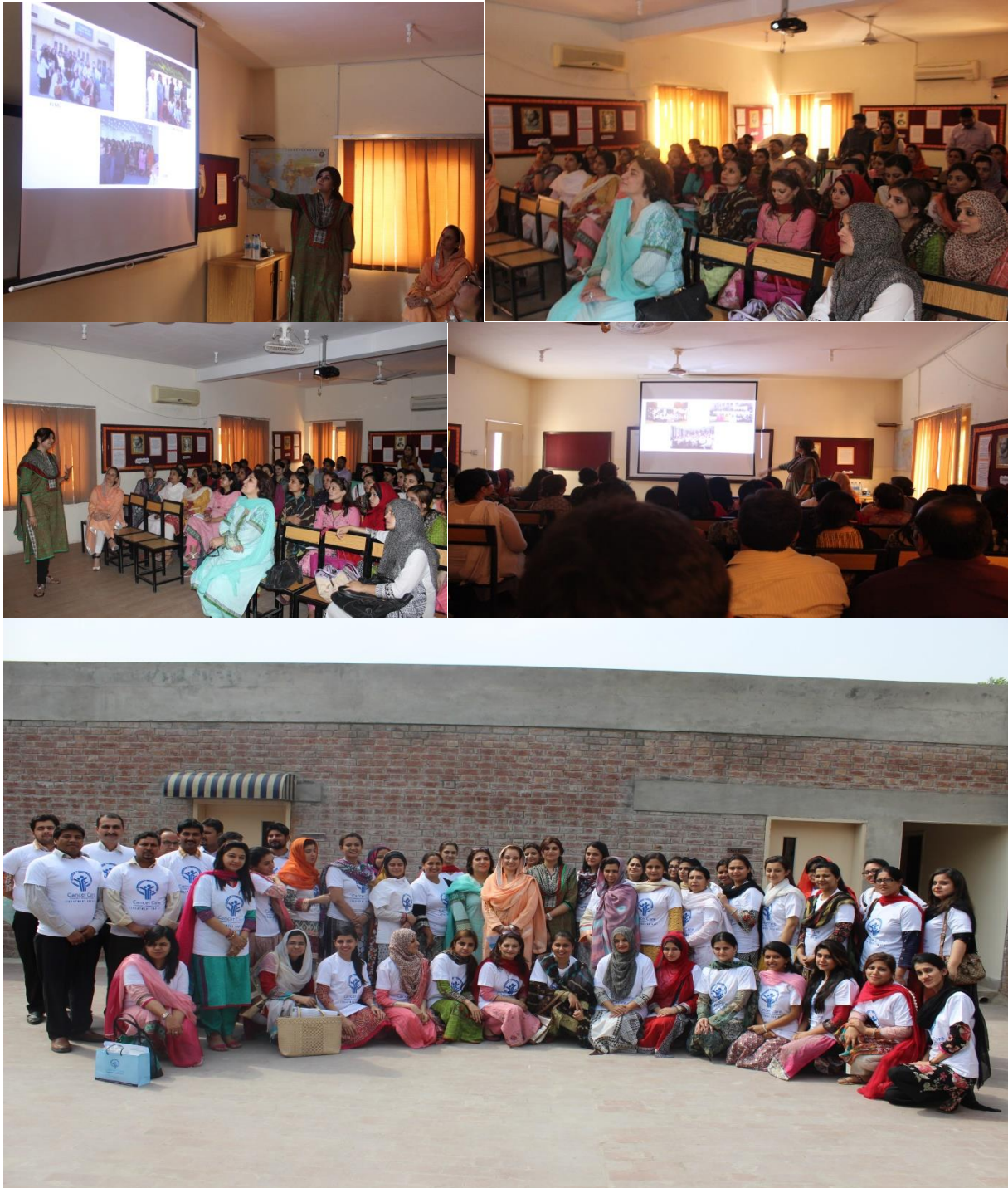
Breast Cancer Awareness Lecture at Bloomfield Hall School Faculty, Lahore.