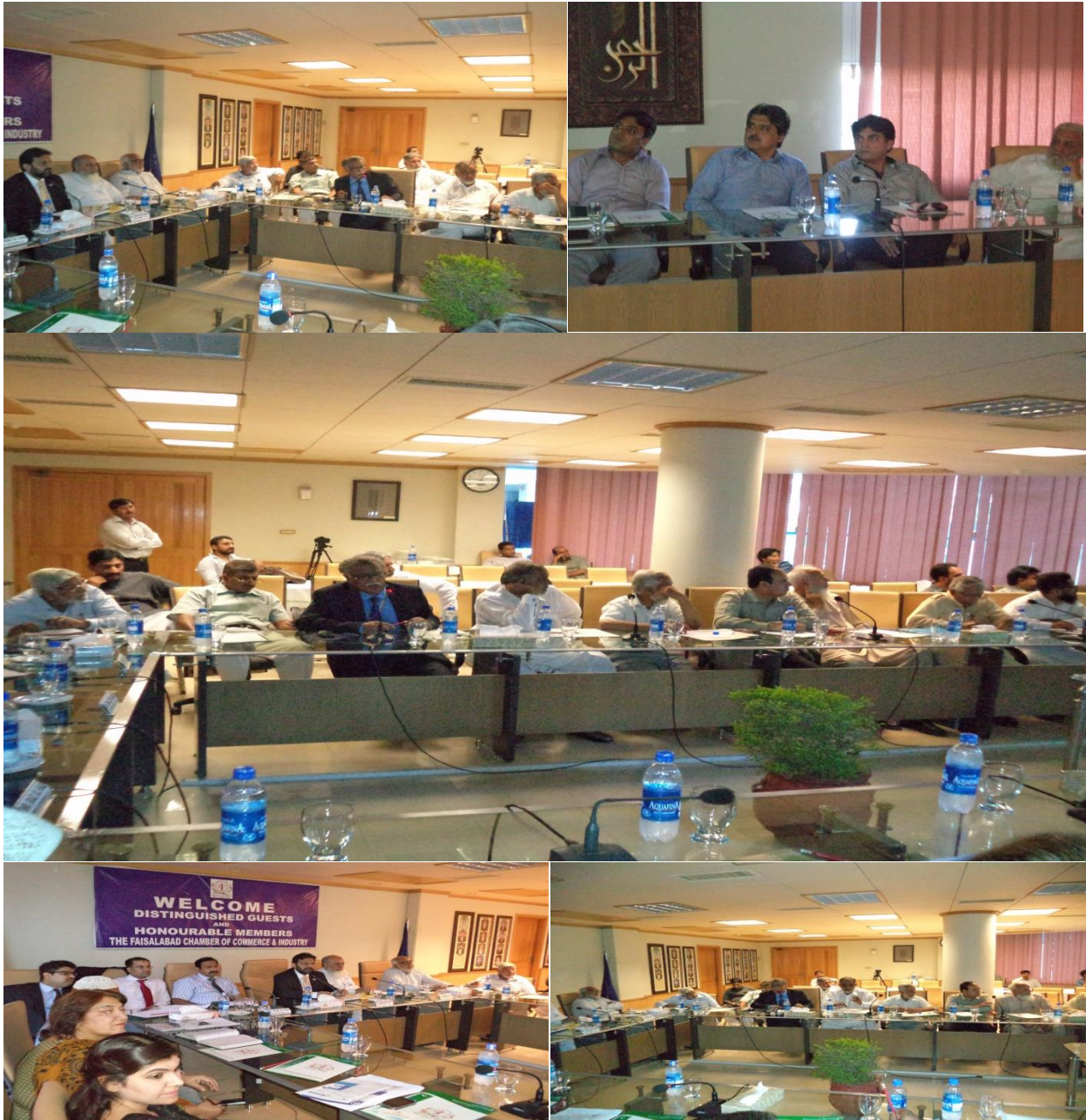
Prevention and Control of Cancer Campaign at Faisalabad Chamber of Commerce & Industry, Faisalabad.