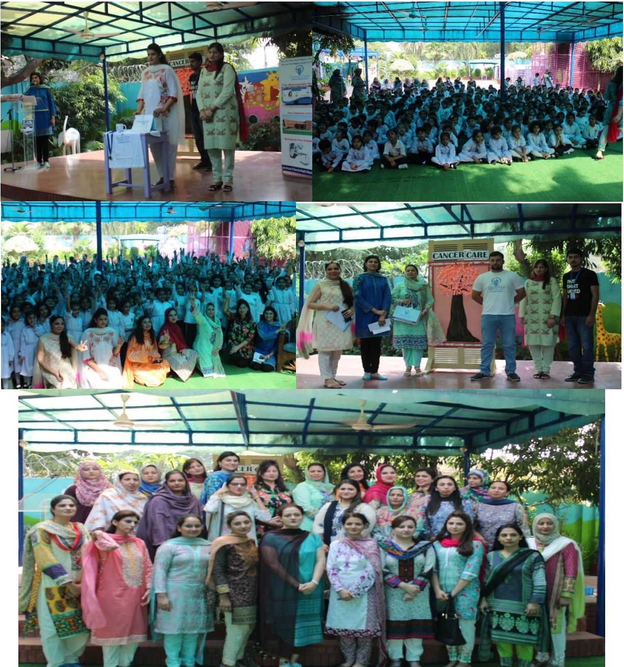
LGS 14-K Model Town Branch Prevention and Control of Cancer Awareness Campaign of Cancer Care Hospital & Research Center regarding Radiation Block and Mammography Awareness.