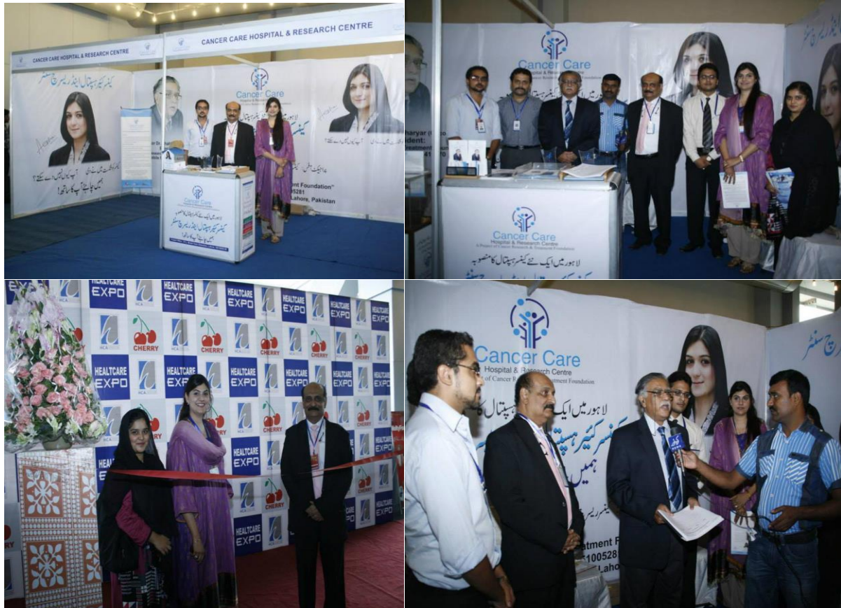
Breast Cancer Awareness Stall of Health Expo, Lahore.