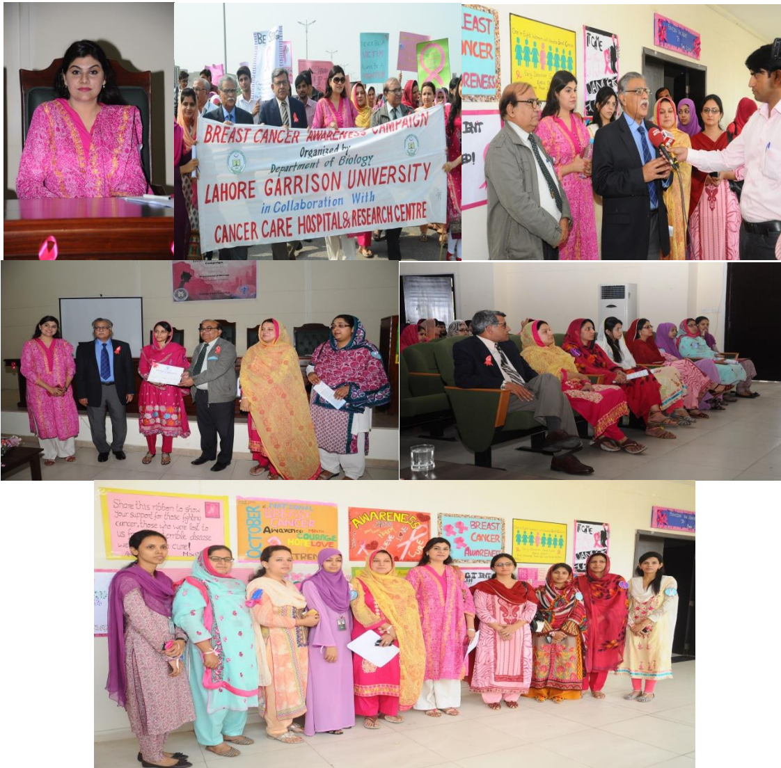
Breast Cancer Awareness Campaign and Poster Competition at Garrison University Lahore.