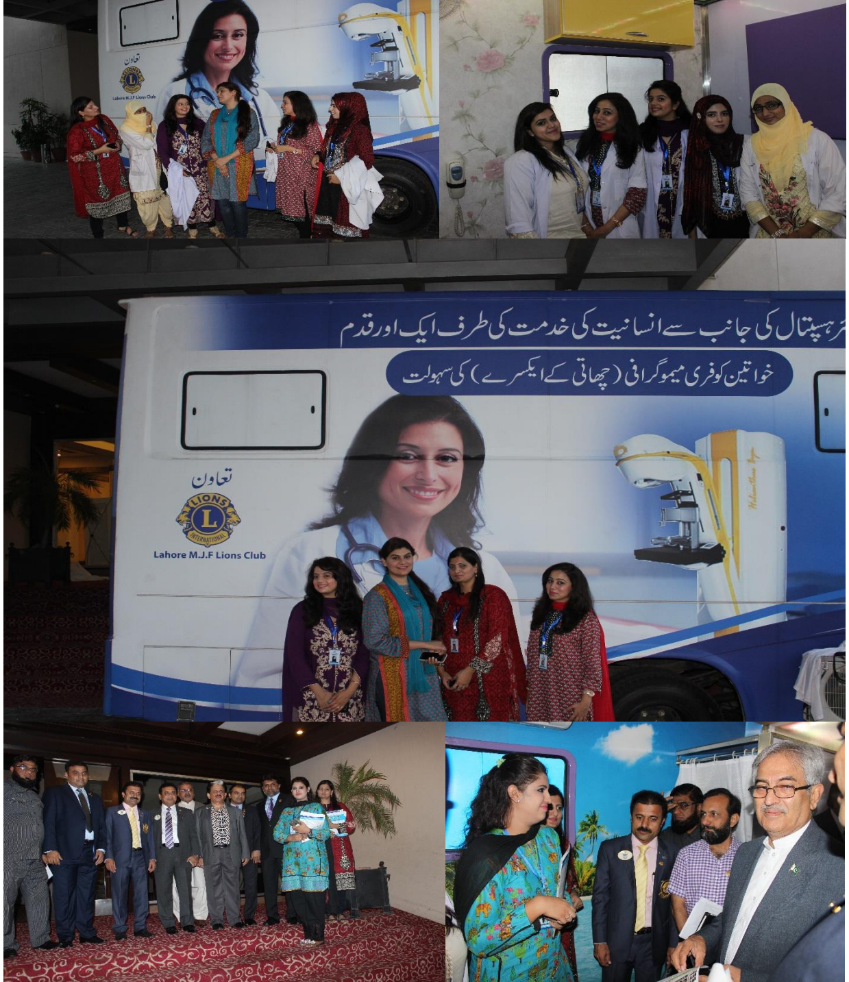
Mammography services at Royal Palm Club Lahore.