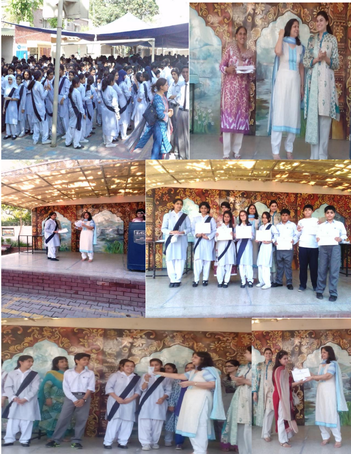
Prevention and Control of Cancer awareness lecture LGS RA Bazar Lahore.