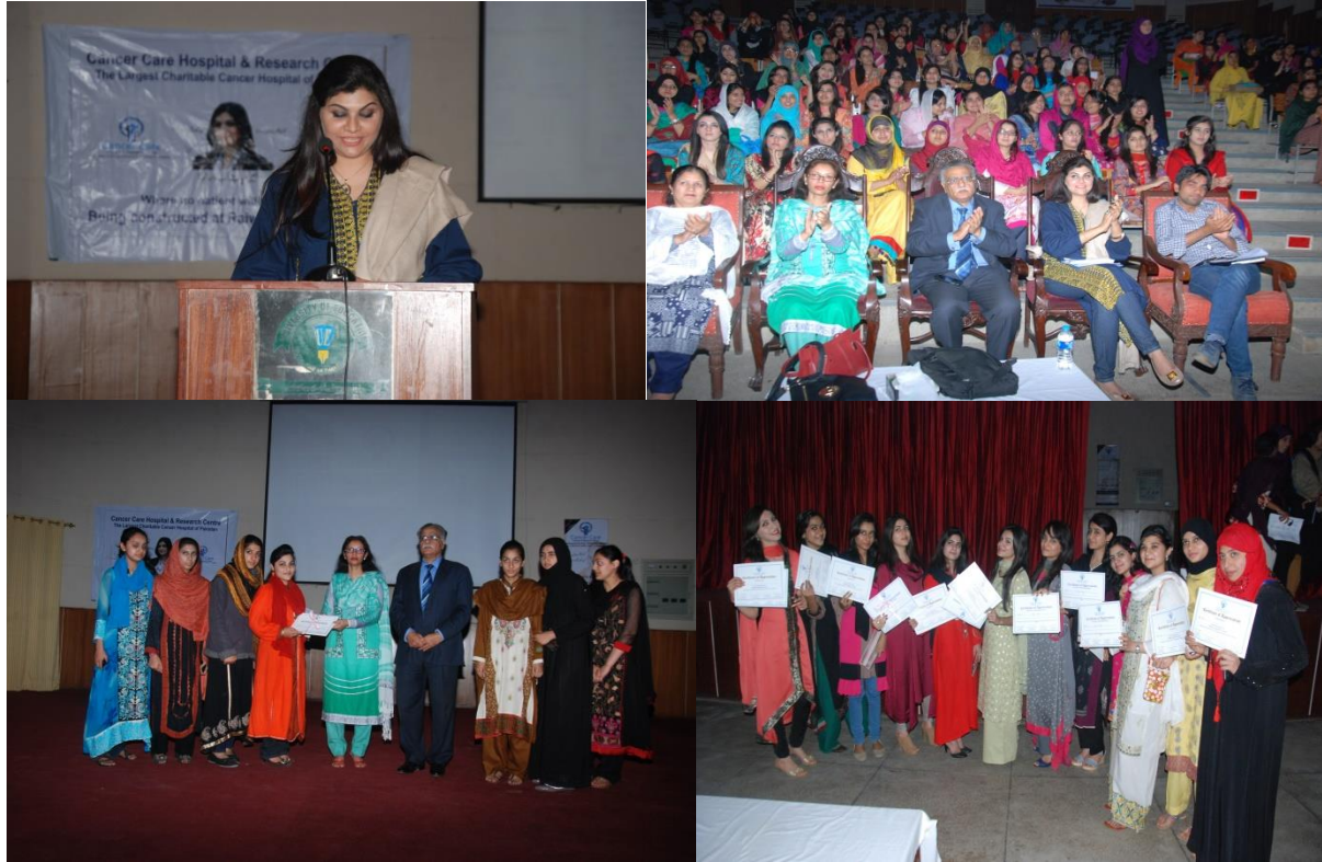
Breast Cancer Awareness Lecture University of Education Women Campus.