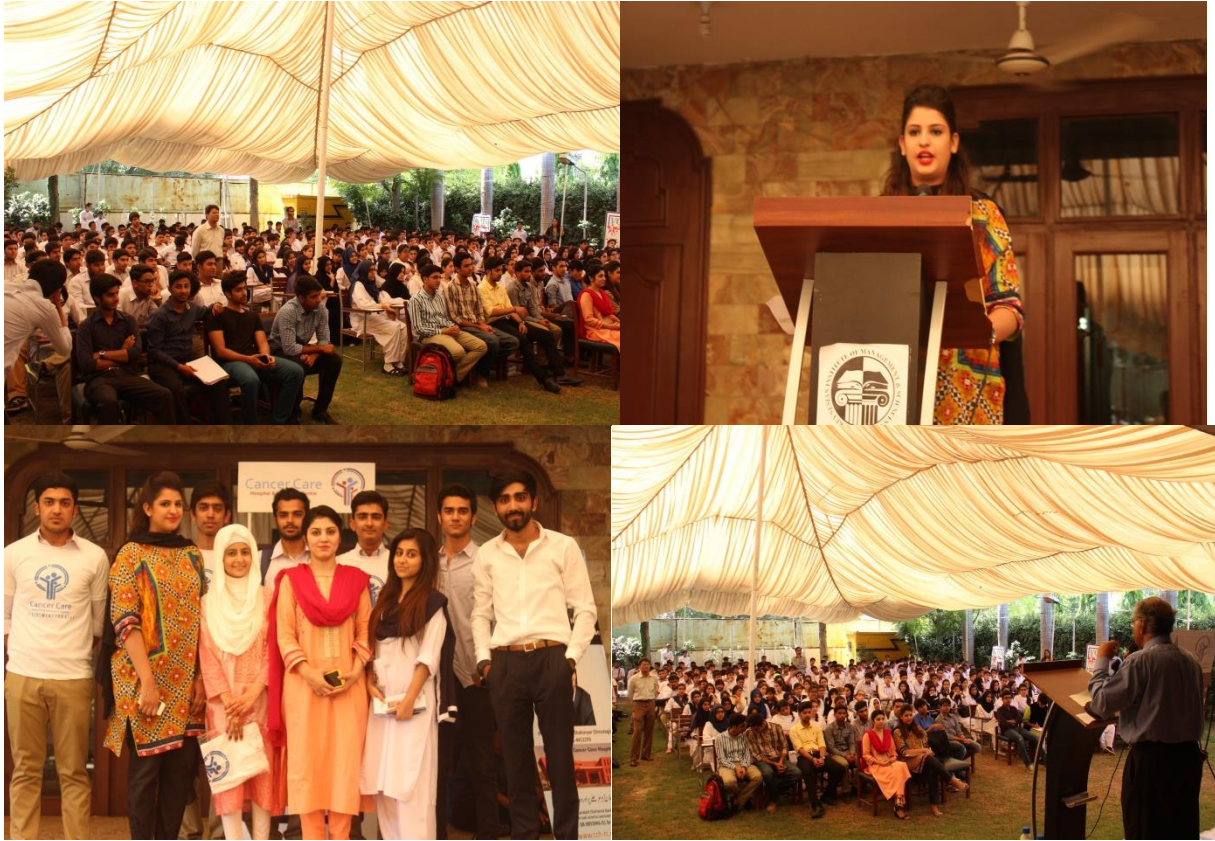
Prevention and Control of Cancer Awareness Campaign at KIMS.