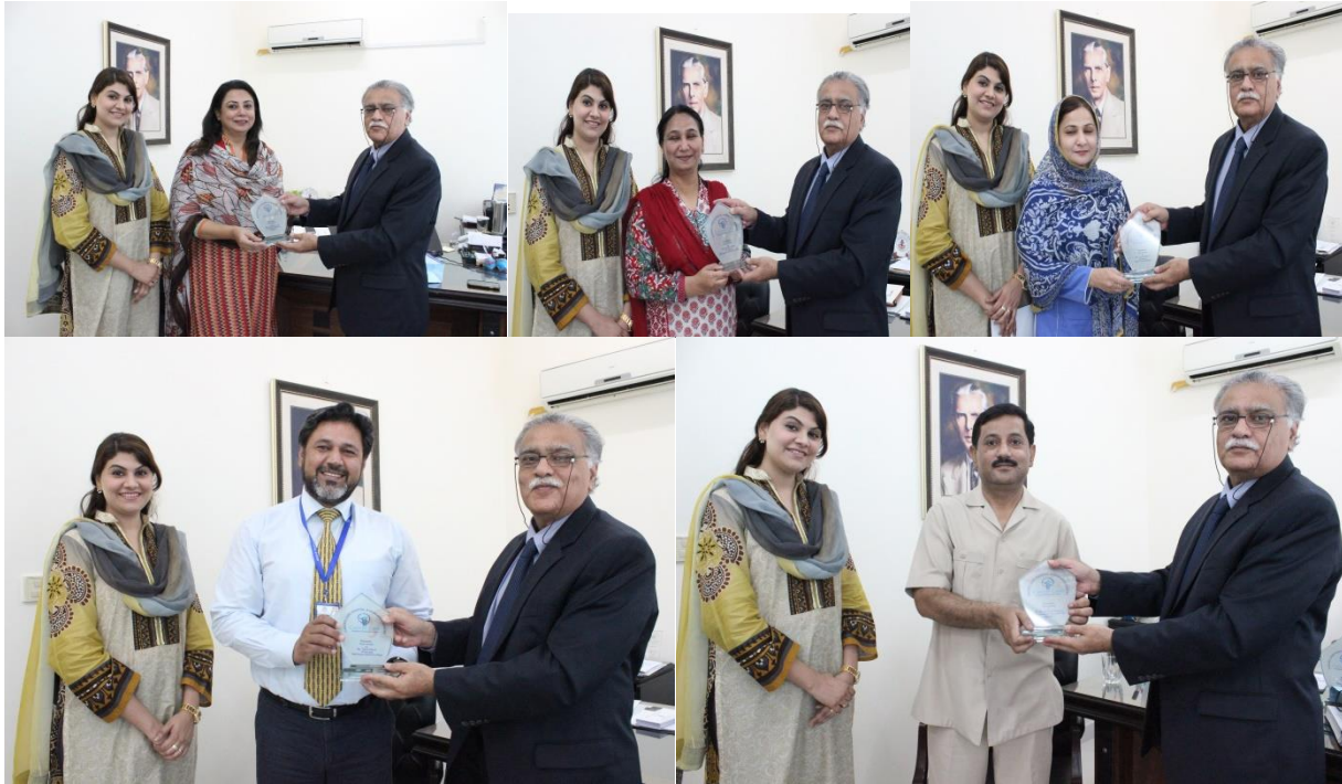
Prize Distribution Ceremony to all the Principals of Defence Housing Authority (DHA) Education Systems School.