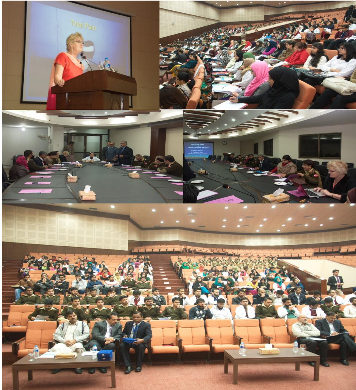
International Palliative care Workshop in Combined Military Hospital, Lahore.