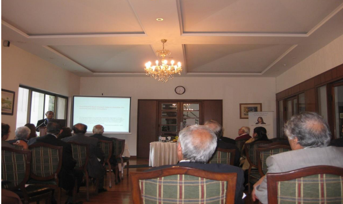
Prevention of Cancer and Healthy Life style Lecture in Punjab Club Lahore.