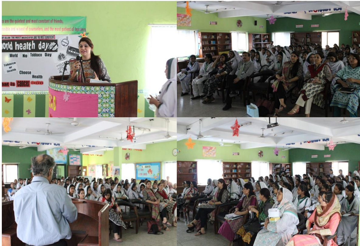
Prevention and Control of Cancer Awareness Campaign at Army Public School, Lahore.