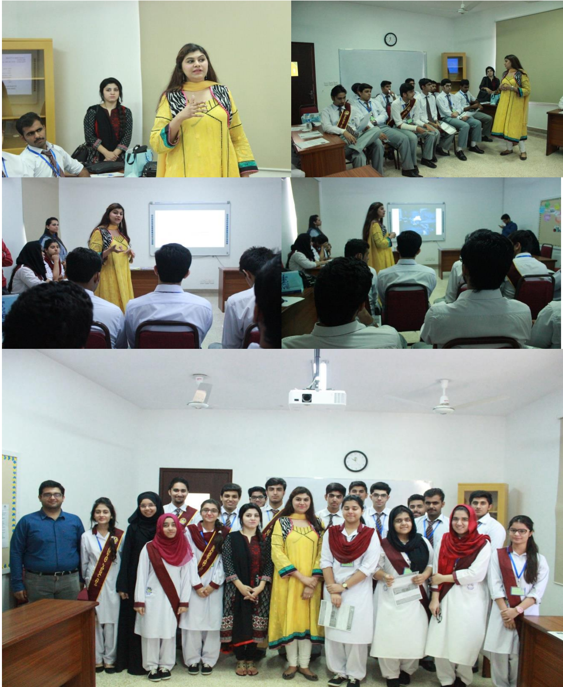
Prevention and Control of Cancer Awareness Campaign at The City School - Alpha DHA Campus Lahore.