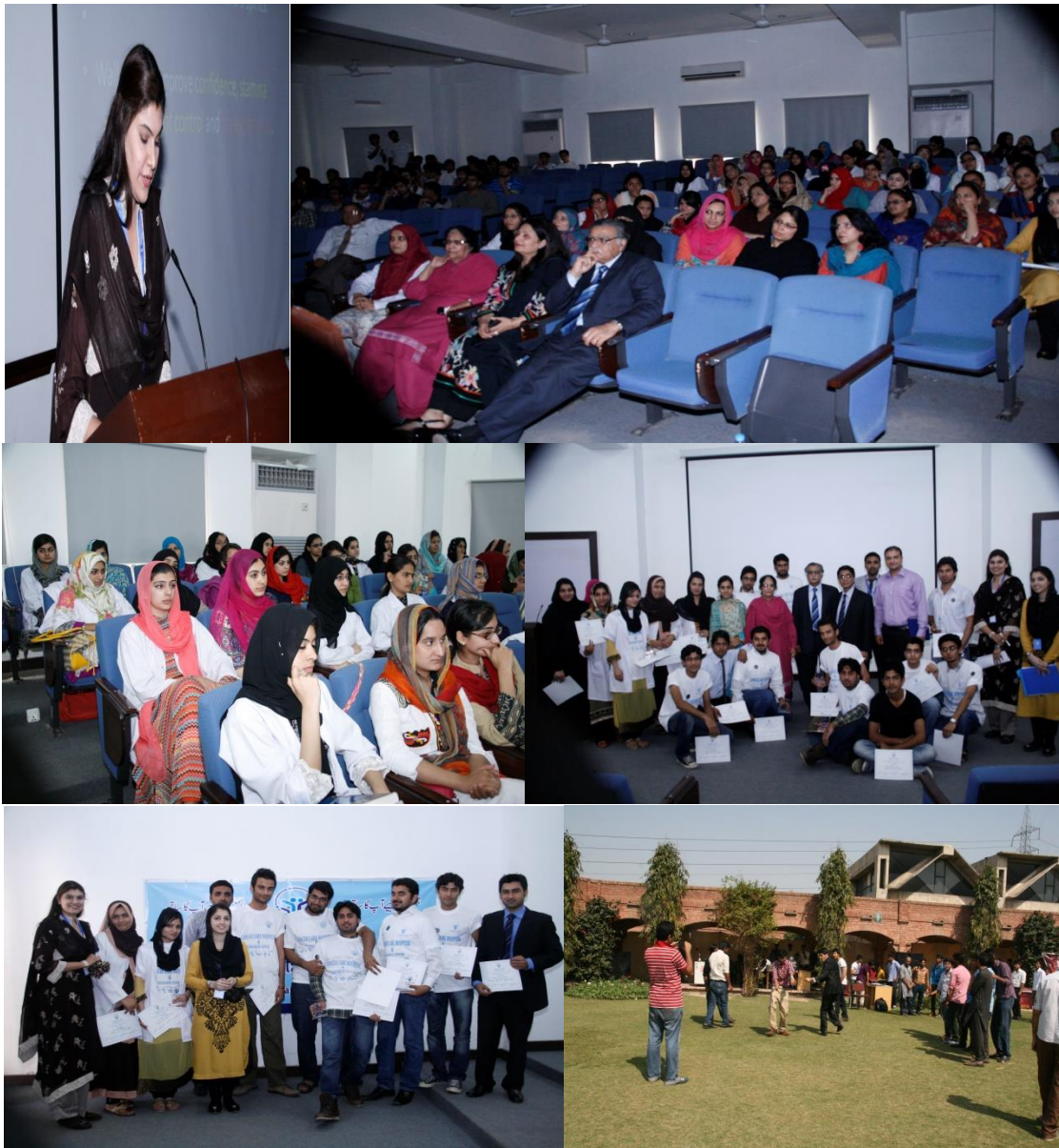
Prevention and Control of Cancer Campaign at Rashid Latif Medical College, Lahore.