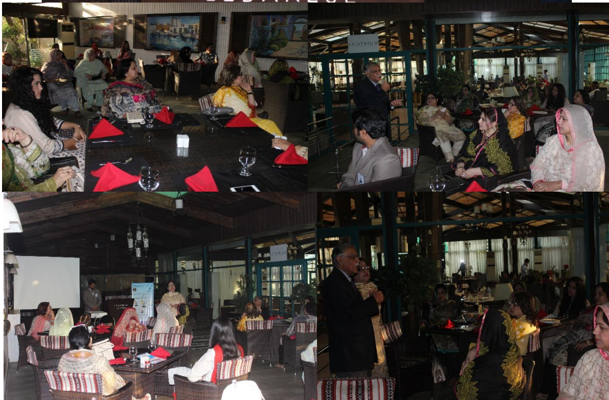
A meeting with Female Ambassadors of Cancer Care Hospital & Research Centre at LA|Atrium restaurant Gulberg Lahore.