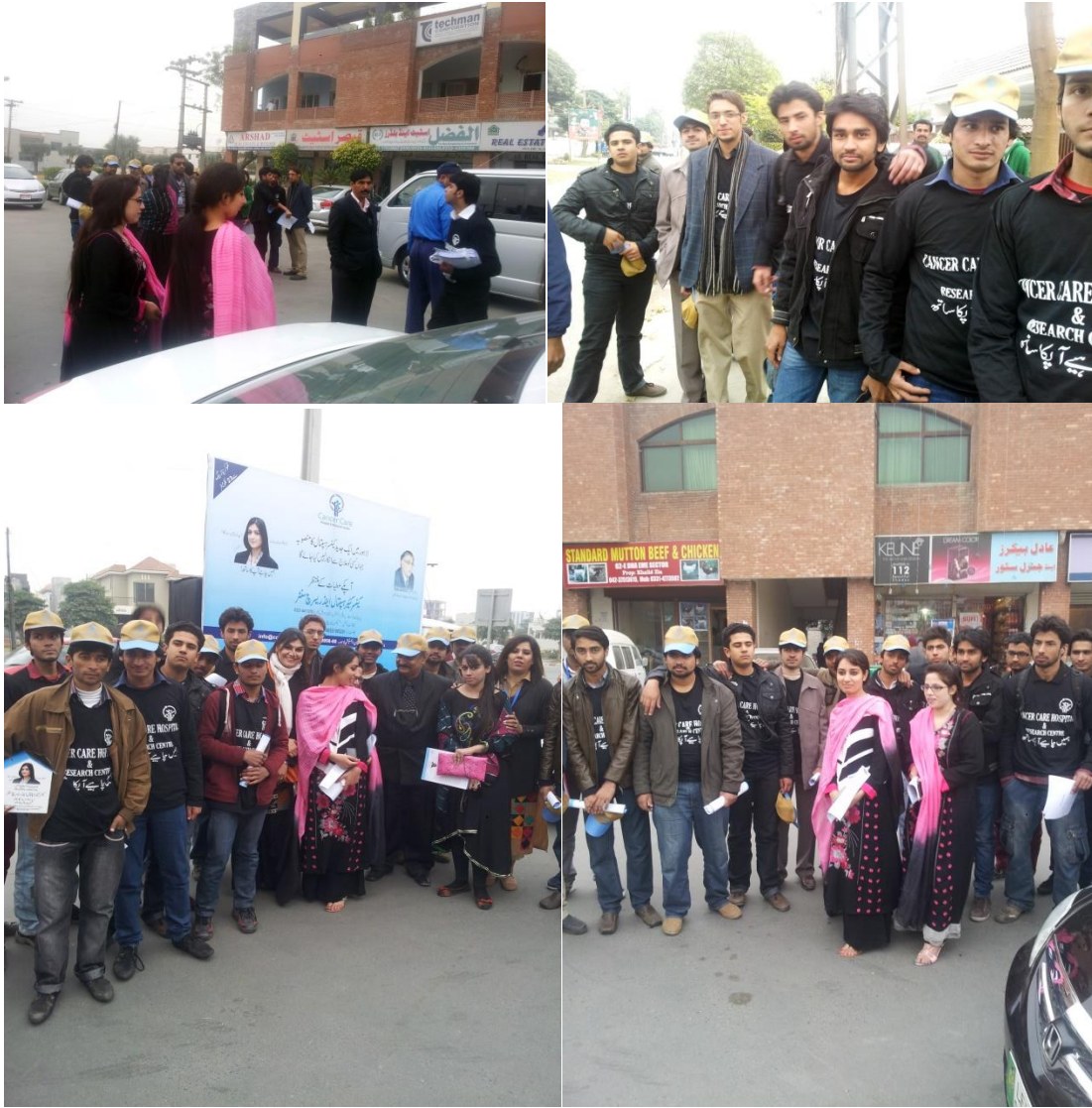
Breast Cancer Awareness & Brochure Distribution Campaign along with volunteers in Bahria Town Lahore.