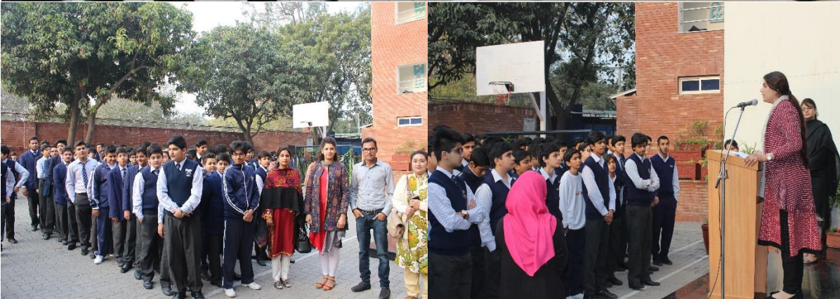
Prevention and Control of Cancer Awareness Campaign at LGS.