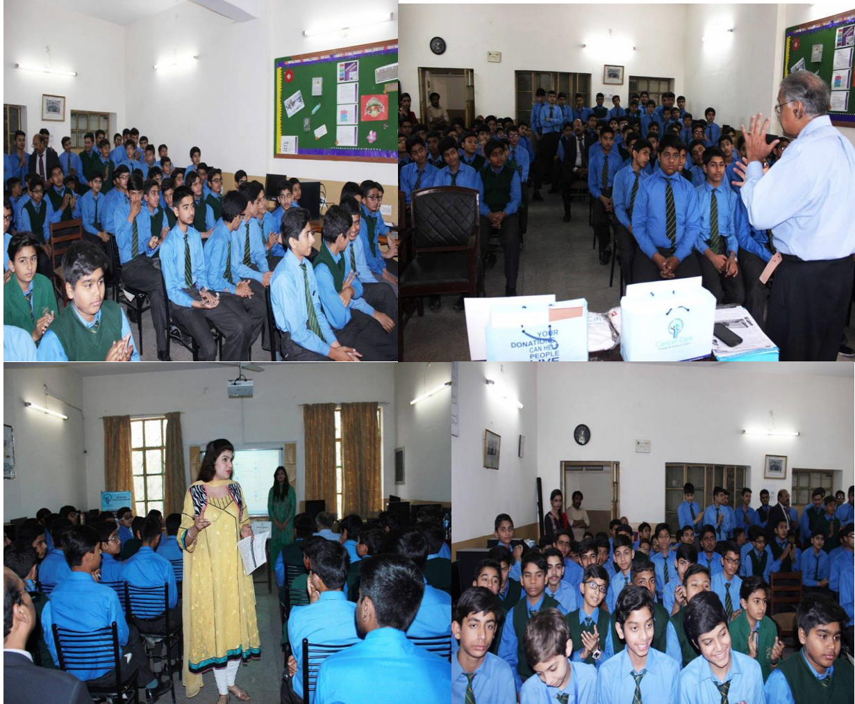
Prevention and Control of Cancer Awareness Campaign at Cathedral 2 High School, Lahore.