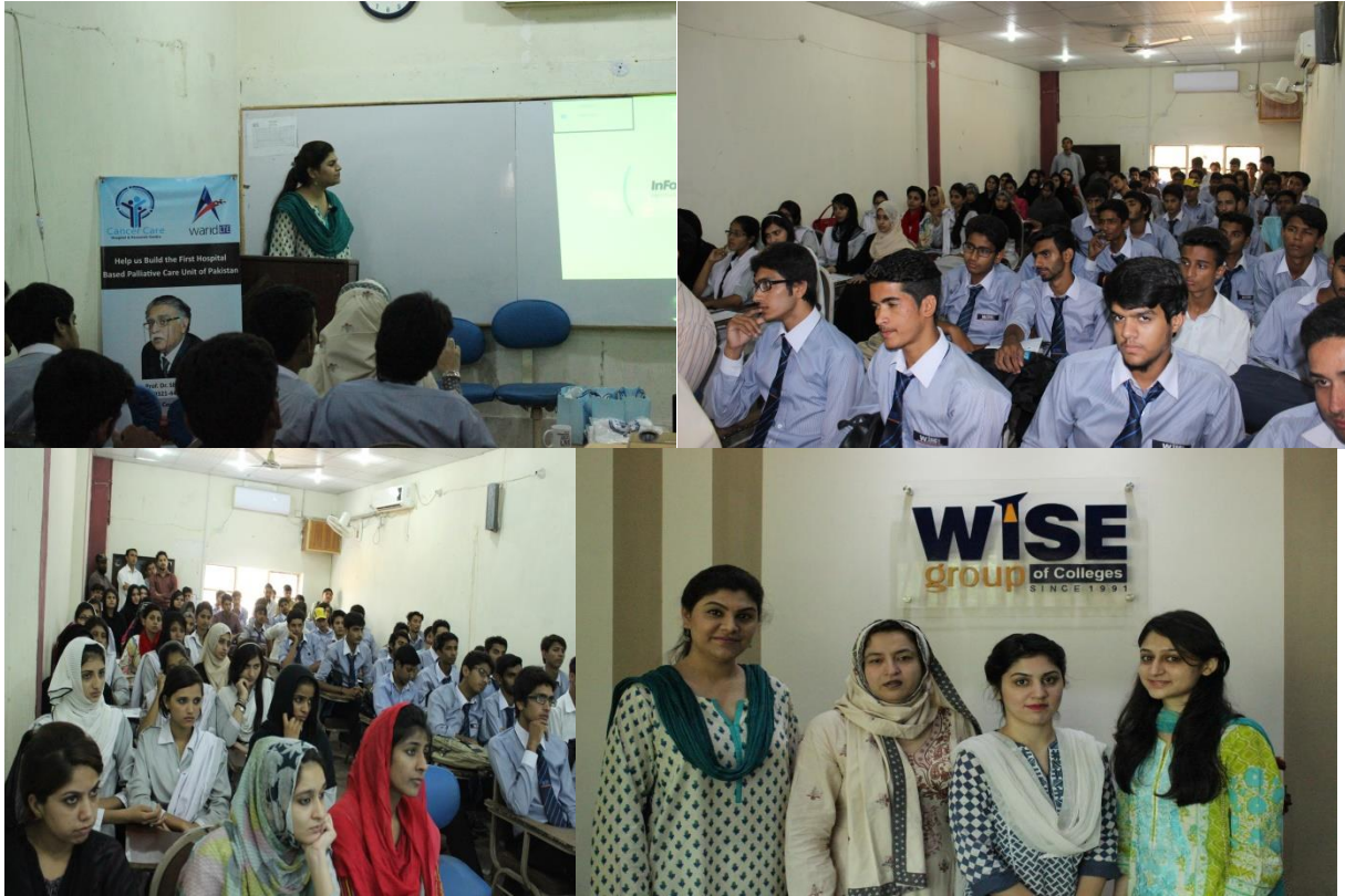
Prevention and Control of Cancer Awareness Campaign at Wise Group of Colleges.