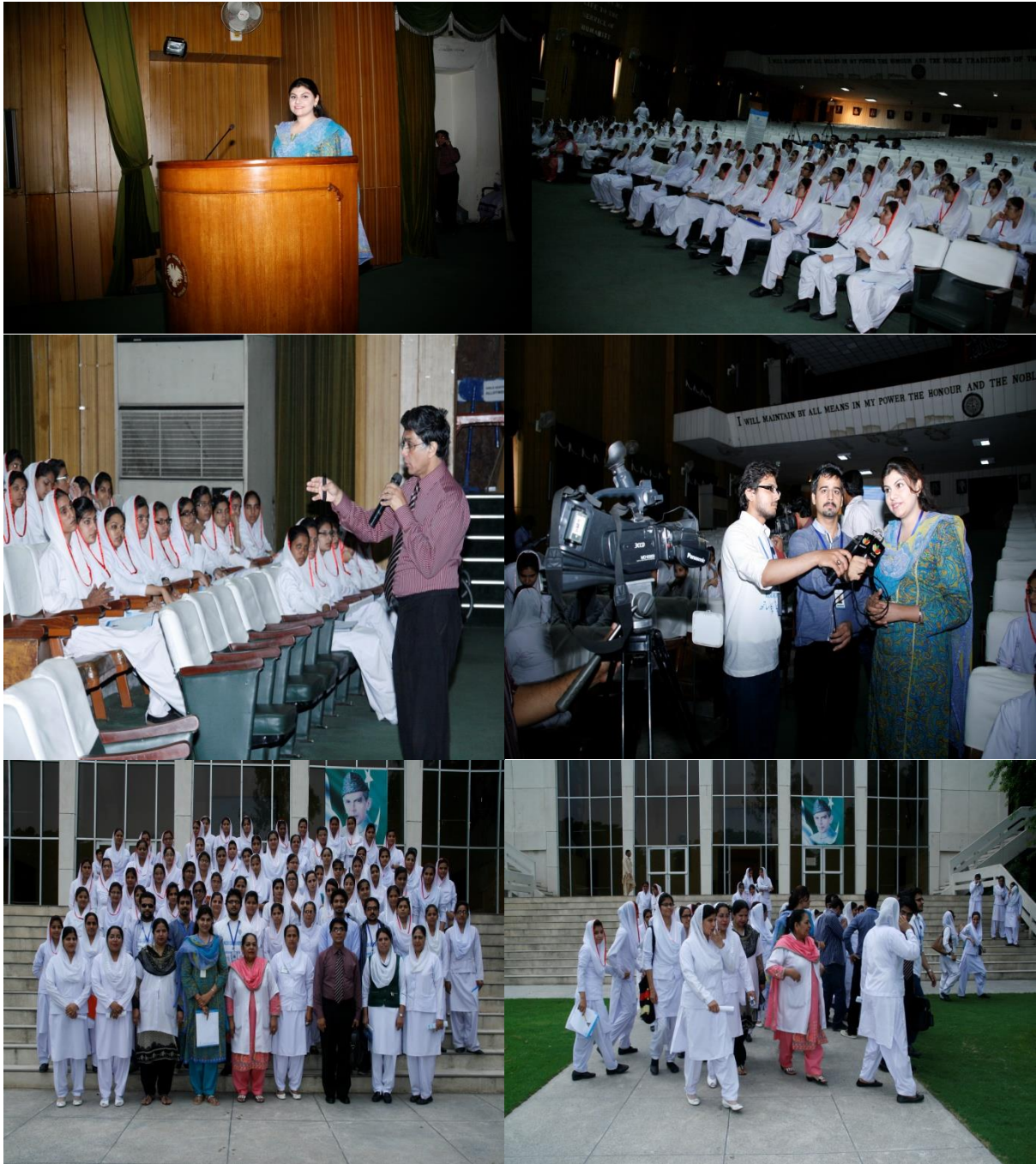
Prevention and Control of Cancer awareness Lecture at Allama Iqbal Medical College & Nursing School, Lahore.