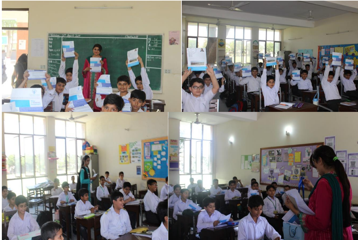
Prevention and Control of Cancer Campaign at Army Public School, Lahore.