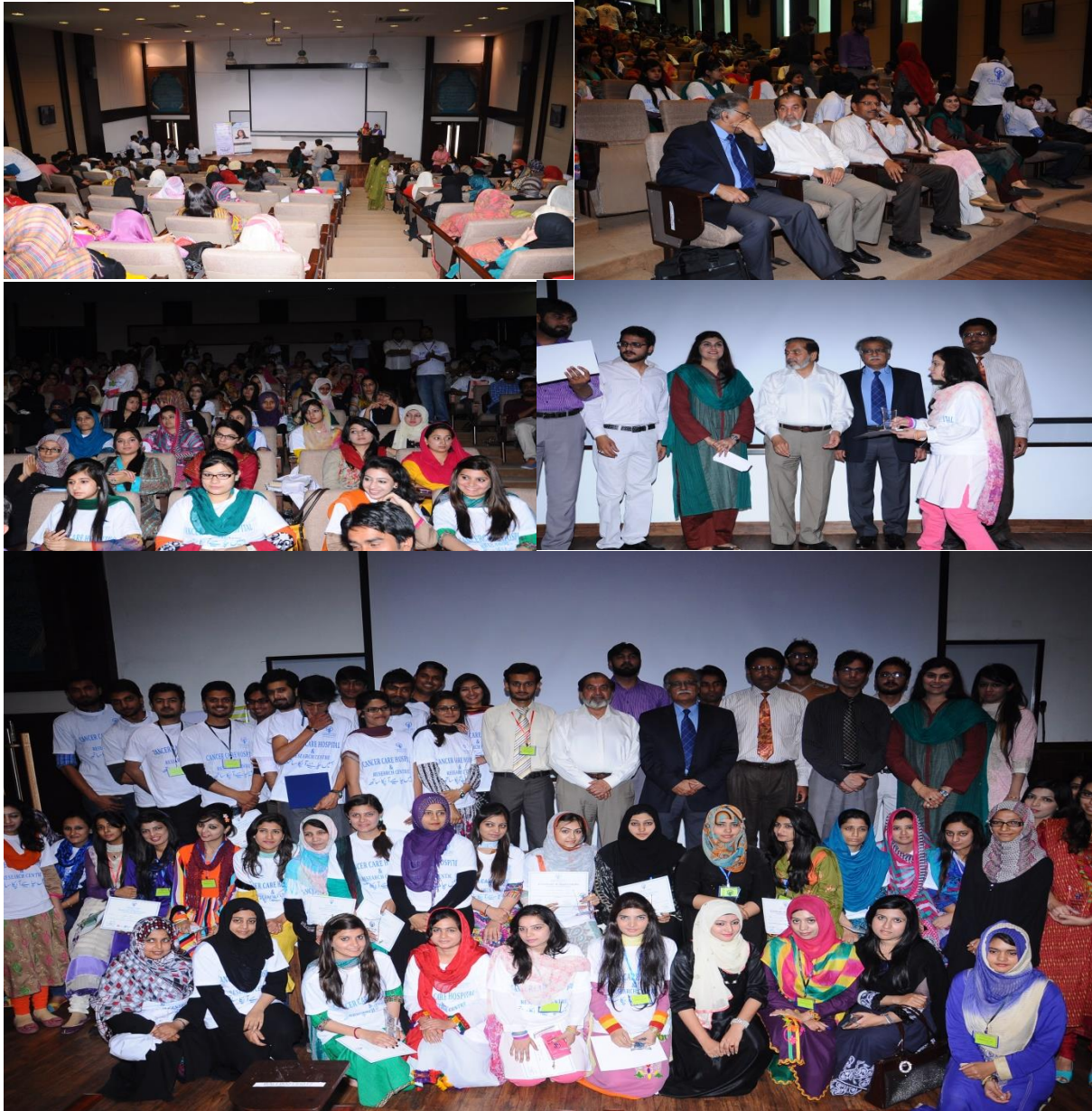
Palliative care symposium at University of Lahore.