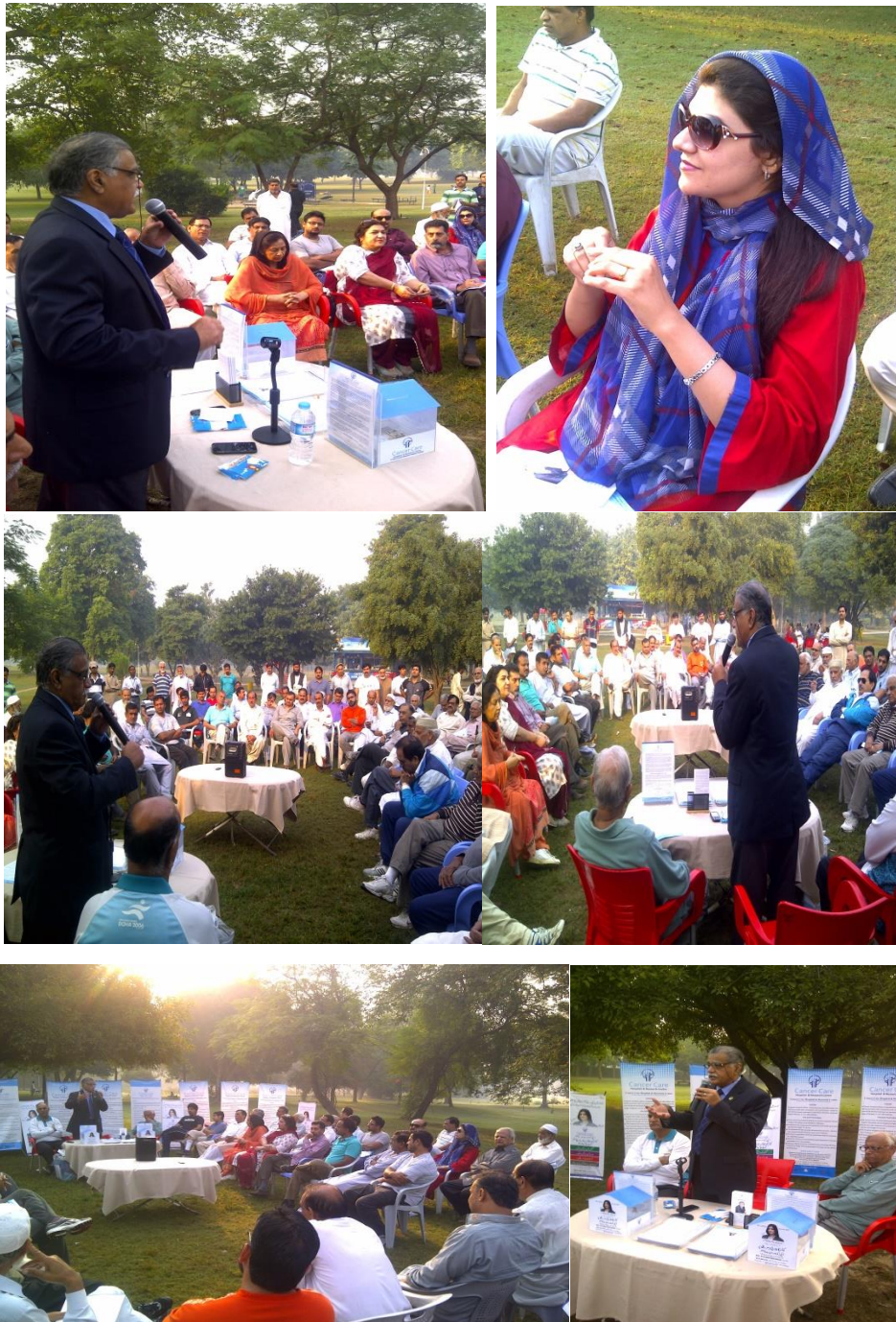
Prevention and Control of Cancer Campaign at Model Town Park, Lahore.