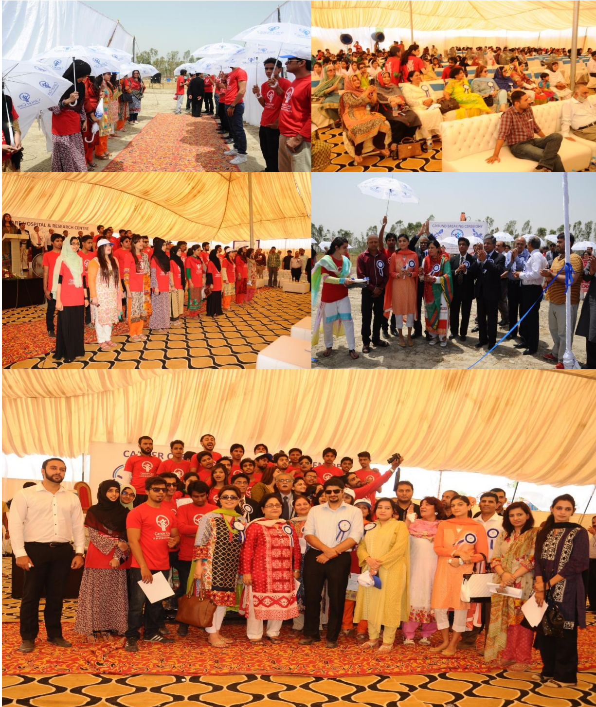
Ground Breaking Ceremony of Cancer Care Hospital & Research Centre.