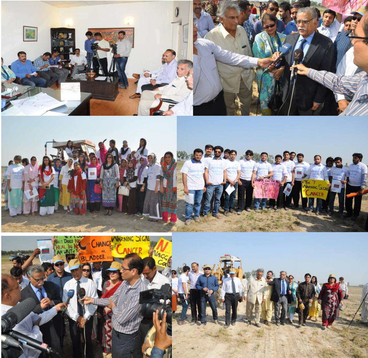
Site Visit and Media Campaign at Cancer Care Hospital & Research Centre Foundation.