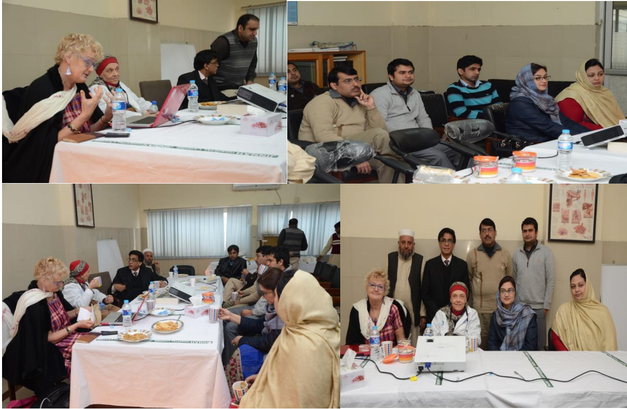
International palliative care workshop at Allama Iqbal Medical College and Press conference.