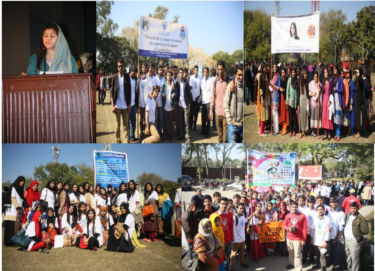
Prevention and Control of Cancer Awareness Campaign on World Cancer Day.