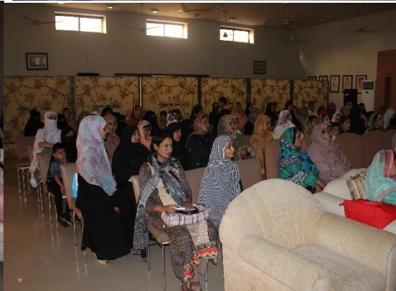
Organized a Cancer awareness meeting with Brigadier Sabir of Pakistan Army.