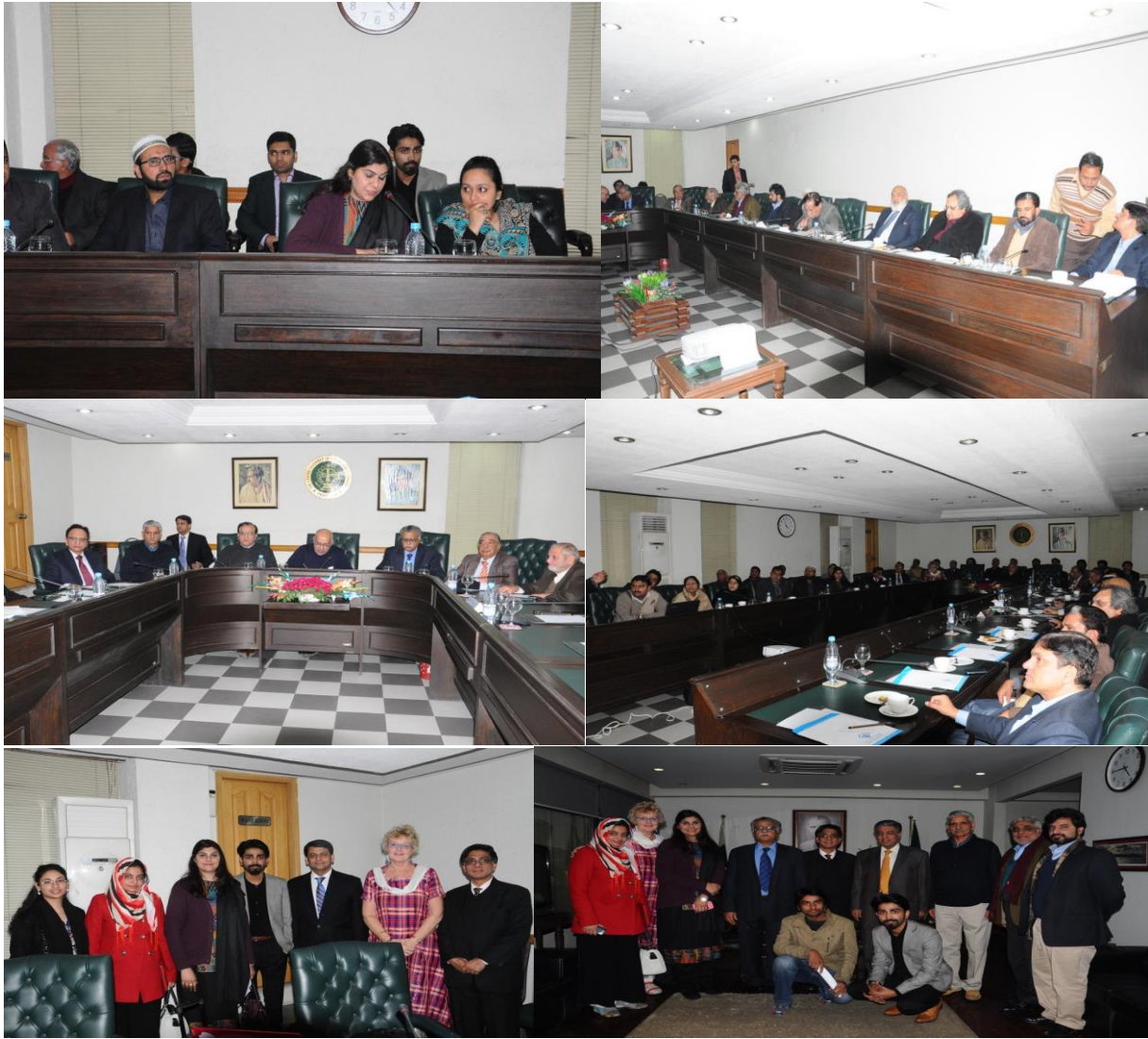
Prevention and Control of Cancer Campaign at Lahore Chamber of Commerce & Industry, Lahore.