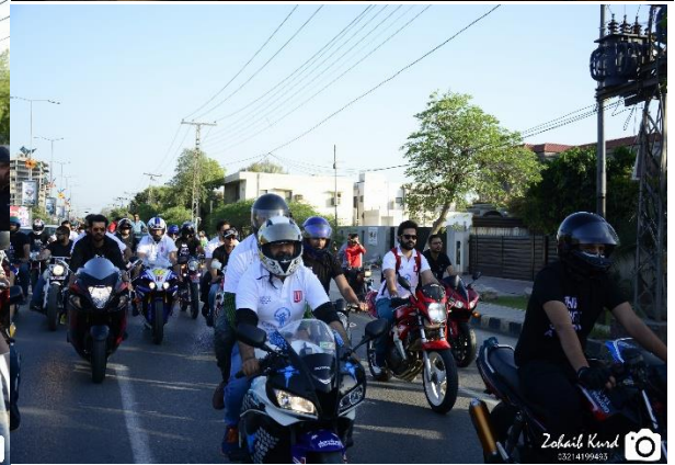
Heavy Bikes Rally to promote Prevention and Control of Cancer Awareness Campaign organized by Cancer Care Hospital & Research Centre, Lahore.