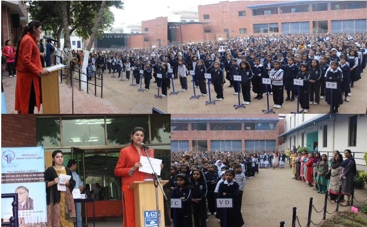
Prevention and Control of Breast Cancer Awareness Lecture at LGS.