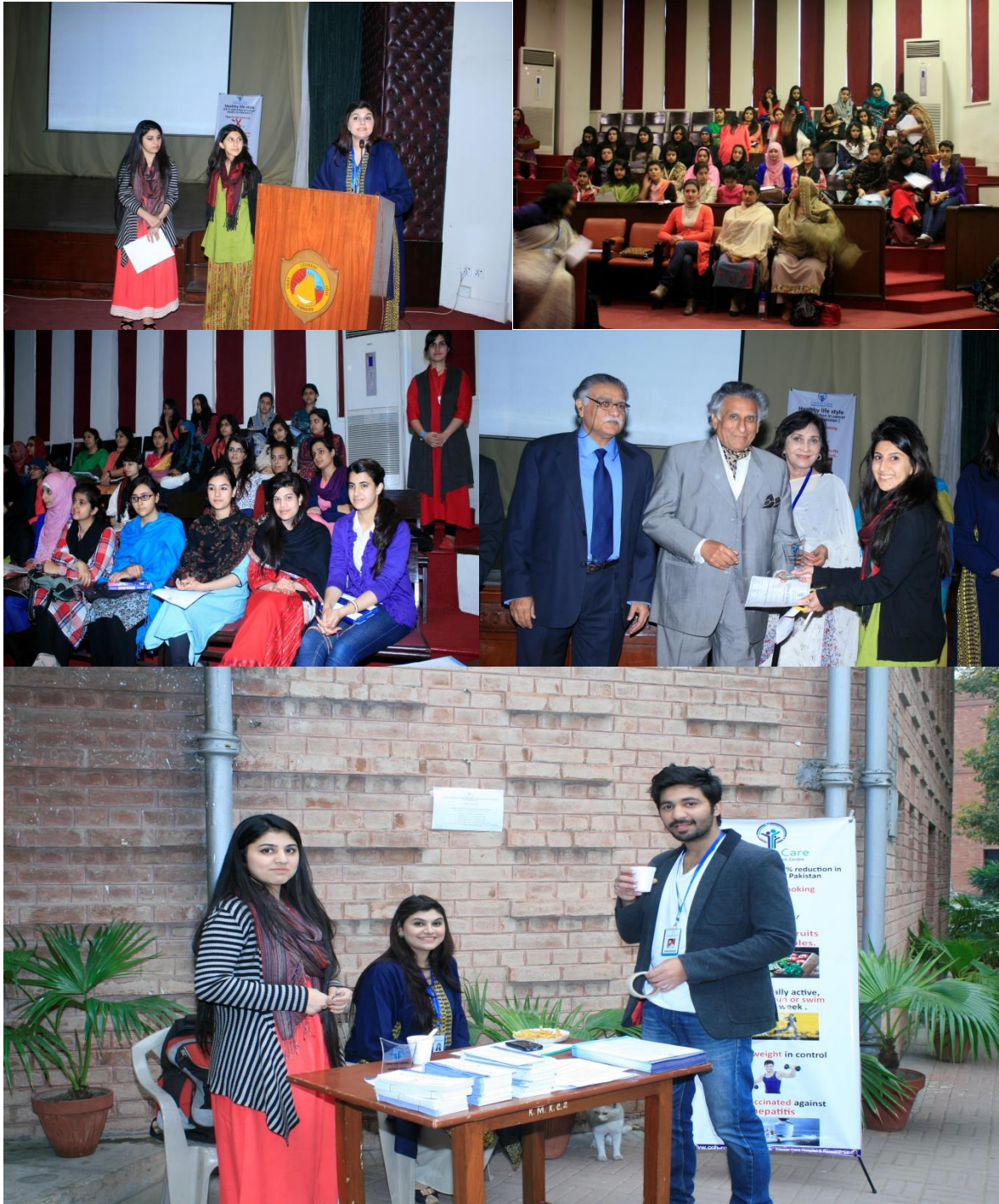
Breast Cancer & Cancer Prevention and Control Lecture at Kinnaird College Lahore.