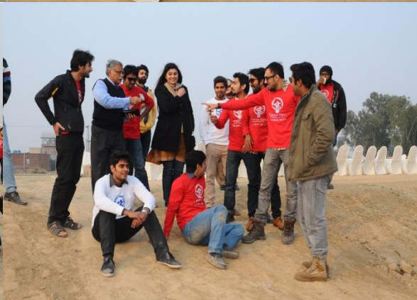
National Anthem at Site of Cancer Care Hospital and Research Centre, Lahore.