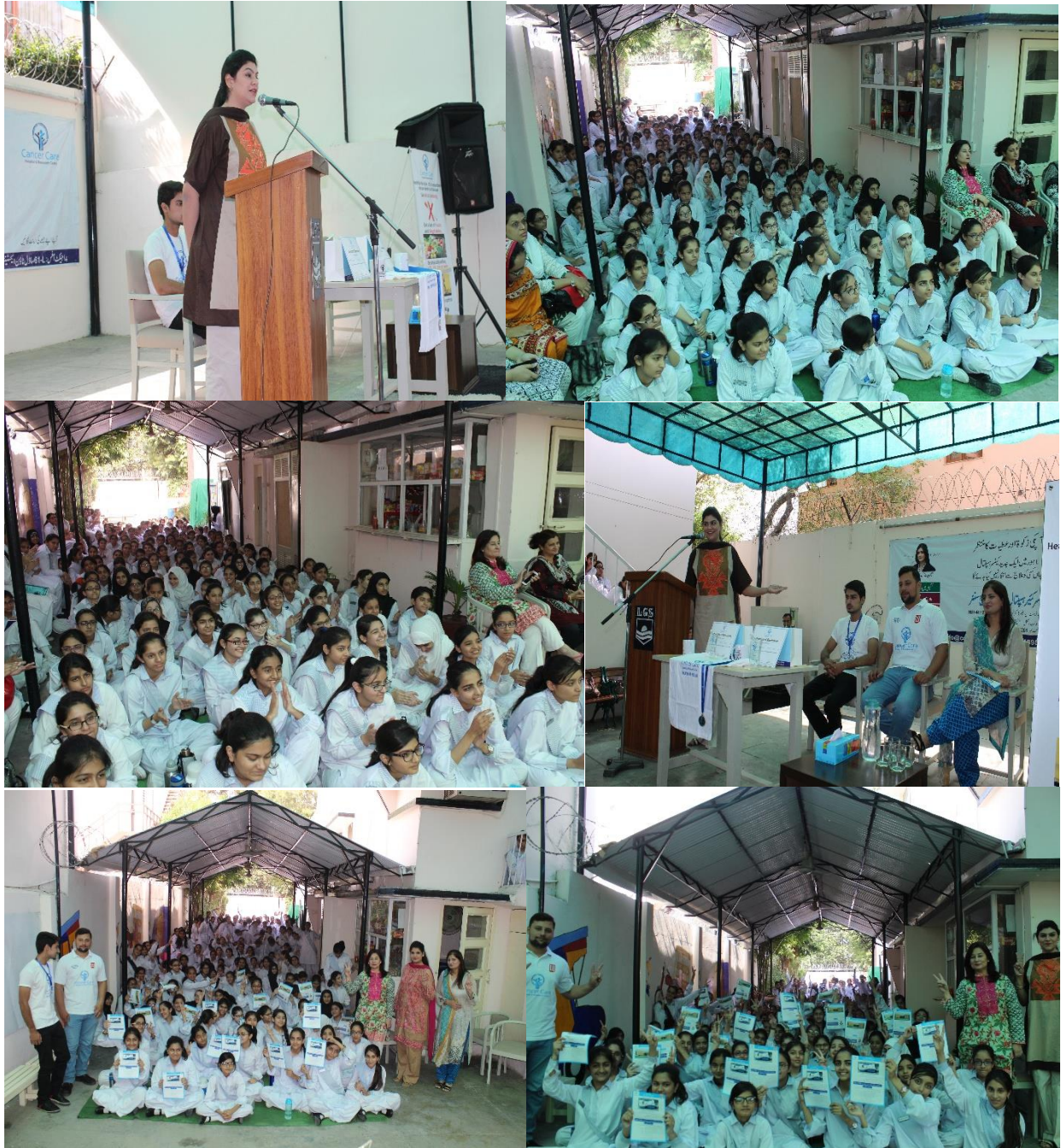
LGS 137-E Model Town Branch Prevention and Control of Cancer Awareness Campaign of Cancer Care Hospital & Research Center regarding Radiation Block and Mammography Awareness.