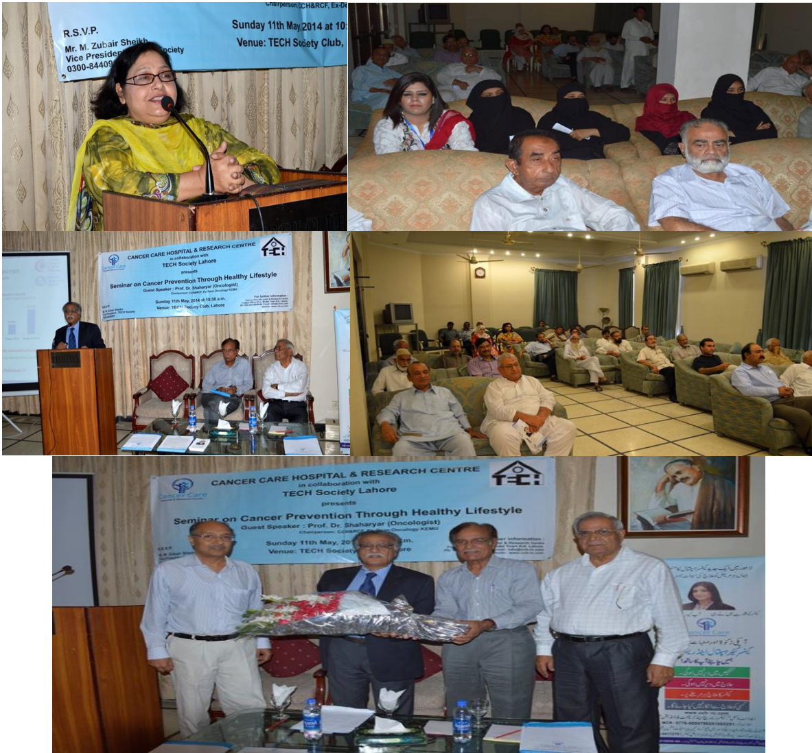
Prevention and Control of Cancer Campaign at Tech Society, Lahore.