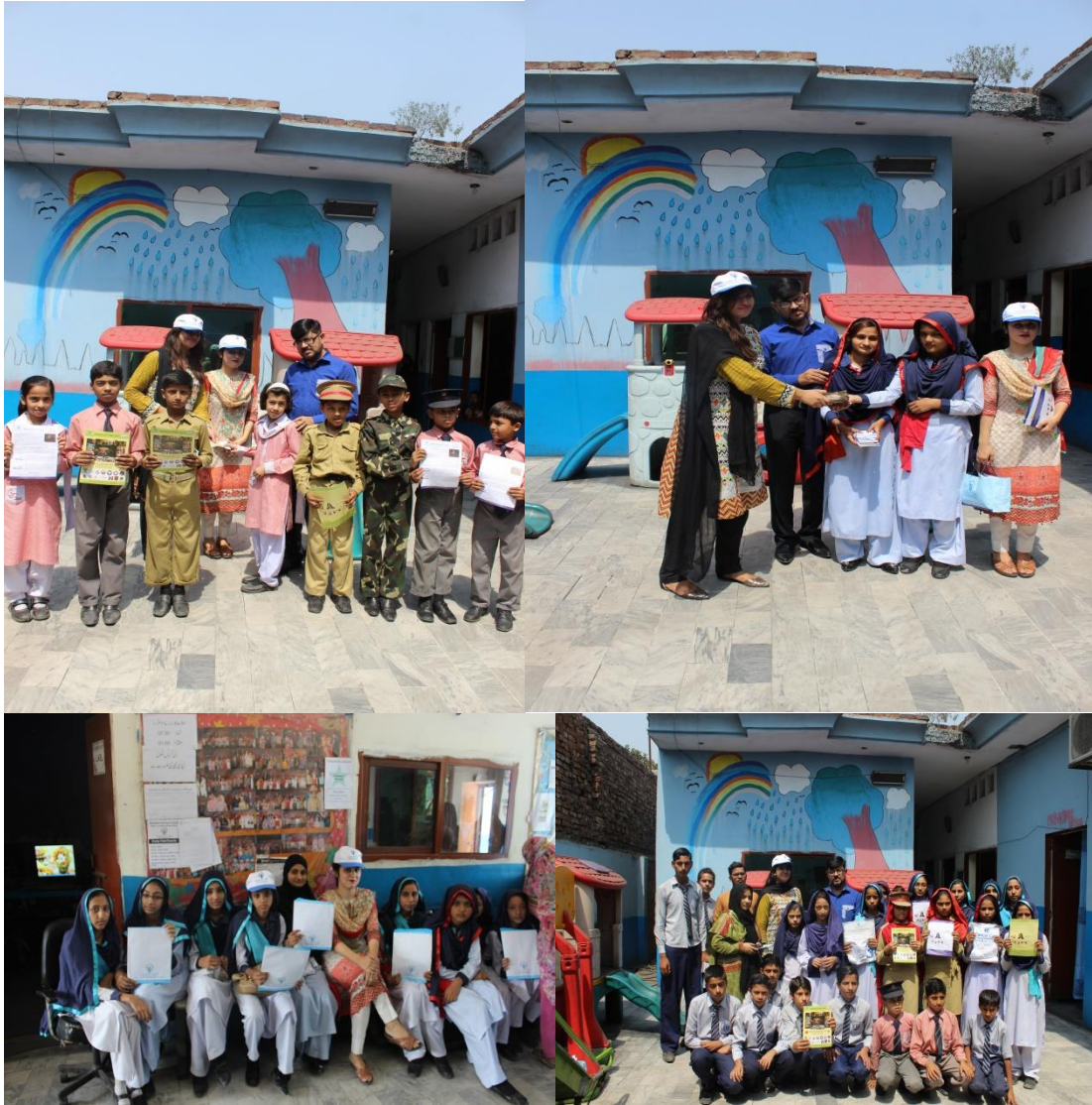
Prevention and Control of Cancer Awareness Campaign at English Grammar School, Lahore.