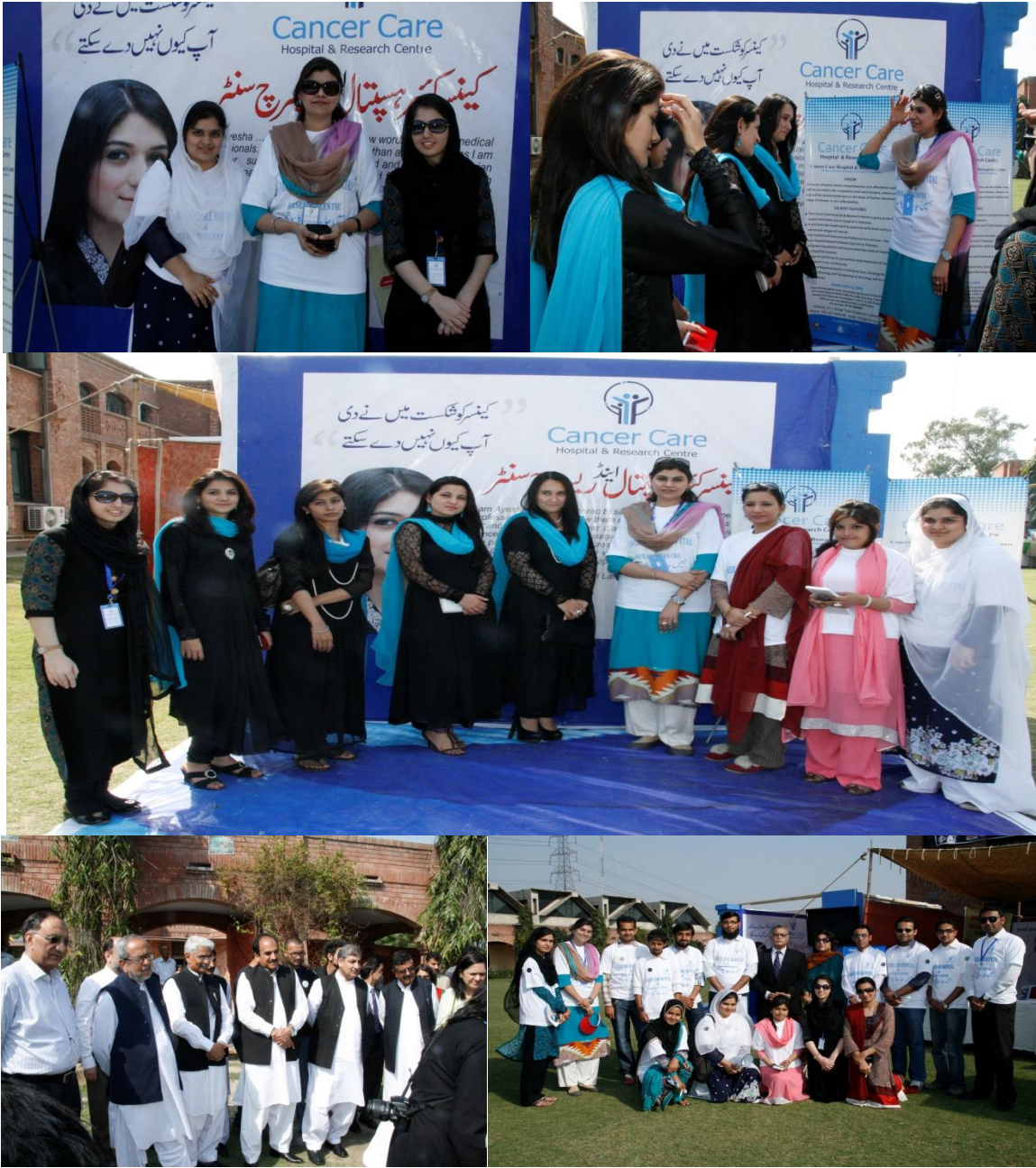
Prevention and Control of Cancer Campaign at COMSATS Lahore.