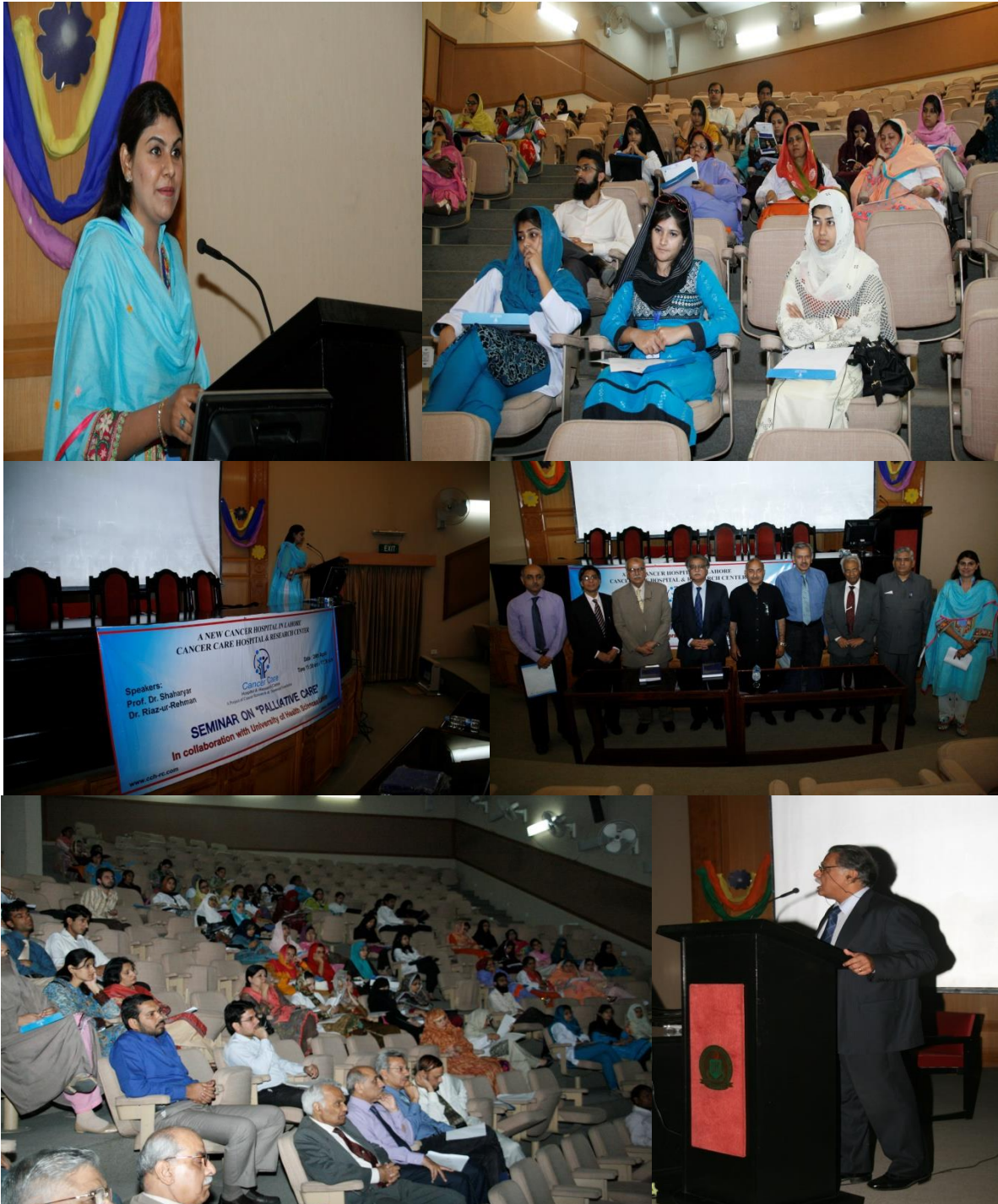
Prevention and Control of Cancer Campaign at University of Health Sciences, Lahore.