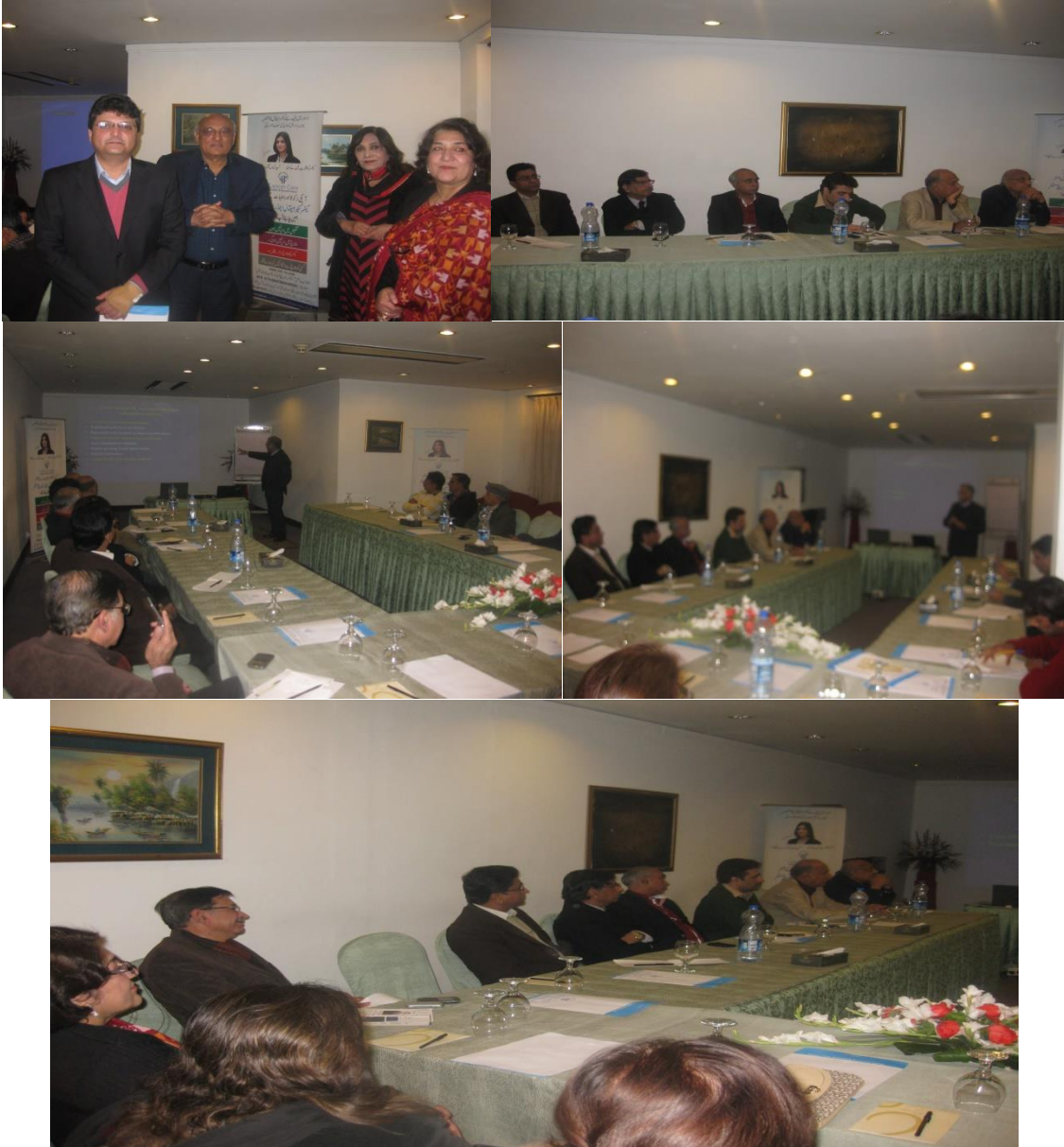
Healthy Life Style Lecture with Poets and Writers at PC hotel Lahore.