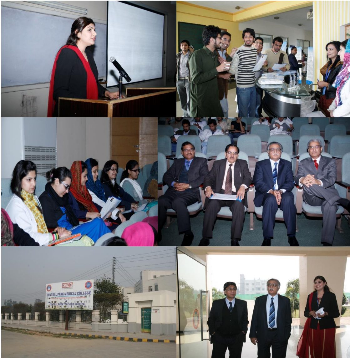
Prevention and Control of Cancer Campaign at Central Park Medical College, Lahore.