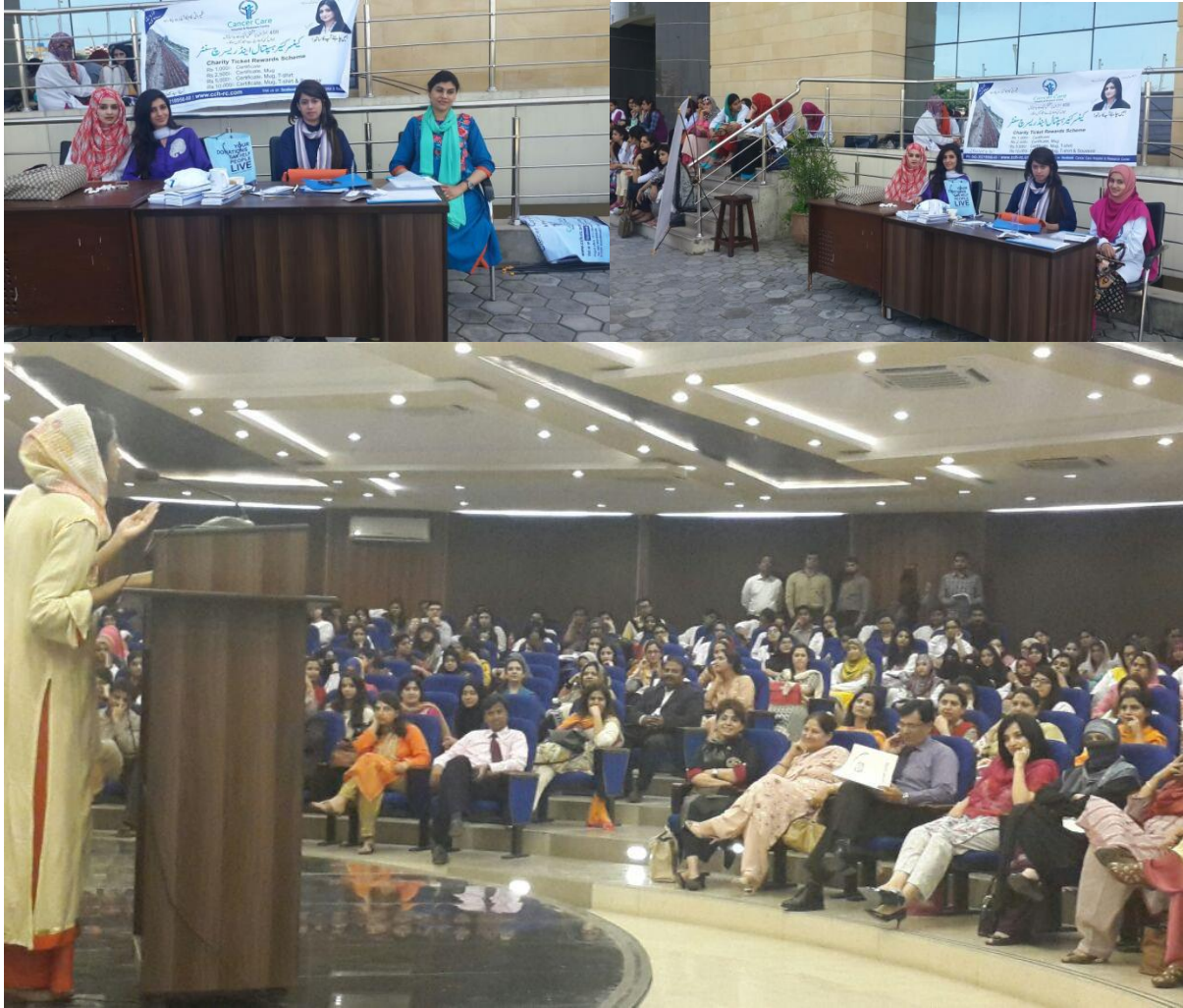
Prevention and Control of Cancer Campaign at Lahore Medical & Dental College.