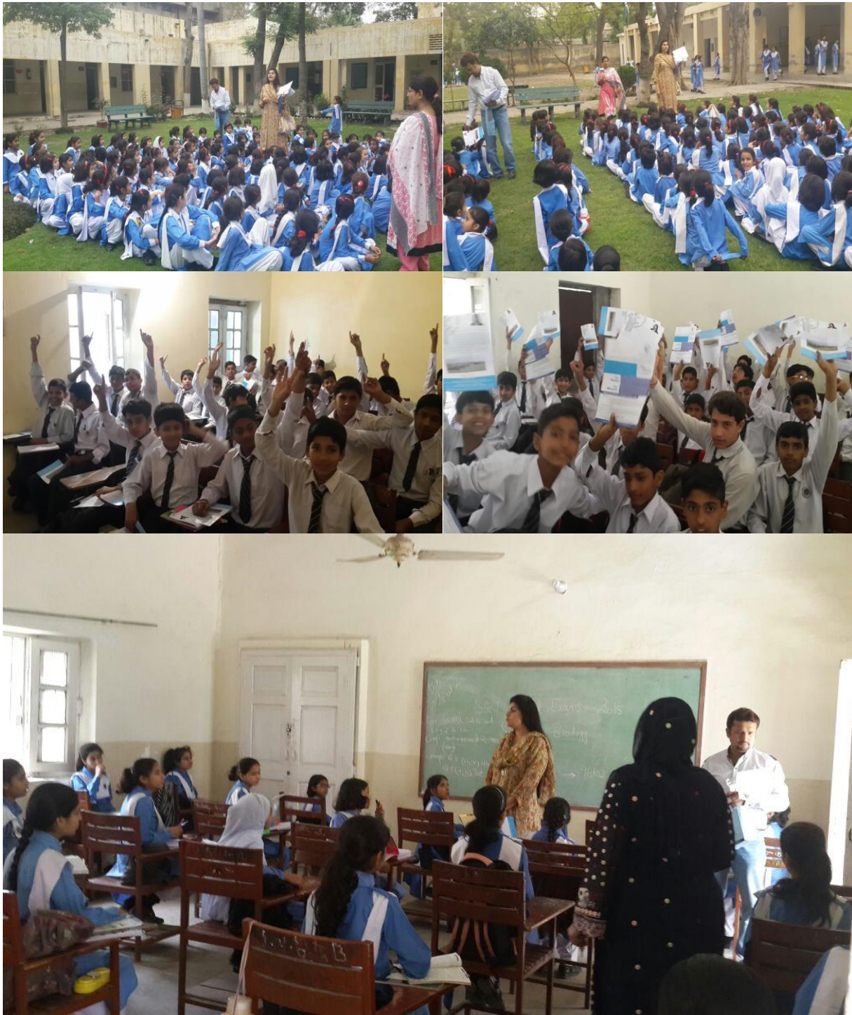
Prevention and Control of Cancer Awareness Campaign at Federal Government School, Lahore.