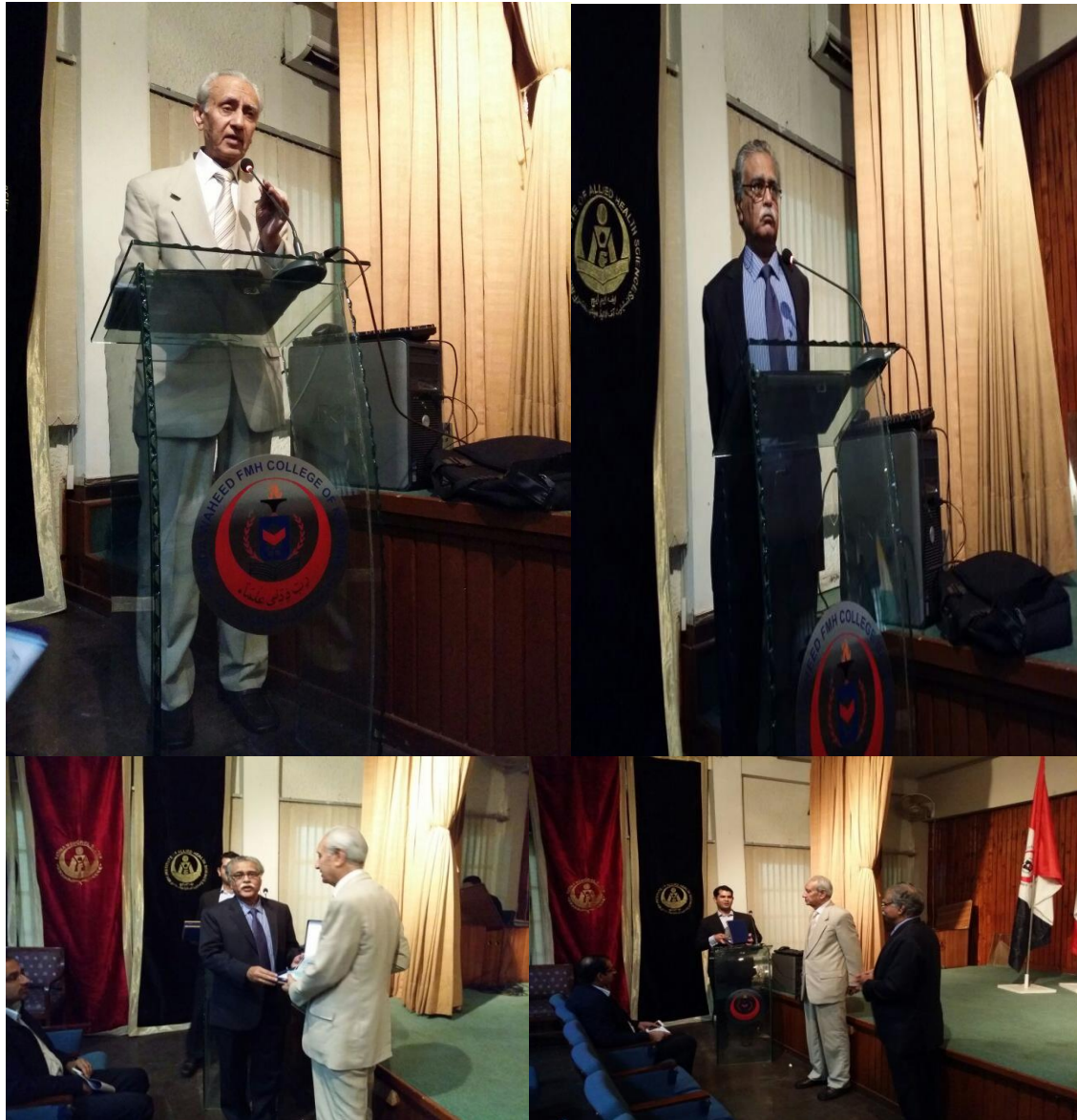
Prevention and Control of Cancer Campaign at Fatima Memorial Hospital Lahore.