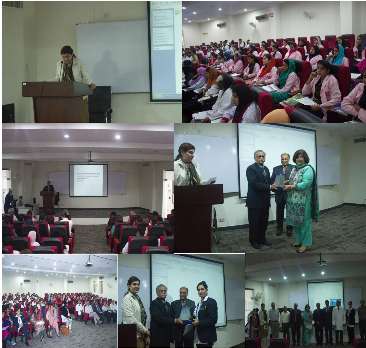
Prevention and Control of Cancer Awareness Campaign at Sharif Medical City.