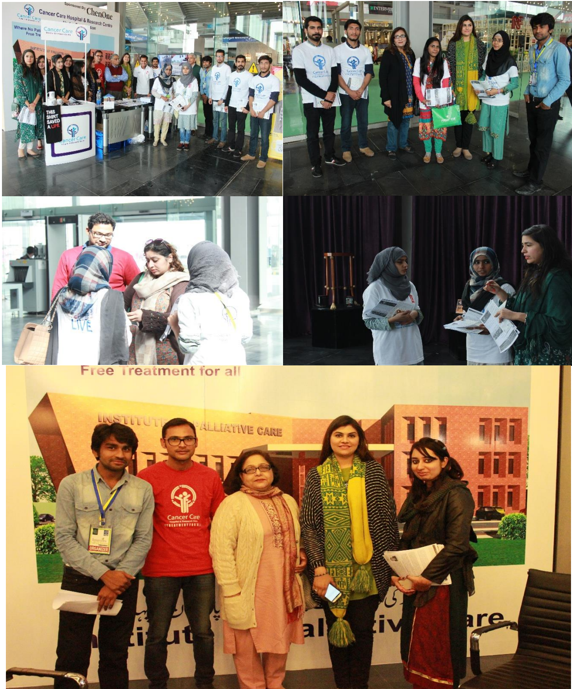
Cancer Care Hospital Awareness Campaign at Expo International Lahore.