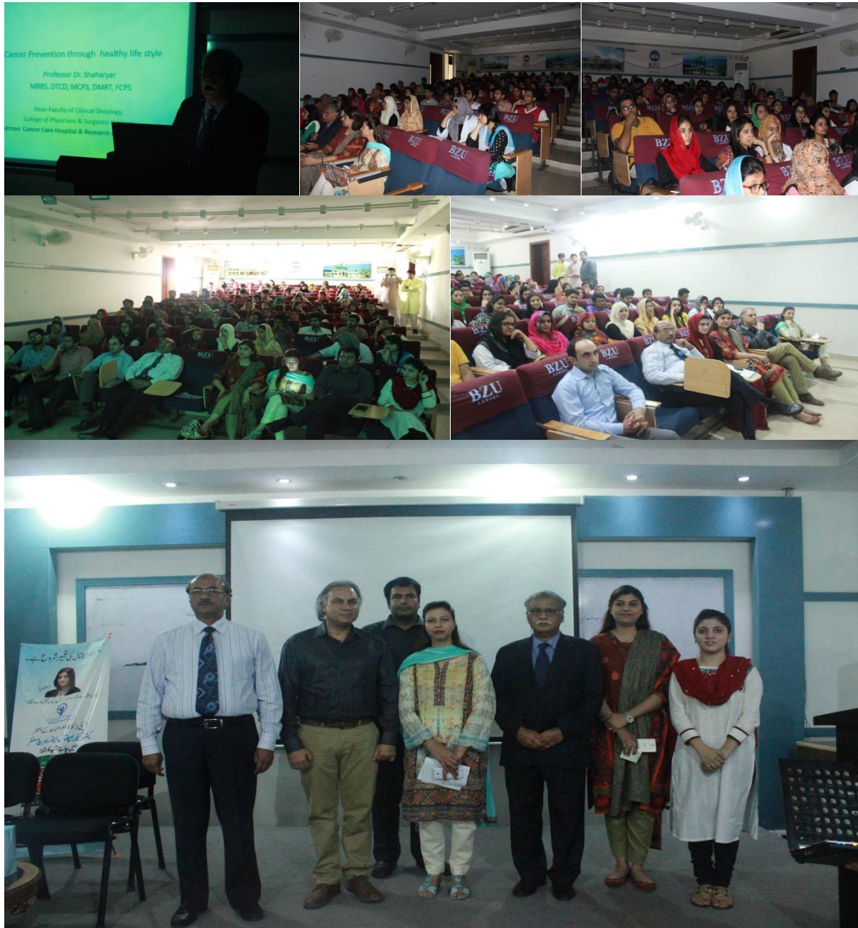
Prevention and Control of Cancer Awareness Campaign at Bahauddin Zakriya University Lahore Campus.