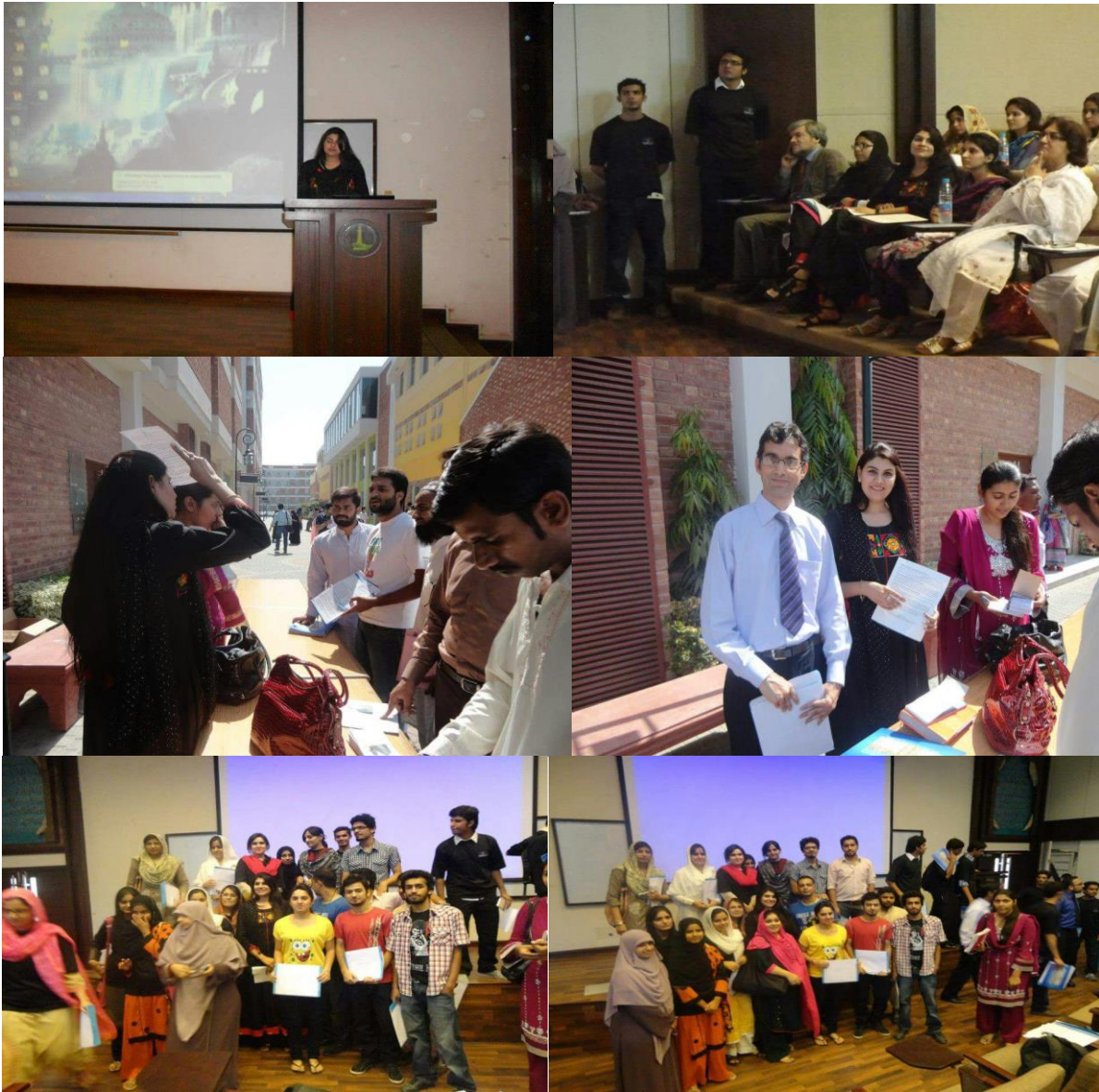
Prevention and Control of Cancer Campaign at University of Lahore.