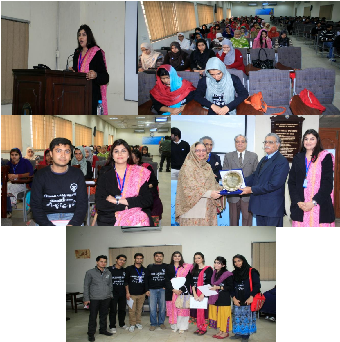
Breast Cancer Awareness Seminar at Hailey College of Commerce, University of the Punjab, Lahore.