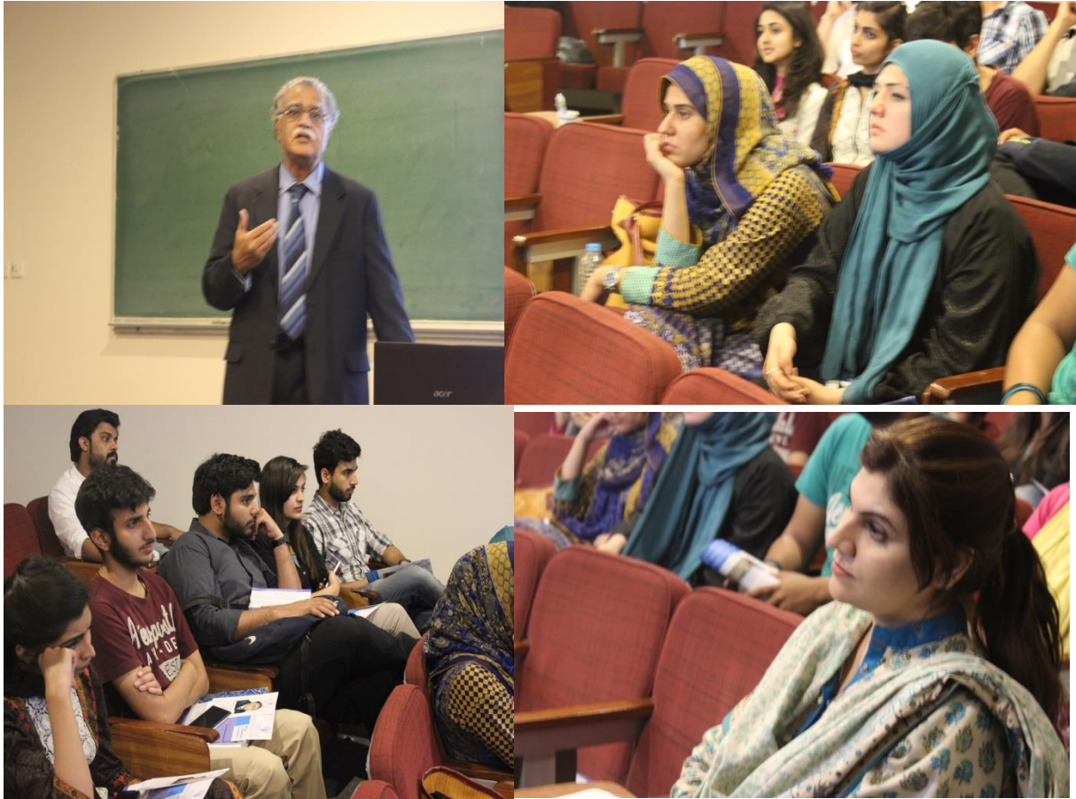
Prevention and Control of Cancer awareness Campaign at Lahore University of Management Sciences, Lahore.