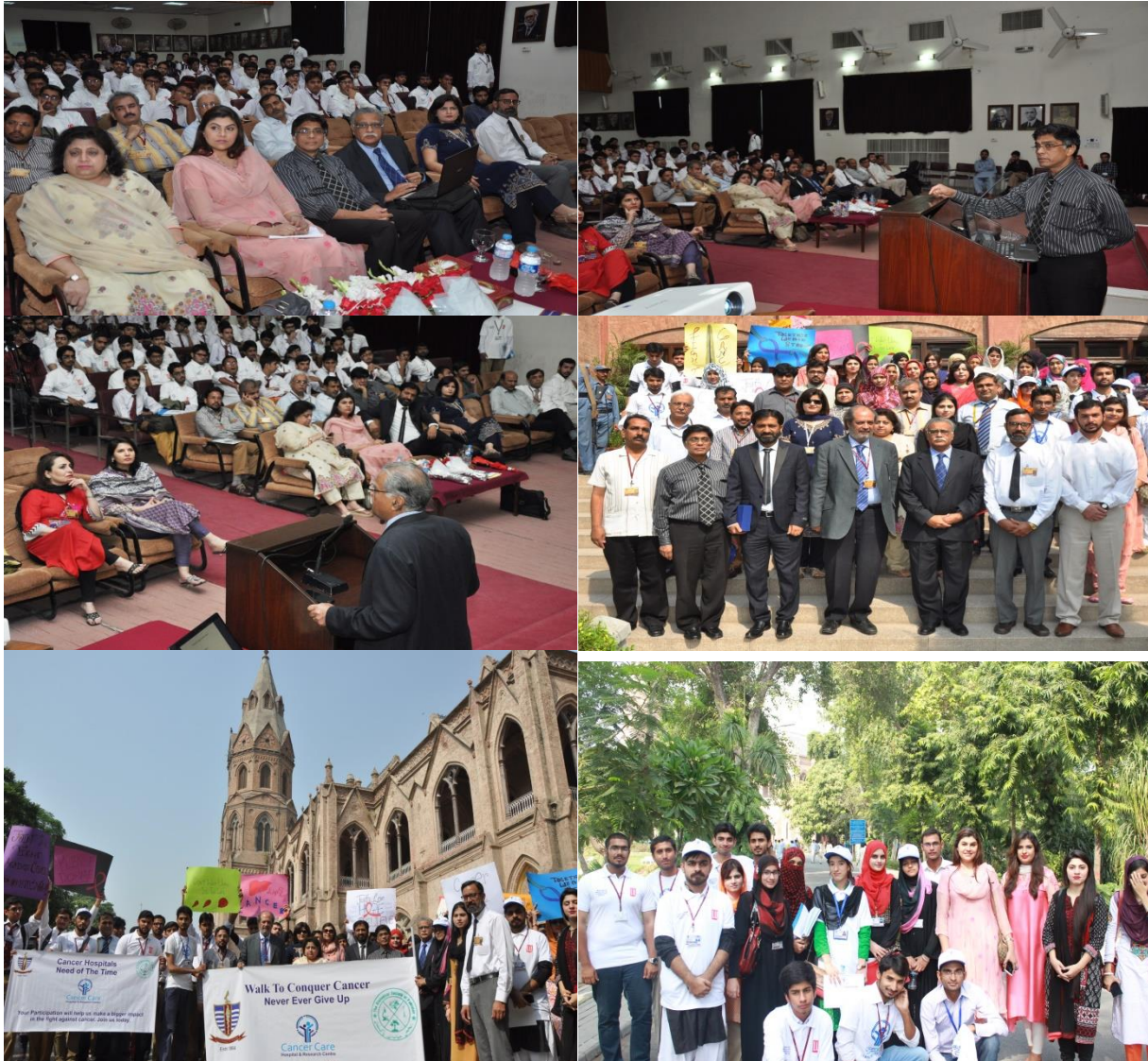
International Cancer Prevention and Treatment Conference GCU, Lahore.