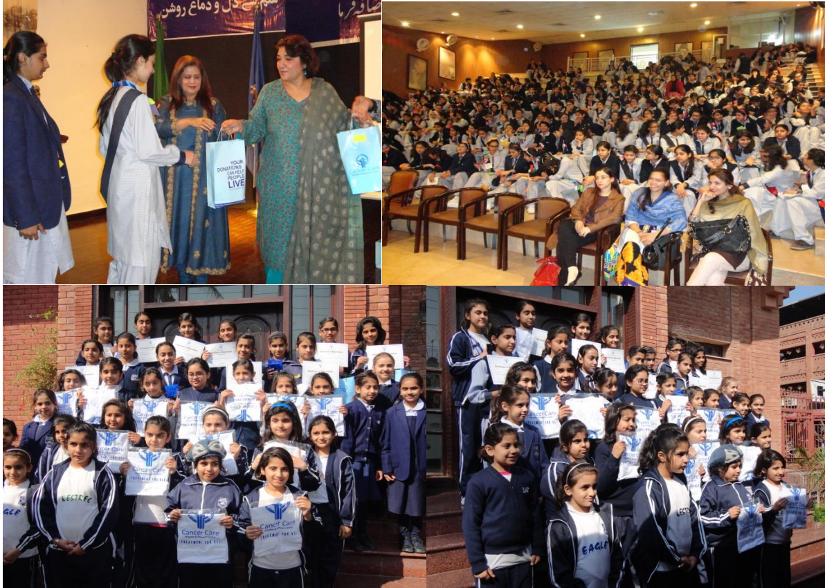
Prevention and Control of Cancer Awareness Lecture at Lahore Grammar School.