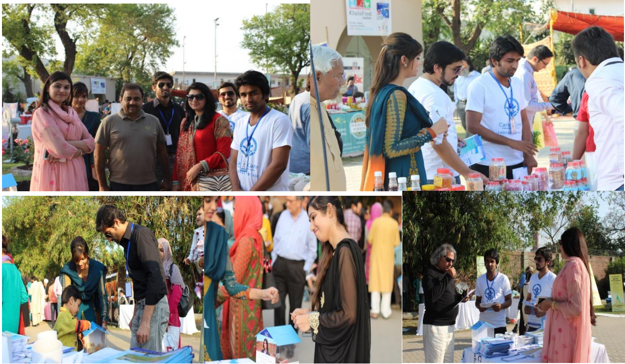
Prevention and Control of Cancer Awareness Stall at Royal Palm Club Lahore.