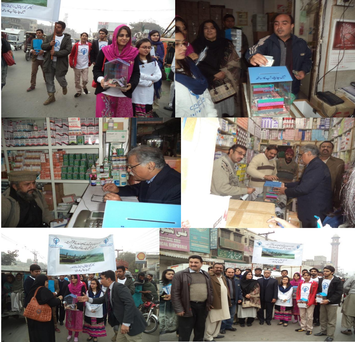
Lohari market Prevention and Control of Cancer Campaign.