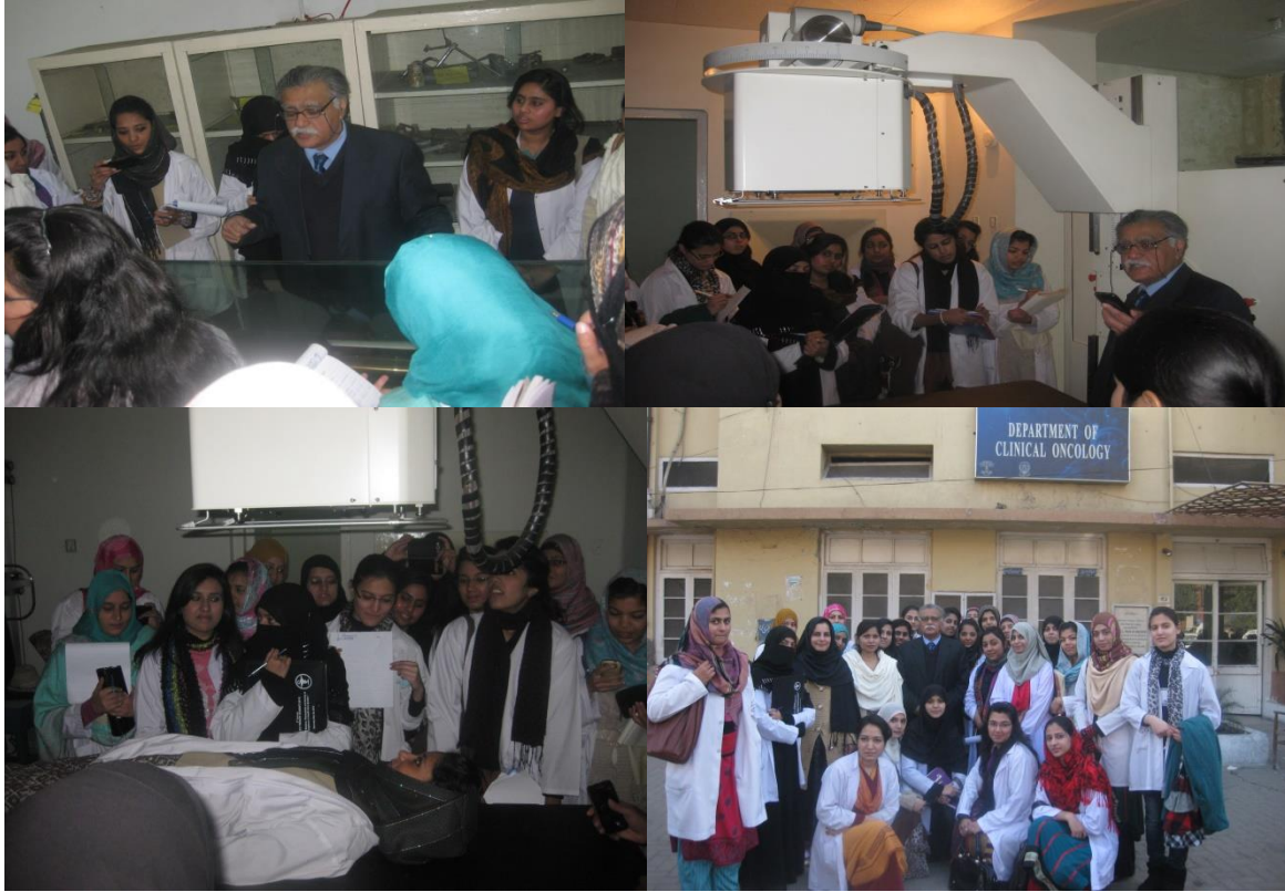
Training Workshop on Radiology; Students of University of King Edward & Mayo Hospital, Lahore.